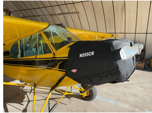
Piper PA-11 Replica Insulated Engine Cover