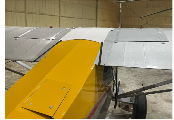
Piper J5A Windshield/Skylight Cover, test fit