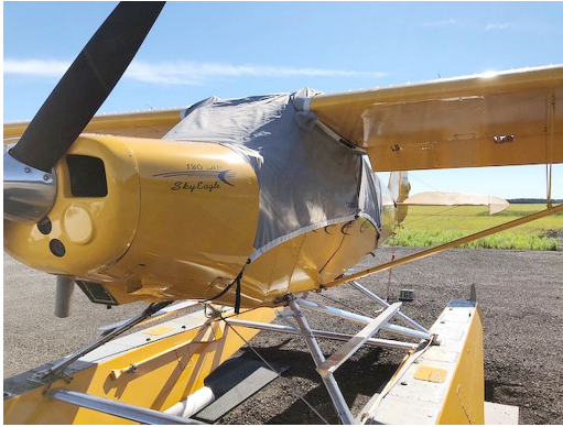
Sportsman 2+2 Wag Aero Light Weight Over the Top Travel Canopy Cover

This cover type is made from Silver Acrylic Sunbrella canvas and is 100% lined with a soft and smooth microfiber. Bruce's Custom Covers developed this material combination especially for aircraft protection. The outer material is medium weight and treated for water resistance, UV resistance and anti-static buildup. The inner lining is a very soft and smooth microfiber to prevent scratching. The material is very reflective, and tests show that the cabin interior temperature can be reduced to near-ambient temperature on the hottest of days. It is water, ice and snow repellent, yet breathable to allow moisture to escape from between the cover and the aircraft surface.