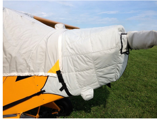
Piper J-3 Cub Insulated Engine Cover with added Pre-heater Access Flaps