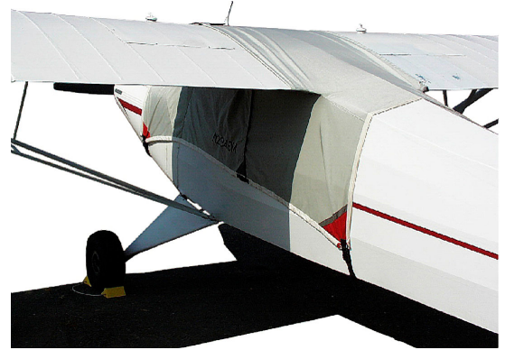
Sportsman 2+2 Wag Aero Light Weight Over the Top Travel Canopy Cover Piper PA-12 Super Cruiser Over-Top Canopy Cover