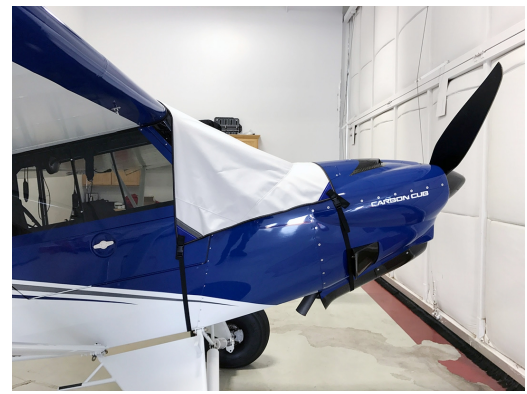
Cub Crafters CC-11 Windshield Cover