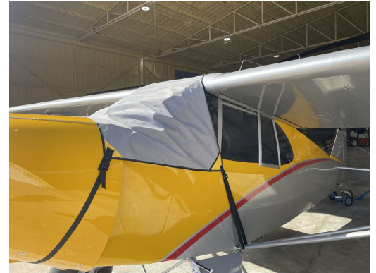
Piper PA-18 Windshield/Skylight Cover