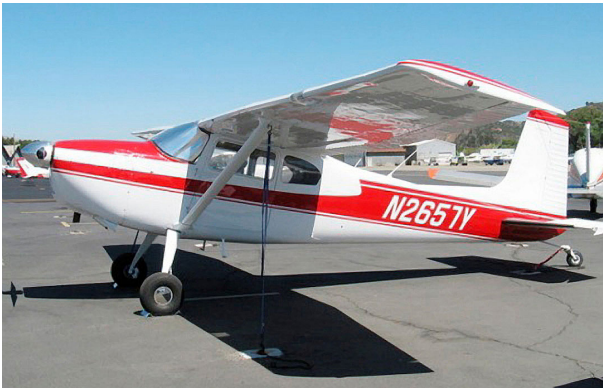
Cessna 180 & 185 Windshield HeatShield

Windshield Heatshields are interior sunshades for an aircraft's front windshield. The product is a unique composite of closed-cell foam with a silver mylar finish. The semi-rigid design is stiff enough to stand along the inside of the windshield using sun visors or window framing. It folds up flat and easily stores in the included storage sleeve. Some designs may require velcro and suction cups or split right and left sides. A Heatshield is an excellent short-term remedy for cockpit overheating. An external fabric cover is far more effective and practical for long-term protection.