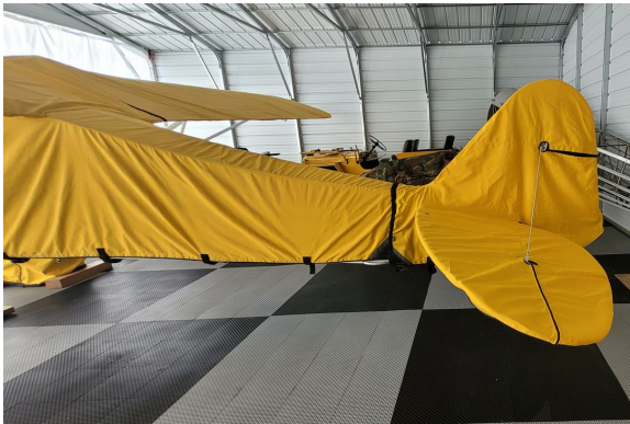
Piper PA-18 Empennage Cover

WINTER USE MATERIAL - Made with Solution-Dyed Polyester fabric, this option is intended for seasonal use to aid in deicing, rain mitigation, or for occasional travel. The material is lighter and more compact, but more susceptible to UV damage and may have a shorter useful life if used continuously outside than the all-year use material.