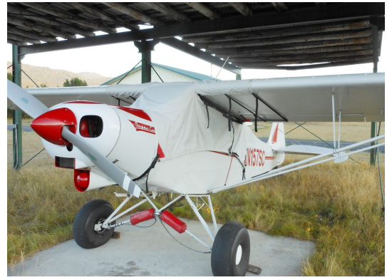
Piper PA-18 Super Cub Canopy Cover, Extends To Cover Gas Caps