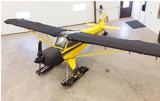
Aviat Husky Insulated Engine Cover, Wing Covers

This cover type is made from Silver Acrylic Sunbrella canvas and is 100% lined with a soft and smooth microfiber. Bruce's Custom Covers developed this material combination especially for aircraft protection. The outer material is medium weight and treated for water resistance, UV resistance and anti-static buildup. The inner lining is a very soft and smooth microfiber to prevent scratching. The material is very reflective, and tests show that the cabin interior temperature can be reduced to near-ambient temperature on the hottest of days. It is water, ice and snow repellent, yet breathable to allow moisture to escape from between the cover and the aircraft surface.