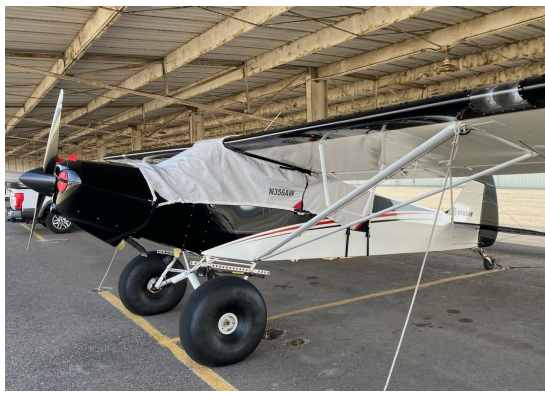
Piper PA-18 Super Cub Canopy Cover, Over Top Type