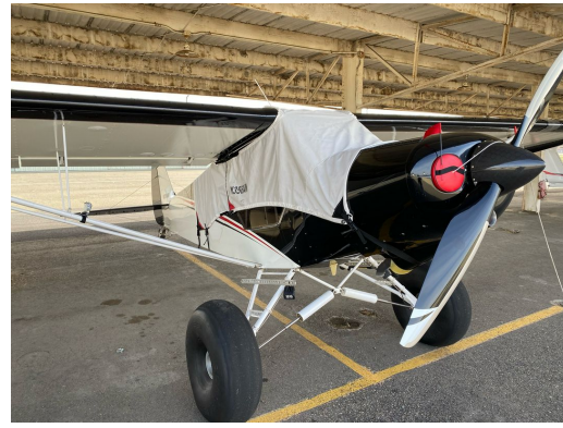
Piper PA-18 Super Cub Canopy Cover, Over Top Type