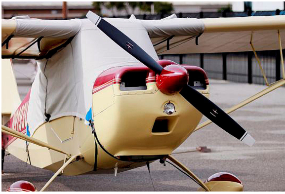
Bellanca Citabria Over-the-Top Canopy Cover, extended to cover gas caps