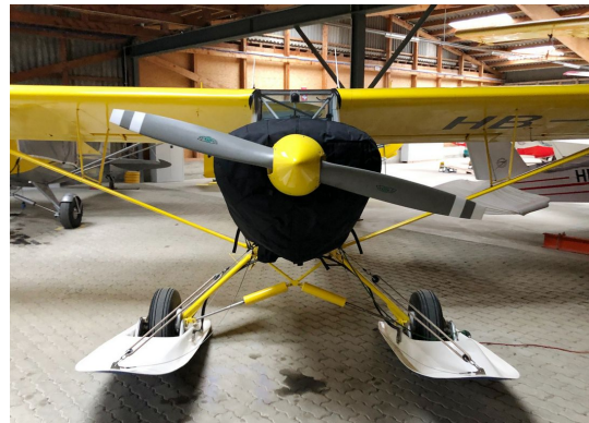
Piper PA-18 Supercub Insulated Engine Cover