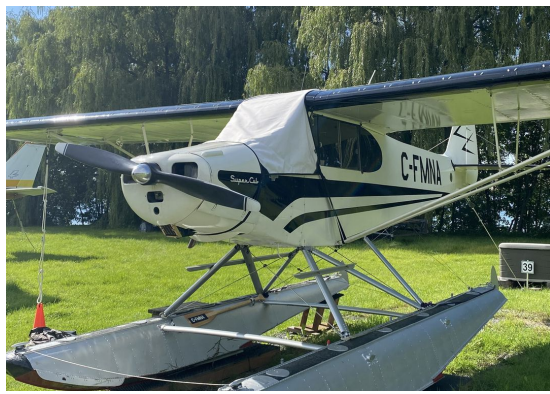
Piper PA-18 Super Cub Windshield/Skylight Cover