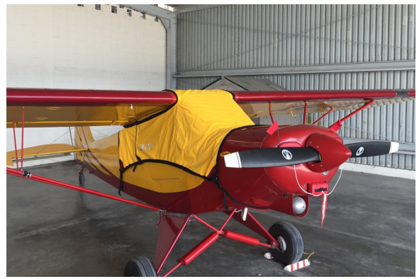
Piper Super Cub Canopy Cover, Engine Plugs