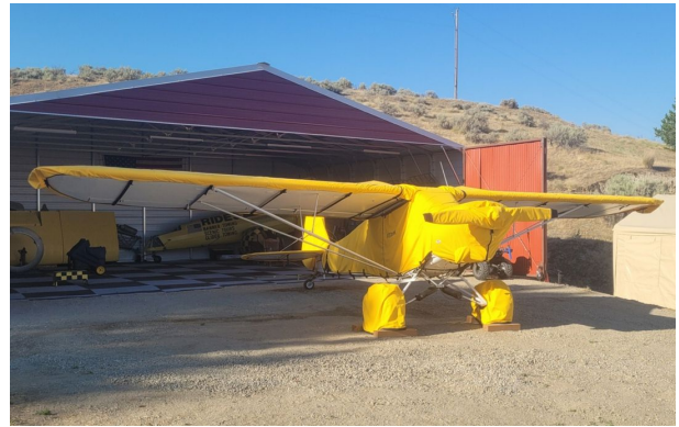
Piper PA-18 All Weather Cover Set