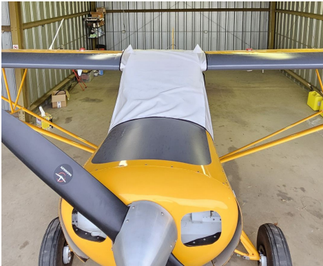
Piper PA-12: Super Cruiser, J5 Cub Windshield/Skylight Cover

This cover type is made from Silver Acrylic Sunbrella canvas and is 100% lined with a soft and smooth microfiber. Bruce's Custom Covers developed this material combination especially for aircraft protection. The outer material is medium weight and treated for water resistance, UV resistance and anti-static buildup. The inner lining is a very soft and smooth microfiber to prevent scratching. The material is very reflective, and tests show that the cabin interior temperature can be reduced to near-ambient temperature on the hottest of days. It is water, ice and snow repellent, yet breathable to allow moisture to escape from between the cover and the aircraft surface.