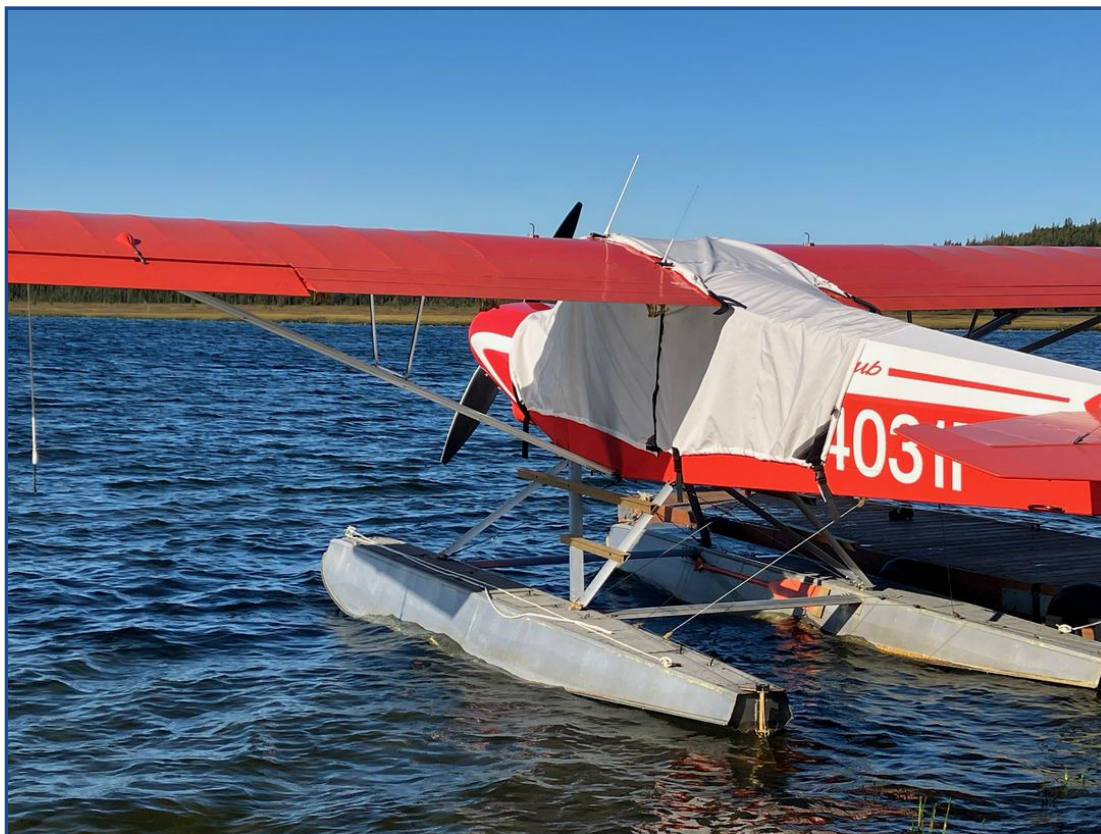
Piper PA-18 Super Cub Canopy Cover, Over Top Type