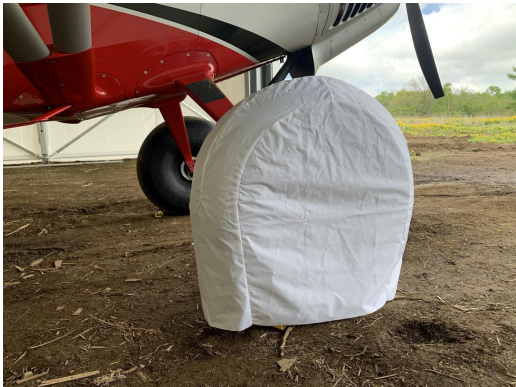
Cub Crafters CC19 Oversize Tire Covers, test fit cover