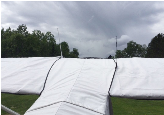
Piper PA-18-150 Super Cub Complete Cover Set