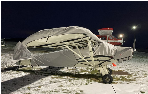
PA-18 Super Cub Winter Cover Set