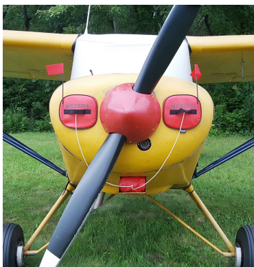
Piper PA-20 Engine Inlet Plugs

Engine Inlet Plugs are custom fit for your Piper Clipper, Pacer, Tri-Pacer, Vagabond, Colt: PA-15, 16, 20, 22 intakes, made with heavy-duty vinyl material, and stuffed with a single block of sculpted urethane foam. Each plug has a zipper that allows the foam to be removed and dried if necessary. Engine plugs have warning flags that are visible from the cockpit or 'remove before flight' streamers sewn onto the face of the plugs. Most plugs are imprinted with the aircraft registration number in black for an extra charge. Storage bag NOT included. Engine plugs may be inserted after flight when the engine is still warm. Engine Inlet Plugs are commonly referred to as Cowl Plugs, Intake Plugs, Cowl Blocks, Engine Blocks, and Engine Bungs.