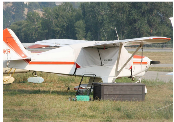
Piper PA-22-150 Canopy Cover, Over-Top Style