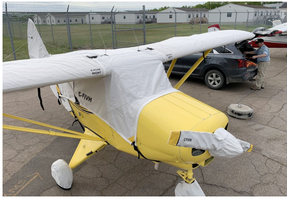
Piper PA-22 Tri-Pacer Cover Set