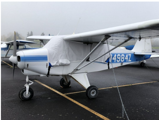
Piper PA-22 Canopy Cover

This cover type is made from Silver Acrylic Sunbrella canvas and is 100% lined with a soft and smooth microfiber. Bruce's Custom Covers developed this material combination especially for aircraft protection. The outer material is medium weight and treated for water resistance, UV resistance and anti-static buildup. The inner lining is a very soft and smooth microfiber to prevent scratching. The material is very reflective, and tests show that the cabin interior temperature can be reduced to near-ambient temperature on the hottest of days. It is water, ice and snow repellent, yet breathable to allow moisture to escape from between the cover and the aircraft surface.