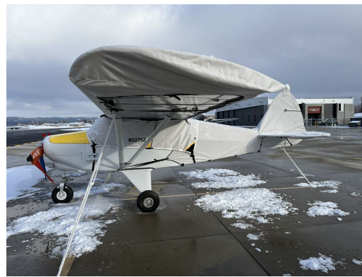
Piper Tri-Pacer Canopy, Wing & Engine Covers