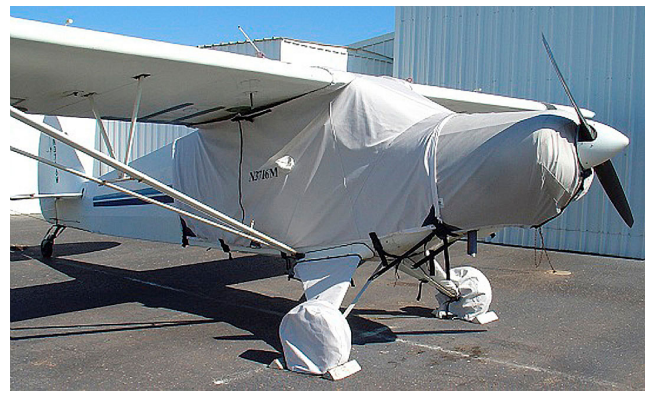
Piper PA-12 Extended Canopy, Engine & Landing Gear Covers