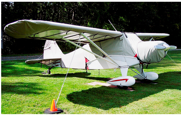
Piper Clipper Canopy, Engine, Empennage & Wing Covers