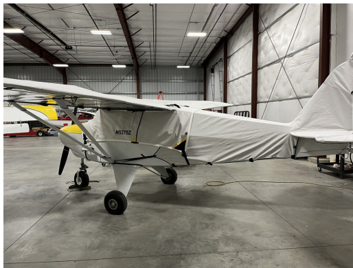
Piper Tri-Pacer Canopy, Wing & Engine Covers

This cover type is made from Silver Acrylic Sunbrella canvas and is 100% lined with a soft and smooth microfiber. Bruce's Custom Covers developed this material combination especially for aircraft protection. The outer material is medium weight and treated for water resistance, UV resistance and anti-static buildup. The inner lining is a very soft and smooth microfiber to prevent scratching. The material is very reflective, and tests show that the cabin interior temperature can be reduced to near-ambient temperature on the hottest of days. It is water, ice and snow repellent, yet breathable to allow moisture to escape from between the cover and the aircraft surface.