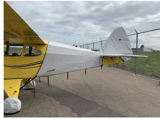
Piper PA-22 Tri-Pacer Empennage Cover