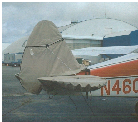
Piper PA-22 Colt Horizontal & Vertical Stabilizer Covers