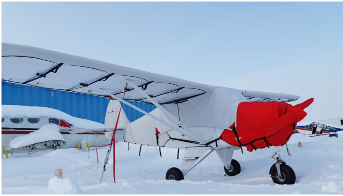
1957 PA-22-150 Over the Top Style Canopy Cover