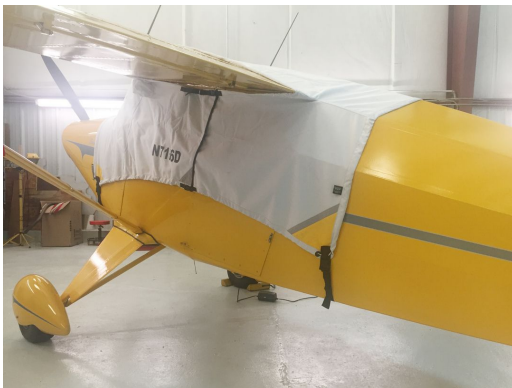
Piper Pacer Over-Top Canopy Cover

This cover type is made from Silver Acrylic Sunbrella canvas and is 100% lined with a soft and smooth microfiber. Bruce's Custom Covers developed this material combination especially for aircraft protection. The outer material is medium weight and treated for water resistance, UV resistance and anti-static buildup. The inner lining is a very soft and smooth microfiber to prevent scratching. The material is very reflective, and tests show that the cabin interior temperature can be reduced to near-ambient temperature on the hottest of days. It is water, ice and snow repellent, yet breathable to allow moisture to escape from between the cover and the aircraft surface.