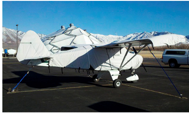
Engine, Extended Over-the-top Canopy, Wing and Empennage Covers