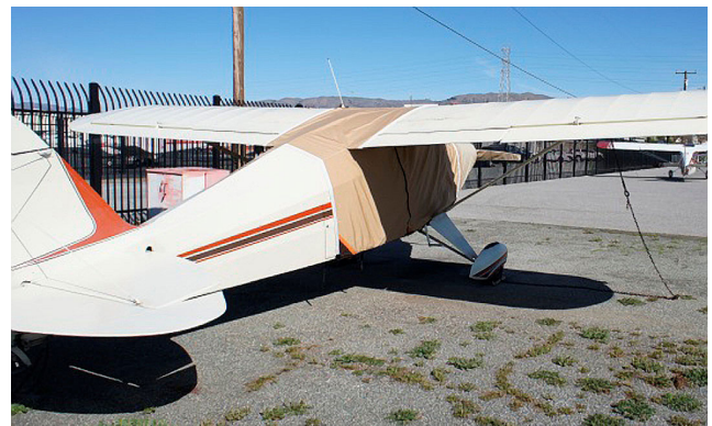
Piper PA-22-150 Pacer Extended Canopy, Engine & Prop/Spinner Covers