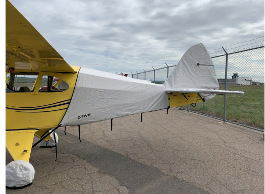
Piper PA-22 Tri-Pacer Empennage Cover