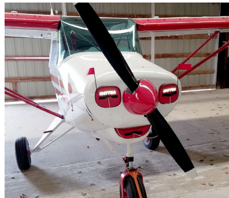
Piper Clipper, Pacer, Tri-Pacer, Vagabond, Colt: PA-15, 16, 20, 22 Engine Inlet Plugs