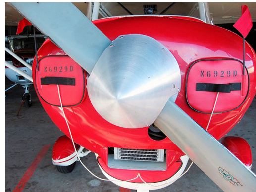
Piper PA-22-150 Engine Inlet Plugs (set of 3)