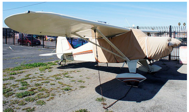
Piper PA-22-150 Pacer Extended Canopy, Engine & Prop/Spinner Covers