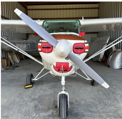
Piper PA-22-150 Engine Inlet Plugs

Engine Inlet Plugs are custom fit for your Piper Clipper, Pacer, Tri-Pacer, Vagabond, Colt: PA-15, 16, 20, 22 intakes, made with heavy-duty vinyl material, and stuffed with a single block of sculpted urethane foam. Each plug has a zipper that allows the foam to be removed and dried if necessary. Engine plugs have warning flags that are visible from the cockpit or 'remove before flight' streamers sewn onto the face of the plugs. Most plugs are imprinted with the aircraft registration number in black for an extra charge. Storage bag NOT included. Engine plugs may be inserted after flight when the engine is still warm. Engine Inlet Plugs are commonly referred to as Cowl Plugs, Intake Plugs, Cowl Blocks, Engine Blocks, and Engine Bungs.