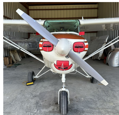
Piper PA-22-150 Engine Inlet Plugs