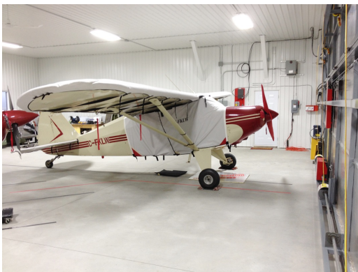
Piper PA-20 Extended Canopy Cover, Wing Covers

Travel Covers are made with Silver Solution-Dyed Polyester fabric and only lined over the windshield to save weight. The material is lightweight and more compact for easy stowage in the aircraft. The polyester material is water resistant, but only intended for occasional use outside. We also have an ultra lightweight material available for fitted hangar dust covers. For daily outdoor use, the non-travel Sunbrella Cover is the best choice.