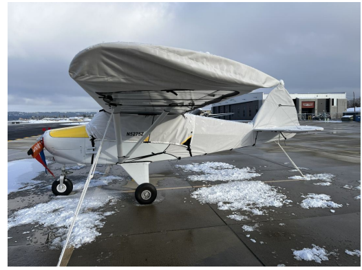
Piper Tri-Pacer Canopy, Wing & Engine Covers