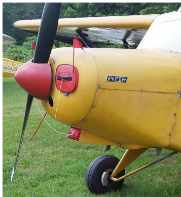
Piper PA-20 Engine Inlet Plugs

Engine Inlet Plugs are custom fit for your Piper Clipper, Pacer, Tri-Pacer, Vagabond, Colt: PA-15, 16, 20, 22 intakes, made with heavy-duty vinyl material, and stuffed with a single block of sculpted urethane foam. Each plug has a zipper that allows the foam to be removed and dried if necessary. Engine plugs have warning flags that are visible from the cockpit or 'remove before flight' streamers sewn onto the face of the plugs. Most plugs are imprinted with the aircraft registration number in black for an extra charge. Storage bag NOT included. Engine plugs may be inserted after flight when the engine is still warm. Engine Inlet Plugs are commonly referred to as Cowl Plugs, Intake Plugs, Cowl Blocks, Engine Blocks, and Engine Bungs.