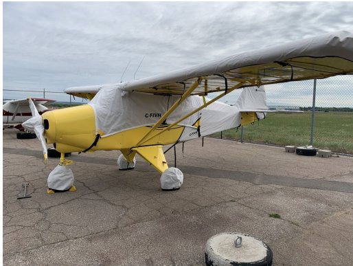
Piper PA-22 Tri-Pacer Cover Set

ALL-YEAR USE MATERIAL - Made with Silver Acrylic Sunbrella canvas, the all-year use material is the best option for sun protection and cover longevity. This heavier more durable material is intended for all weather conditions, such as rain and snow or lots of sun.