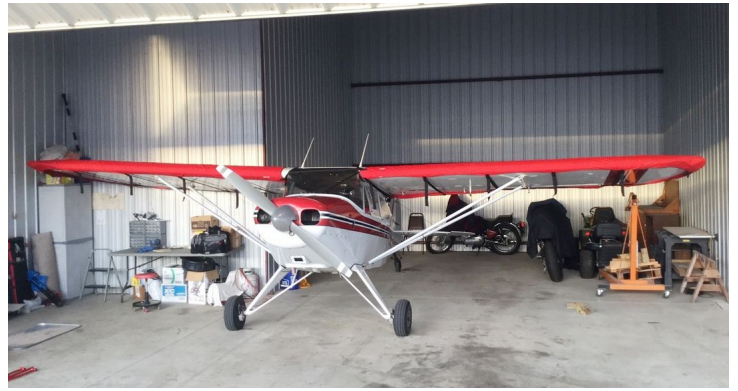
Piper PA-20 Wing Covers