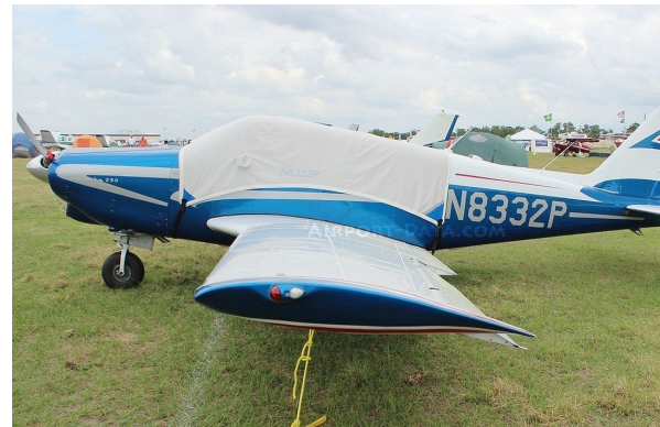
Piper PA-24 Comanche Canopy Cover