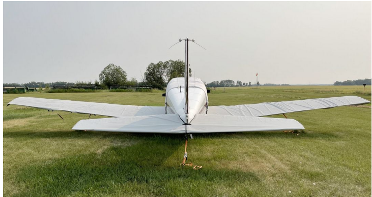
Piper PA-24 Comanche Wing & Horiz. Stab. Covers