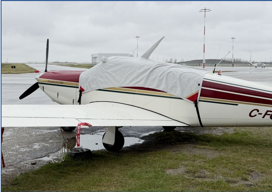
Piper PA-24 Comanche Canopy Cover, Belly Strap Type