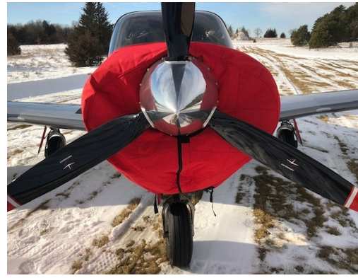
Piper Comanche PA-24 Insulated Engine Cover, snap-on type.