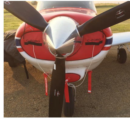
Piper PA-24 Comanche Engine Plugs