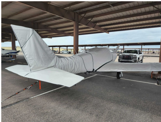
Piper PA-24 Comanche Complete Cover Set

This cover type is made from Silver Acrylic Sunbrella canvas and is 100% lined with a soft and smooth microfiber. Bruce's Custom Covers developed this material combination especially for aircraft protection. The outer material is medium weight and treated for water resistance, UV resistance and anti-static buildup. The inner lining is a very soft and smooth microfiber to prevent scratching. The material is very reflective, and tests show that the cabin interior temperature can be reduced to near-ambient temperature on the hottest of days. It is water, ice and snow repellent, yet breathable to allow moisture to escape from between the cover and the aircraft surface.