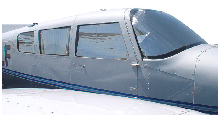
Piper Comanche HeatShield Set