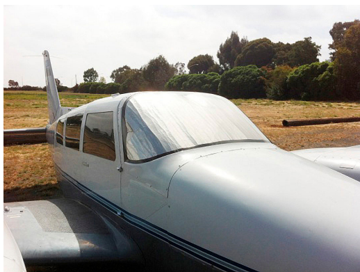
Piper Comanche Windshield HeatShield

Windshield Heatshields are interior sunshades for an aircraft's front windshield. The product is a unique composite of closed-cell foam with a silver mylar finish. The semi-rigid design is stiff enough to stand along the inside of the windshield using sun visors or window framing. It folds up flat and easily stores in the included storage sleeve. Some designs may require velcro and suction cups or split right and left sides. A Heatshield is an excellent short-term remedy for cockpit overheating. An external fabric cover is far more effective and practical for long-term protection.