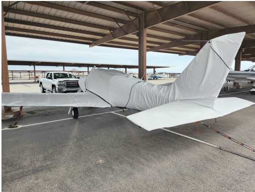
Piper PA-24 Comanche Complete Cover Set

WINTER USE MATERIAL - Made with Solution-Dyed Polyester fabric, this option is intended for seasonal use to aid in deicing, rain mitigation, or for occasional travel. The material is lighter and more compact, but more susceptible to UV damage and may have a shorter useful life if used continuously outside than the all-year use material.