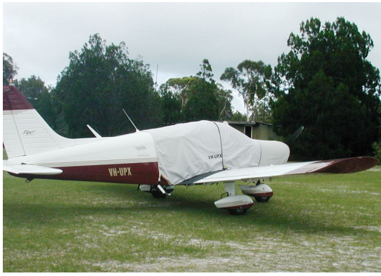
Piper PA-28 Extended Canopy Cover & Engine Cover