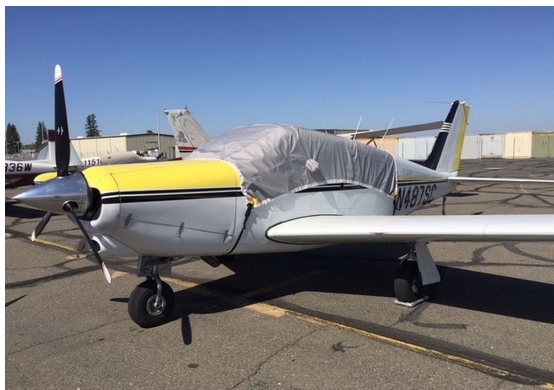
Piper PA-24 Comanche Travel Cover, Light Weight Travel Canopy Cover