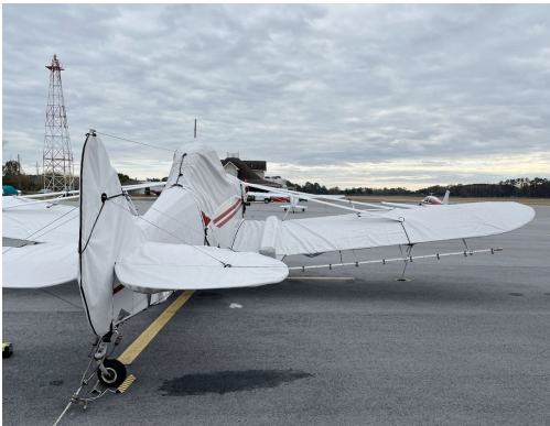
Piper PA-25 Pawnee Cover Set