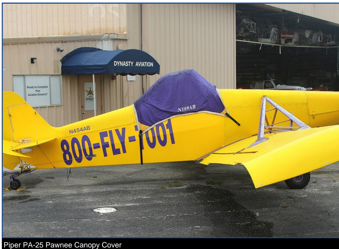
Piper PA-25 Pawnee Canopy Cover