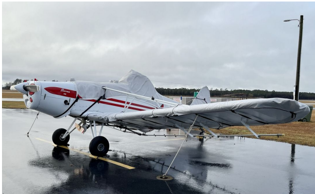
Piper Pawnee Canopy/Hopper, Wing & Empennage Covers

WINTER USE MATERIAL - Made with Solution-Dyed Polyester fabric, this option is intended for seasonal use to aid in deicing, rain mitigation, or for occasional travel. The material is lighter and more compact, but more susceptible to UV damage and may have a shorter useful life if used continuously outside than the all-year use material.