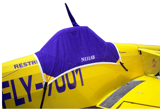
Piper Pawnee Canopy Cover

occasional use outside. We also have an ultra lightweight material available for fitted hangar dust covers. For daily outdoor use, the non-travel Sunbrella Cover is the best choice.