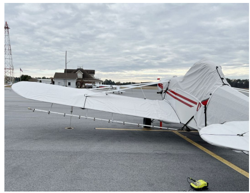
Piper PA-25 Pawnee Cover Set