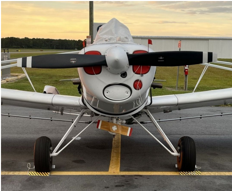
Piper PA-25 Pawnee Canopy/Hopper Cover

Engine Inlet Plugs are custom fit for your Piper Pawnee PA-25 intakes, made with heavy-duty vinyl material, and stuffed with a single block of sculpted urethane foam. Each plug has a zipper that allows the foam to be removed and dried if necessary. Engine plugs have warning flags that are visible from the cockpit or 'remove before flight' streamers sewn onto the face of the plugs. Most plugs are imprinted with the aircraft registration number in black for an extra charge. Storage bag NOT included. Engine plugs may be inserted after flight when the engine is still warm. Engine Inlet Plugs are commonly referred to as Cowl Plugs, Intake Plugs, Cowl Blocks, Engine Blocks, and Engine Bungs.