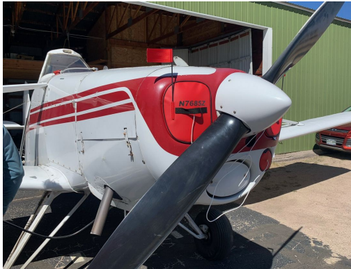
Piper PA-25 Pawnee Engine Plugs