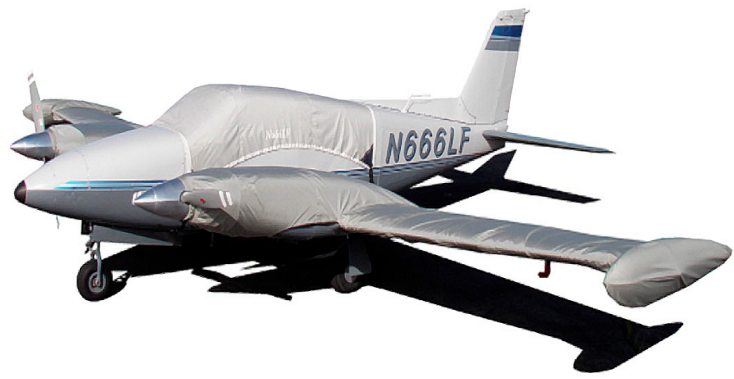
Piper Twin Comanche Canopy Cover, Wing & Engine Covers with Tip Tanks