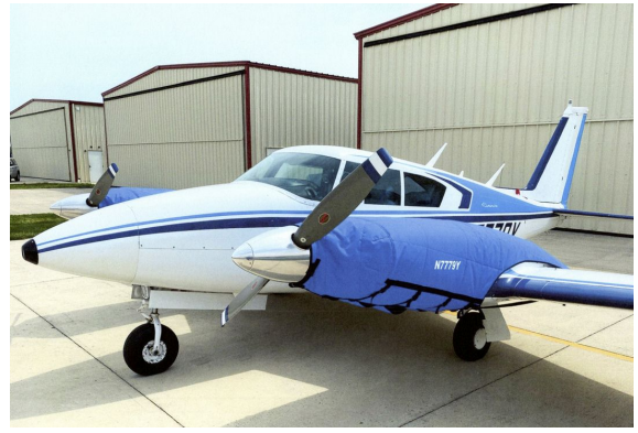
Piper PA-30 Twin Comanche Insulated Engine Covers