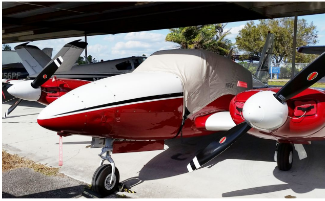
Piper Twin Comanche Canopy Cover & Engine Inlet Plugs