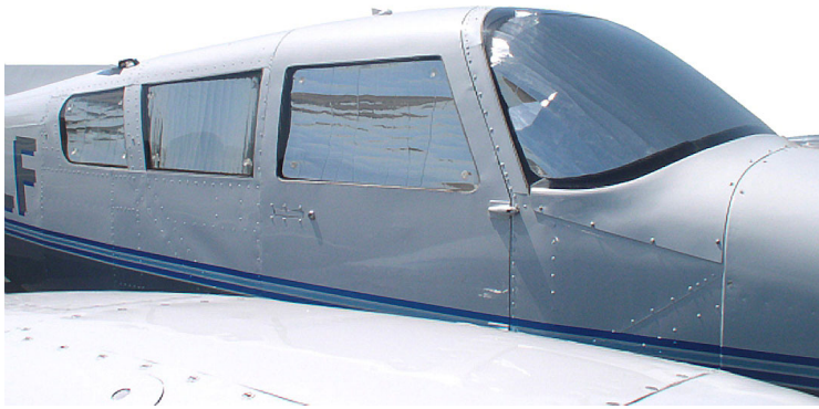
Piper Comanche HeatShield Set