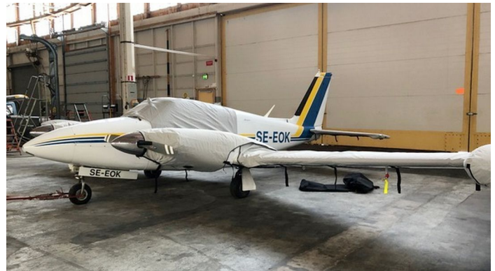
Piper Twin Comanche Wing & Insulated Engine Covers