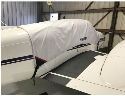
Piper PA-30 Twin Comanche Canopy Cover