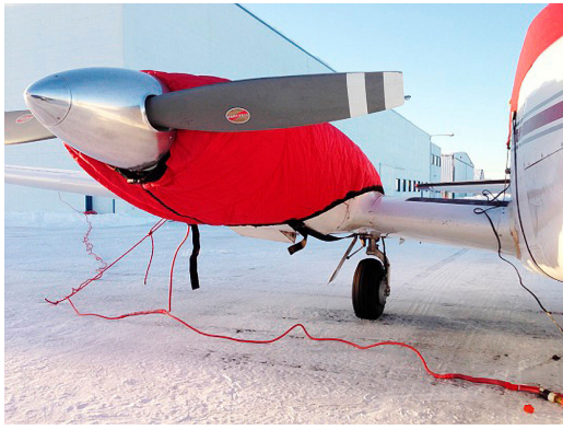
Piper PA-30 Twin Comanche Insulated Engine Covers