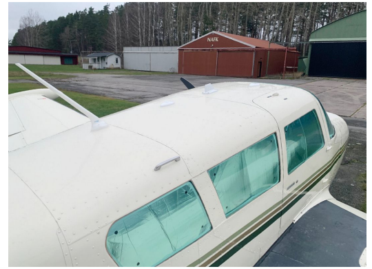
Piper PA-30 Twin Comanche HeatShields