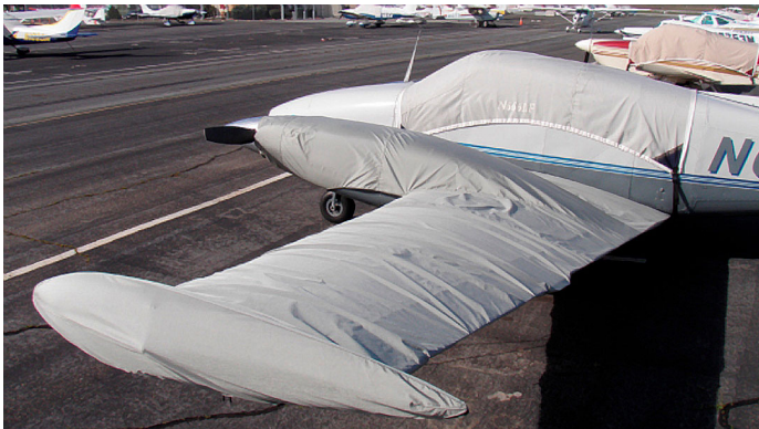
Piper Twin Comanche Canopy Cover, Wing & Engine Covers with Tip Tanks

WINTER USE MATERIAL - Made with Solution-Dyed Polyester fabric, this option is intended for seasonal use to aid in deicing, rain mitigation, or for occasional travel. The material is lighter and more compact, but more susceptible to UV damage and may have a shorter useful life if used continuously outside than the all-year use material.