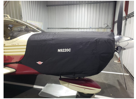
Piper PA32-300 Insulated Engine Cover