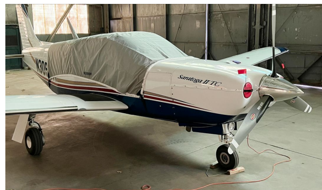
Piper Saratoga PA-32R-301T Travel Canopy Cover, Intake Plugs