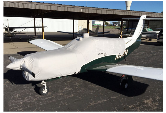
Piper Turbo Lance II Canopy/Engine Cover