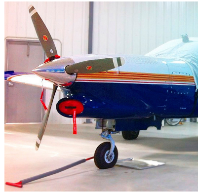
Piper Turbo Saratoga or Lance Engine Inlet Plug