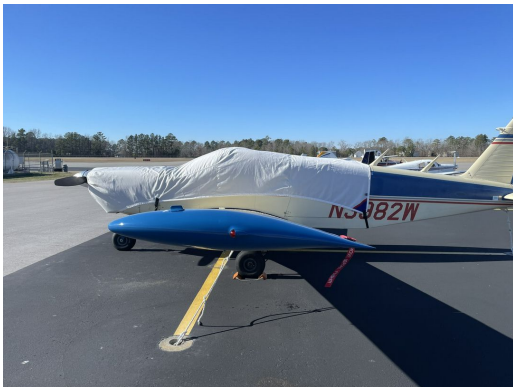
Piper PA-32-260 Canopy/Engine Cover

This cover type is made from Silver Acrylic Sunbrella canvas and is 100% lined with a soft and smooth microfiber. Bruce's Custom Covers developed this material combination especially for aircraft protection. The outer material is medium weight and treated for water resistance, UV resistance and anti-static buildup. The inner lining is a very soft and smooth microfiber to prevent scratching. The material is very reflective, and tests show that the cabin interior temperature can be reduced to near-ambient temperature on the hottest of days. It is water, ice and snow repellent, yet breathable to allow moisture to escape from between the cover and the aircraft surface.