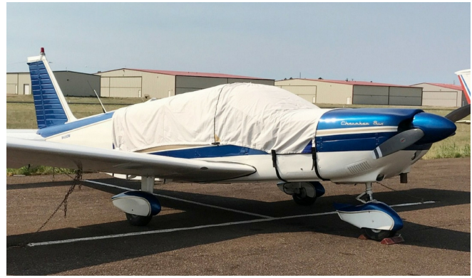
Piper Cherokee Six Canopy Cover with forward bib to cover baggage door.