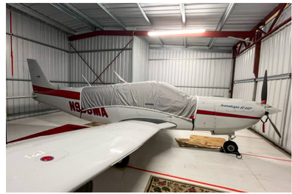
Piper Saratoga PA-32R-301T Travel Canopy Cover, Intake Plugs Piper PA-32 Saratoga, Cherokee 6, Lance Travel Cover, Light Weight Canopy Cover