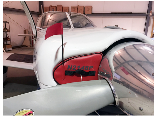
Piper PA-32 Saratoga/Cherokee 6 Engine Inlet Plugs