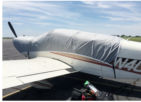
Piper PA-32 Saratoga/Cherokee 6 Canopy Cover Piper PA-32 Saratoga, Cherokee 6, Lance Travel Cover, Light Weight Travel Canopy/Engine Cover