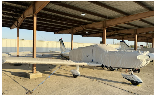
Piper PA-32-300 Cover Set