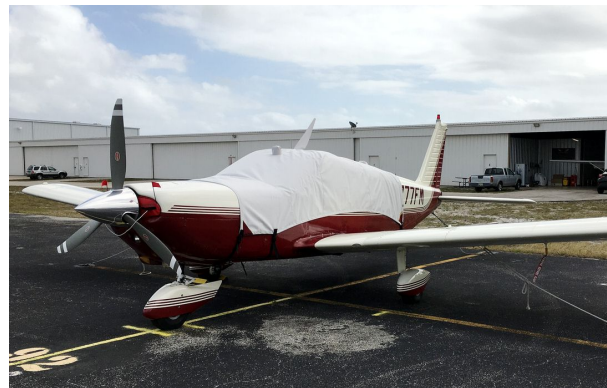
Piper PA-32-260 Canopy Cover W/Fwd Bib To Cover Baggage Door