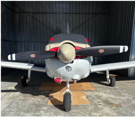
Piper PA-32 Engine Plugs, set of 3