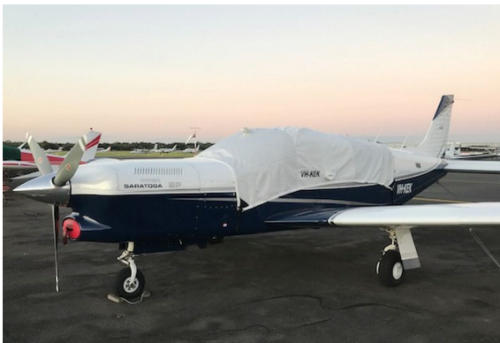
Piper Saratoga SP PA32R Canopy Cover

This cover type is made from Silver Acrylic Sunbrella canvas and is 100% lined with a soft and smooth microfiber. Bruce's Custom Covers developed this material combination especially for aircraft protection. The outer material is medium weight and treated for water resistance, UV resistance and anti-static buildup. The inner lining is a very soft and smooth microfiber to prevent scratching. The material is very reflective, and tests show that the cabin interior temperature can be reduced to near-ambient temperature on the hottest of days. It is water, ice and snow repellent, yet breathable to allow moisture to escape from between the cover and the aircraft surface.