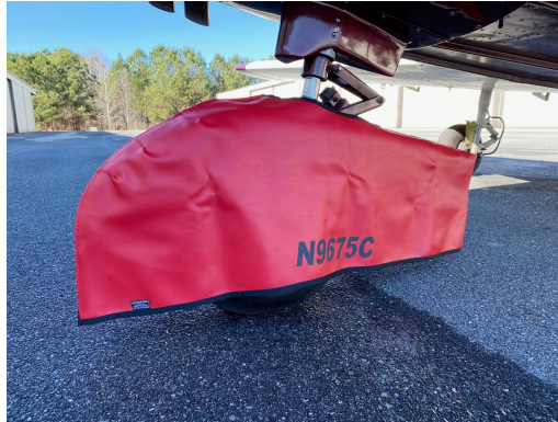
Piper PA-32 Saratoga Front Wheelpant Cover

The Piper PA-32 Saratoga, Cherokee 6, Lance Tailcone Cover fits onto the tailcone area to cover the holes that birds can fly into and nest. The cover easily straps onto the leading edge of the horizontal stabilizer with padded hooks or overlaps with the elevators slightly and attaches under the horizontal stabilizers with adjustable straps. Tailcone Covers are normally made with Solution-Dyed Polyester or Acrylic Sunbrella .