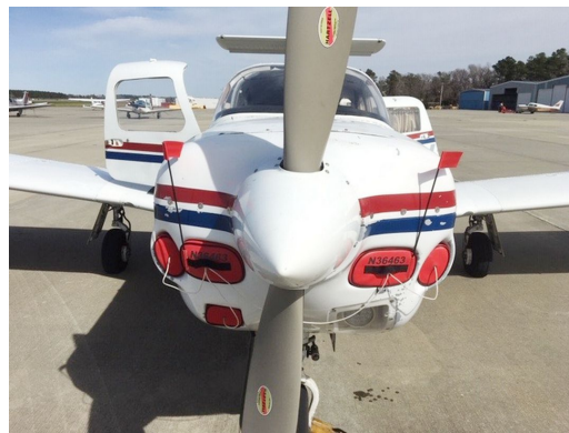
Piper PA-32 Engine Inlet Plugs TurboPlus