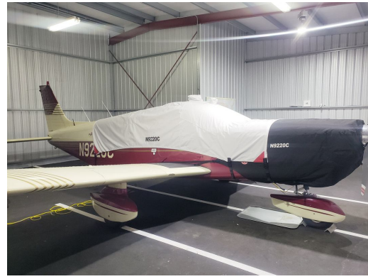
Piper PA32-300 Canopy Cover w/fwd bib to cover baggage door