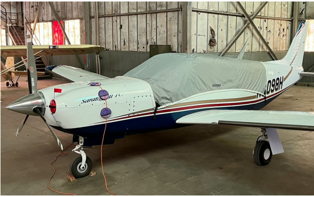
Piper Saratoga PA-32R-301T Travel Canopy Cover, Intake Plugs