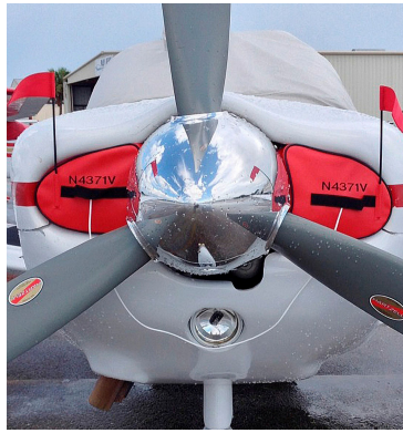
Piper PA-32 Engine Inlet Plugs