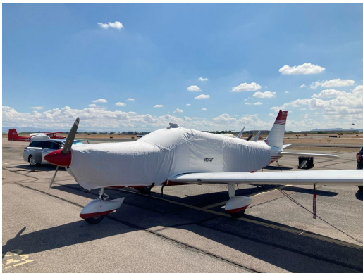
Piper PA-32-260 Extra Extended Canopy/Engine Cover (Extends To Dorsal)

This cover type is made from Silver Acrylic Sunbrella canvas and is 100% lined with a soft and smooth microfiber. Bruce's Custom Covers developed this material combination especially for aircraft protection. The outer material is medium weight and treated for water resistance, UV resistance and anti-static buildup. The inner lining is a very soft and smooth microfiber to prevent scratching. The material is very reflective, and tests show that the cabin interior temperature can be reduced to near-ambient temperature on the hottest of days. It is water, ice and snow repellent, yet breathable to allow moisture to escape from between the cover and the aircraft surface.