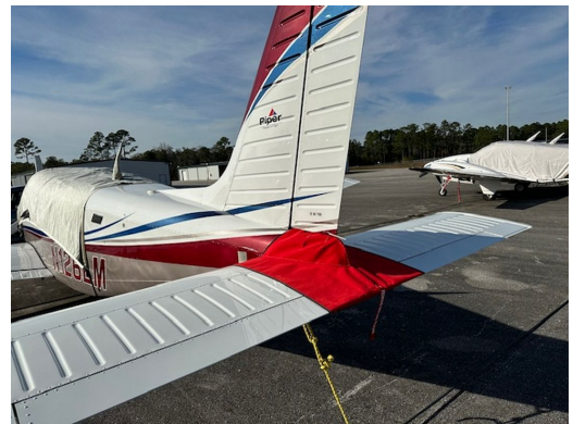
Piper PA-32R-301 Extended Canopy Cover, Wing & Tailcone Covers Piper PA-32 Saratoga, Cherokee 6, Lance Tailcone Cover