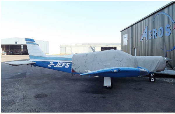
Piper PA-32R-301T Extended Canopy, Engine, Horiz. Stabilizer Covers