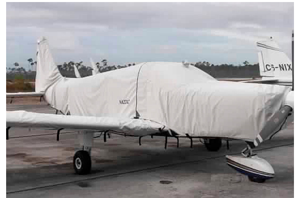
Piper PA-32 Full Cover set