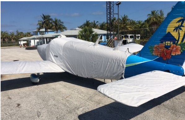
Piper Cherokee Six Extra Extended Canopy/Engine Cover, Wing & Tail Covers

WINTER USE MATERIAL - Made with Solution-Dyed Polyester fabric, this option is intended for seasonal use to aid in deicing, rain mitigation, or for occasional travel. The material is lighter and more compact, but more susceptible to UV damage and may have a shorter useful life if used continuously outside than the all-year use material.