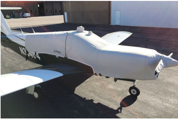
Piper Turbo Lance II Canopy/Engine Cover