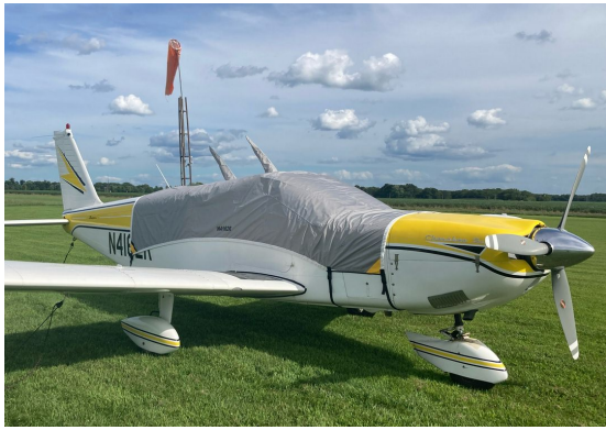
Piper PA-32-301T Travel Weight Canopy Cover, w/fwd bib.