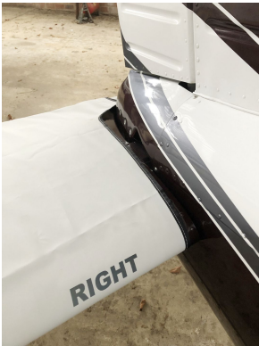
Piper PA-28 Horizontal Stabilizer Cover

WINTER USE MATERIAL - Made with Solution-Dyed Polyester fabric, this option is intended for seasonal use to aid in deicing, rain mitigation, or for occasional travel. The material is lighter and more compact, but more susceptible to UV damage and may have a shorter useful life if used continuously outside than the all-year use material.