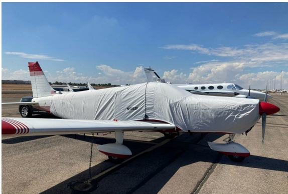
Piper PA-32-260 Extra Extended Canopy/Engine Cover (Extends To Dorsal)