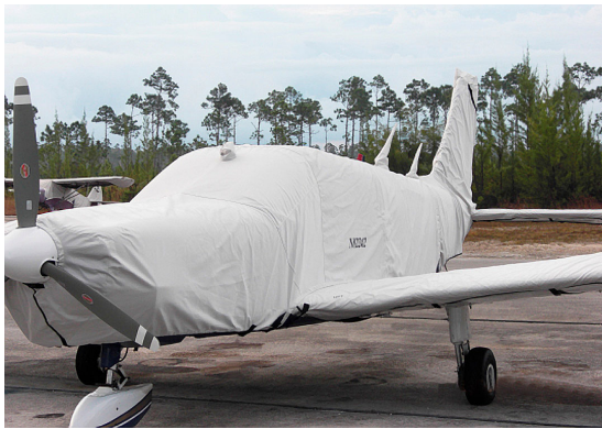
Piper PA-32 Extended Canopy/Engine Cover (extends to dorsal), Empennage Cover, and Wing Covers

This cover type is made from Silver Acrylic Sunbrella canvas and is 100% lined with a soft and smooth microfiber. Bruce's Custom Covers developed this material combination especially for aircraft protection. The outer material is medium weight and treated for water resistance, UV resistance and anti-static buildup. The inner lining is a very soft and smooth microfiber to prevent scratching. The material is very reflective, and tests show that the cabin interior temperature can be reduced to near-ambient temperature on the hottest of days. It is water, ice and snow repellent, yet breathable to allow moisture to escape from between the cover and the aircraft surface.