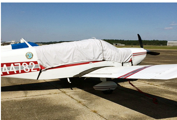
Piper PA-32 Saratoga/Cherokee 6 Canopy Cover

Travel Covers are made with Silver Solution-Dyed Polyester fabric and only lined over the windshield to save weight. The material is lightweight and more compact for easy stowage in the aircraft. The polyester material is water resistant, but only intended for occasional use outside. We also have an ultra lightweight material available for fitted hangar dust covers. For daily outdoor use, the non-travel Sunbrella Cover is the best choice.