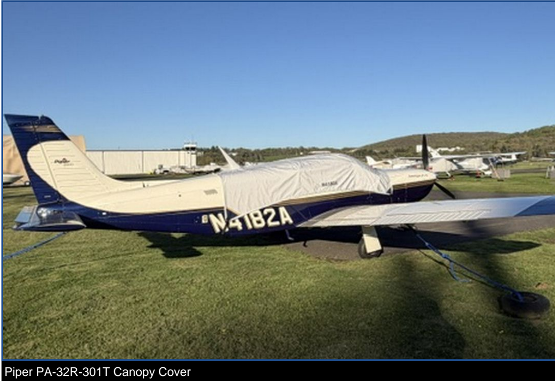
Piper PA-32R-301T Canopy Cover