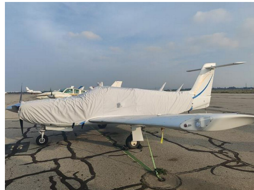
Piper PA-32RT-300 Extended Canopy/Engine Cover, extends to tail