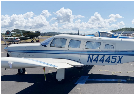
Piper PA32-300 HeatShield Set

Windshield Heatshields are interior sunshades for an aircraft's front windshield. The product is a unique composite of closed-cell foam with a silver mylar finish. The semi-rigid design is stiff enough to stand along the inside of the windshield using sun visors or window framing. It folds up flat and easily stores in the included storage sleeve. Some designs may require velcro and suction cups or split right and left sides. A Heatshield is an excellent short-term remedy for cockpit overheating. An external fabric cover is far more effective and practical for long-term protection.