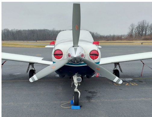
Piper PA-32R-301 Engine Plugs