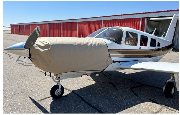
Piper PA-32 Saratoga Engine Cover