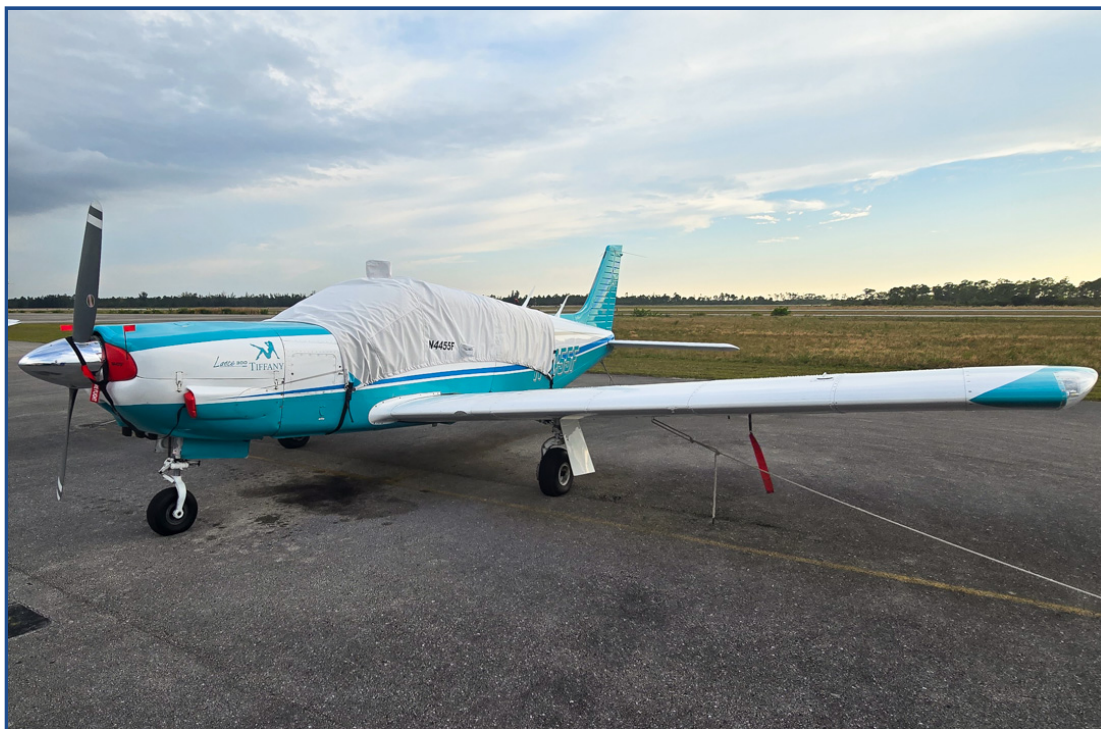
Piper PA-32 Saratoga, Cherokee 6, Lance Canopy Cover