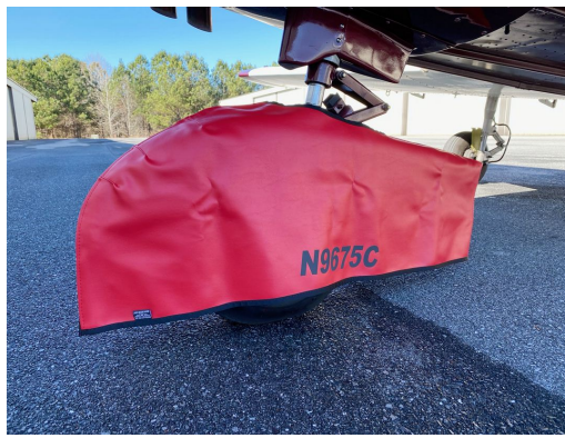
Piper PA-32 Saratoga Front Wheelpant Cover