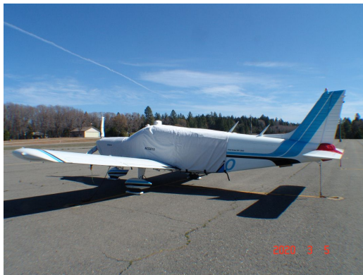
Piper PA32-300 Extended Canopy, Engine & Prop Covers

WINTER USE MATERIAL - Made with Solution-Dyed Polyester fabric, this option is intended for seasonal use to aid in deicing, rain mitigation, or for occasional travel. The material is lighter and more compact, but more susceptible to UV damage and may have a shorter useful life if used continuously outside than the all-year use material.