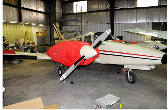
Piper Seneca Insulated Engine Covers