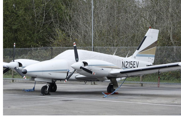
Piper Seneca Canopy Cover