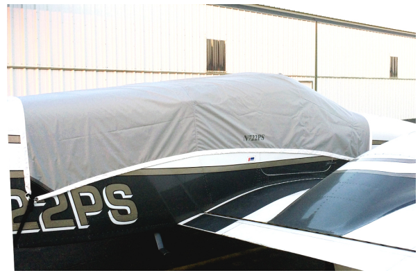
Piper PA-34 Seneca Travel Cover