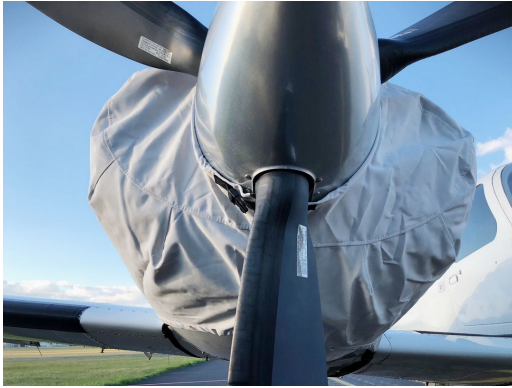
Piper PA-34 Seneca II Fully Enclosed Engine Covers

This cover type is made from Silver Acrylic Sunbrella canvas and is 100% lined with a soft and smooth microfiber. Bruce's Custom Covers developed this material combination especially for aircraft protection. The outer material is medium weight and treated for water resistance, UV resistance and anti-static buildup. The inner lining is a very soft and smooth microfiber to prevent scratching. The material is very reflective, and tests show that the cabin interior temperature can be reduced to near-ambient temperature on the hottest of days. It is water, ice and snow repellent, yet breathable to allow moisture to escape from between the cover and the aircraft surface.