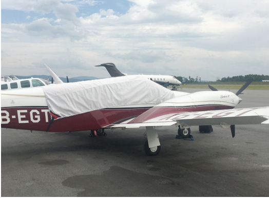
Piper Seneca Canopy Cover

water resistance, UV resistance and anti-static buildup. The inner lining is a very soft and smooth microfiber to prevent scratching. The material is very reflective, and tests show that the cabin interior temperature can be reduced to near-ambient temperature on the hottest of days. It is water, ice and snow repellent, yet breathable to allow moisture to escape from between the cover and the aircraft surface.