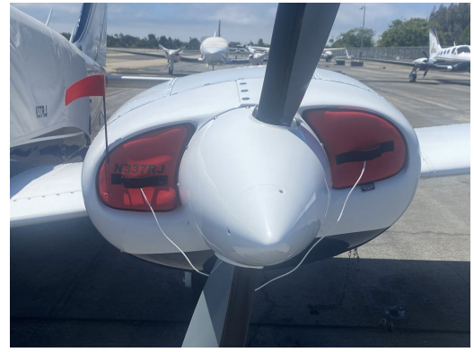
Piper PA-34 Seneca Engine Inlet Plugs