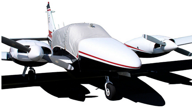
Piper Seneca Canopy Cover