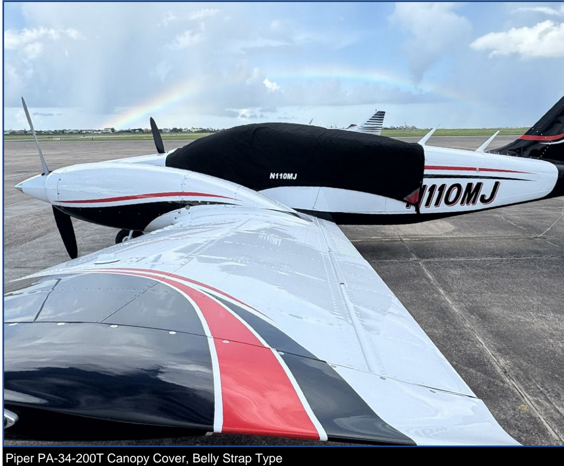
Piper PA-34-200T Canopy Cover, Belly Strap Type