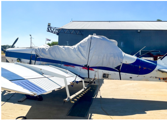
Brave PA-36 Canopy/Hopper Cover