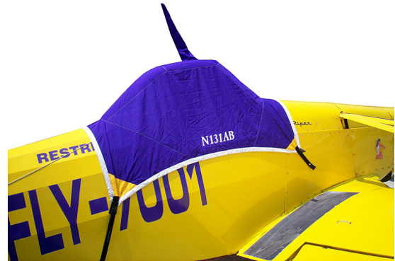
Piper Pawnee Canopy Cover