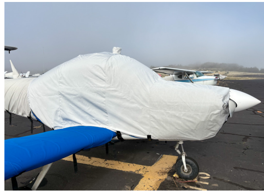
Piper PA-38 Tomahawk Extended Canopy/Engine Cover