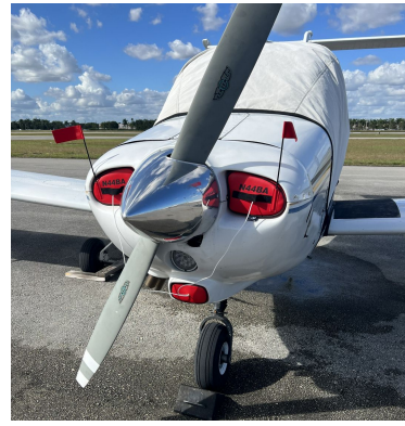
PA-38 Tomahawk Engine Inlet Plugs, Includes Carb. Inlet Plug Set of 3)