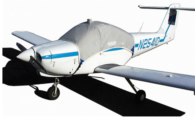
Piper Tomahawk Canopy Cover

Travel Covers are made with Silver Solution-Dyed Polyester fabric and only lined over the windshield to save weight. The material is lightweight and more compact for easy stowage in the aircraft. The polyester material is water resistant, but only intended for occasional use outside. We also have an ultra lightweight material available for fitted hangar dust covers. For daily outdoor use, the non-travel Sunbrella Cover is the best choice.