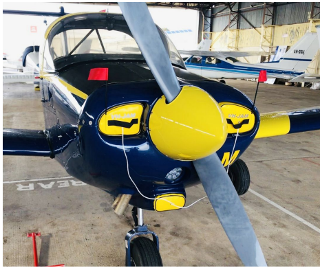
Piper PA-38 Tomahawk Engine Inlet Plugs with custom color