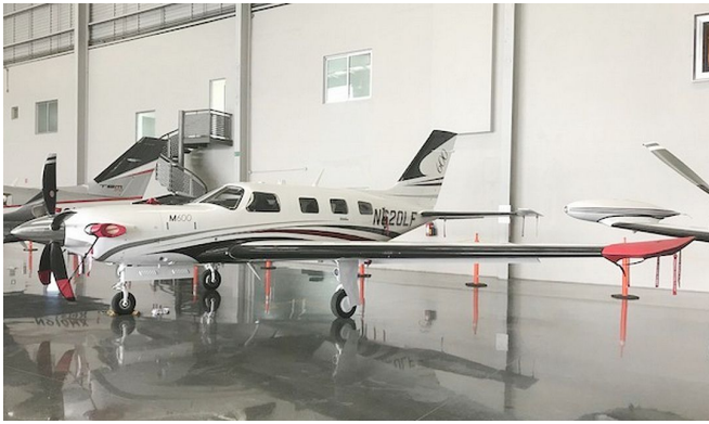
Piper Meridian Wingtip Pads, M600 Models