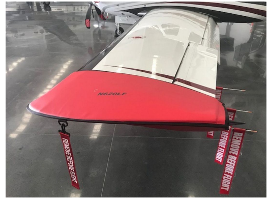
Piper Meridian Wingtip Pads, M600 Models