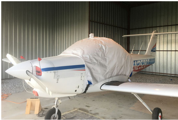
Piper PA-38 Canopy Cover

This cover type is made from Silver Acrylic Sunbrella canvas and is 100% lined with a soft and smooth microfiber. Bruce's Custom Covers developed this material combination especially for aircraft protection. The outer material is medium weight and treated for water resistance, UV resistance and anti-static buildup. The inner lining is a very soft and smooth microfiber to prevent scratching. The material is very reflective, and tests show that the cabin interior temperature can be reduced to near-ambient temperature on the hottest of days. It is water, ice and snow repellent, yet breathable to allow moisture to escape from between the cover and the aircraft surface.