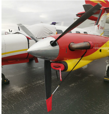
Piper PA-42 Cheyenne III Prop Tie/Exhaust Cover, Inlet Plugs

Engine Inlet Plugs are custom fit for your Piper PA-42 Cheyenne III intakes, made with heavy-duty vinyl material, and stuffed with a single block of sculpted urethane foam. Each plug has a zipper that allows the foam to be removed and dried if necessary. Engine plugs have warning flags that are visible from the cockpit or 'remove before flight' streamers sewn onto the face of the plugs. Most plugs are imprinted with the aircraft registration number in black for an extra charge. Storage bag NOT included. Engine plugs may be inserted after flight when the engine is still warm. Engine Inlet Plugs are commonly referred to as Cowl Plugs, Intake Plugs, Cowl Blocks, Engine Blocks, and Engine Bungs.