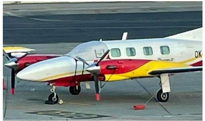
Piper PA-42 Cheyenne III Cockpit Cover