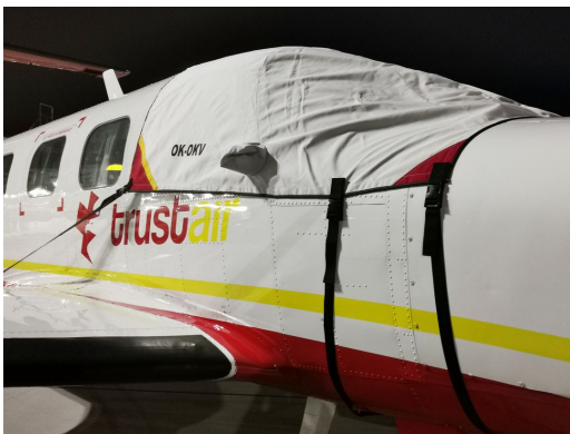
Piper PA-42 Cheyenne III Cockpit Cover

This cover type is made from Silver Acrylic Sunbrella canvas and is 100% lined with a soft and smooth microfiber. Bruce's Custom Covers developed this material combination especially for aircraft protection. The outer material is medium weight and treated for water resistance, UV resistance and anti-static buildup. The inner lining is a very soft and smooth microfiber to prevent scratching. The material is very reflective, and tests show that the cabin interior temperature can be reduced to near-ambient temperature on the hottest of days. It is water, ice and snow repellent, yet breathable to allow moisture to escape from between the cover and the aircraft surface.