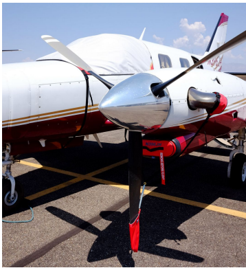
Piper Cheyenne Cockpit Cover, Engine Plugs, Prop Tie/Exhaust Covers

This cover type is made from Silver Acrylic Sunbrella canvas and is 100% lined with a soft and smooth microfiber. Bruce's Custom Covers developed this material combination especially for aircraft protection. The outer material is medium weight and treated for water resistance, UV resistance and anti-static buildup. The inner lining is a very soft and smooth microfiber to prevent scratching. The material is very reflective, and tests show that the cabin interior temperature can be reduced to near-ambient temperature on the hottest of days. It is water, ice and snow repellent, yet breathable to allow moisture to escape from between the cover and the aircraft surface.