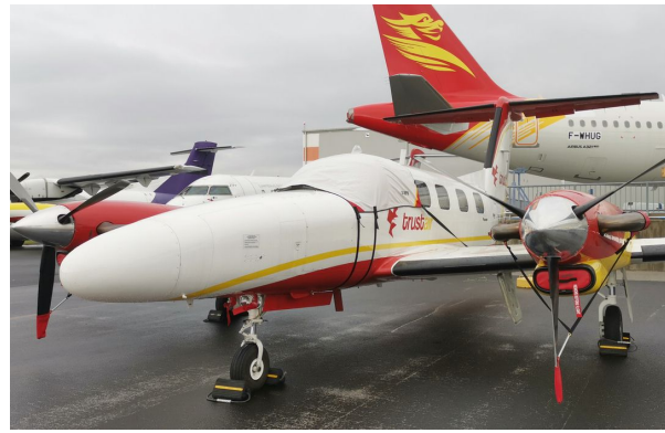
ATR-72-202 Insulated Engine & Prop Hub Covers Piper PA-42 Cheyenne III Cockpit Cover, Prop Tie/Exhaust Cover, Inlet Plugs