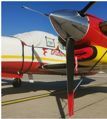
Piper PA-42 Cheyenne III Engine Plugs, Prop Ties, Cockpit Cover

This cover type is made from Silver Acrylic Sunbrella canvas and is 100% lined with a soft and smooth microfiber. Bruce's Custom Covers developed this material combination especially for aircraft protection. The outer material is medium weight and treated for water resistance, UV resistance and anti-static buildup. The inner lining is a very soft and smooth microfiber to prevent scratching. The material is very reflective, and tests show that the cabin interior temperature can be reduced to near-ambient temperature on the hottest of days. It is water, ice and snow repellent, yet breathable to allow moisture to escape from between the cover and the aircraft surface.