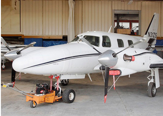
Piper Cheyenne IIXL Prop Tie/Exhaust Covers, Intake Plugs

Engine Inlet Plugs are custom fit for your Piper PA-42 Cheyenne III intakes, made with heavy-duty vinyl material, and stuffed with a single block of sculpted urethane foam. Each plug has a zipper that allows the foam to be removed and dried if necessary. Engine plugs have warning flags that are visible from the cockpit or 'remove before flight' streamers sewn onto the face of the plugs. Most plugs are imprinted with the aircraft registration number in black for an extra charge. Storage bag NOT included. Engine plugs may be inserted after flight when the engine is still warm. Engine Inlet Plugs are commonly referred to as Cowl Plugs, Intake Plugs, Cowl Blocks, Engine Blocks, and Engine Bunges.