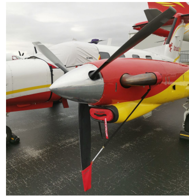
Piper PA-42 Cheyenne III Engine Plugs, Prop Ties, Cockpit Cover Piper PA-42 Cheyenne III Prop Tie/Exhaust Cover, Inlet Plugs