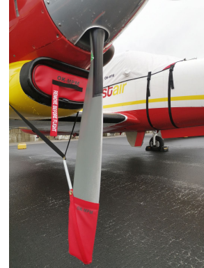
Piper PA-42 Cheyenne III Prop Tie/Exhaust Cover, Inlet Plugs