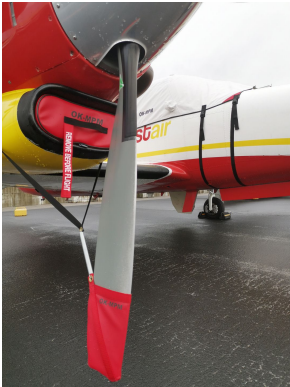
Piper PA-42 Cheyenne III Prop Tie/Exhaust Cover, Inlet Plugs

Engine Inlet Plugs are custom fit for your Piper PA-42 Cheyenne III intakes, made with heavy-duty vinyl material, and stuffed with a single block of sculpted urethane foam. Each plug has a zipper that allows the foam to be removed and dried if necessary. Engine plugs have warning flags that are visible from the cockpit or 'remove before flight' streamers sewn onto the face of the plugs. Most plugs are imprinted with the aircraft registration number in black for an extra charge. Storage bag NOT included. Engine plugs may be inserted after flight when the engine is still warm. Engine Inlet Plugs are commonly referred to as Cowl Plugs, Intake Plugs, Cowl Blocks, Engine Blocks, and Engine Bungs.