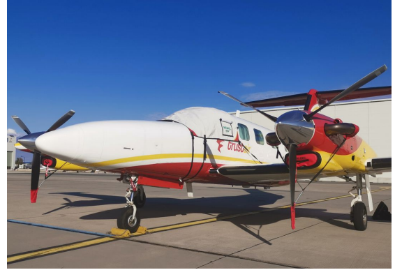
Piper PA-42 Cheyenne III Engine Plugs, Prop Ties, Cockpit Cover