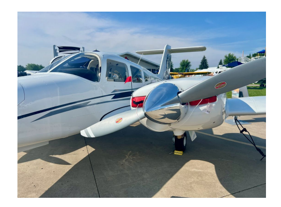
Piper PA-44 Seminole Engine Plugs