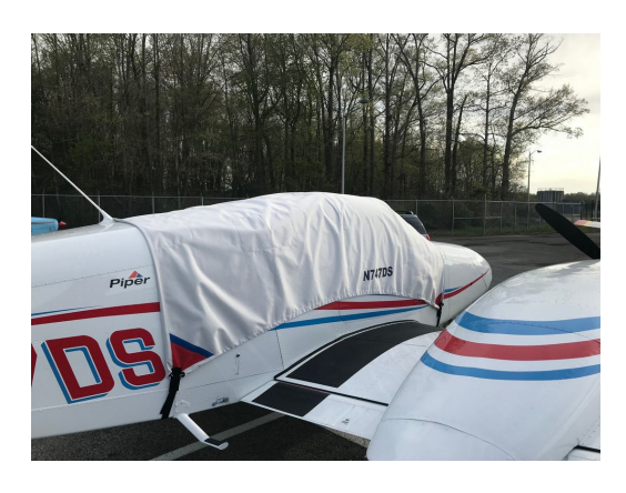
Piper Seminole Canopy Cover