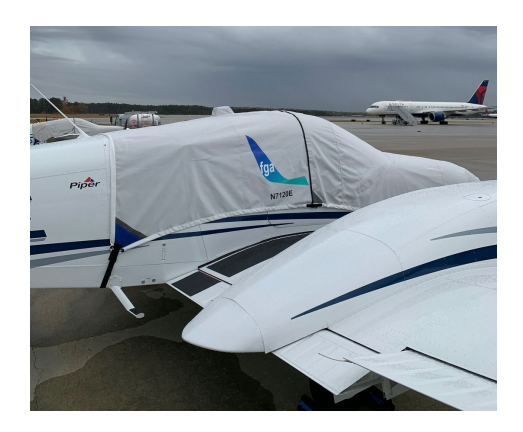
Piper PA-44 Seminole Canopy/Nose Cover