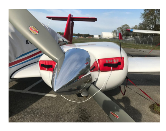
Piper Seminole Engine Plugs