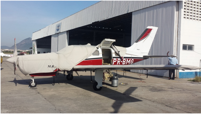
Piper Malibu/Mirage Extended Canopy Cover, Engine, Prop & Wing Covers

WINTER USE MATERIAL - Made with Solution-Dyed Polyester fabric, this option is intended for seasonal use to aid in deicing, rain mitigation, or for occasional travel. The material is lighter and more compact, but more susceptible to UV damage and may have a shorter useful life if used continuously outside than the all-year use material.