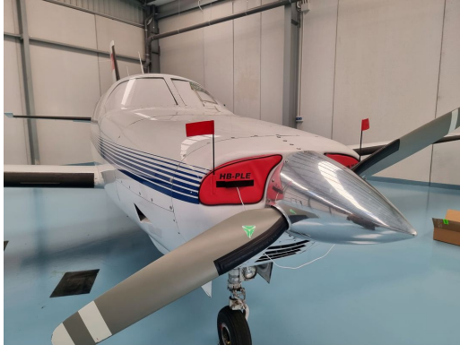
Piper PA-46 Malibu Engine Inlet Plugs

Heatshields are interior sunshades for an aircraft's windows or canopy glass. The product is a unique composite of closed-cell foam with a silver mylar finish. The semi-rigid design is stiff enough to stand along the inside of the windshield using sun visors or window framing. It folds up flat and easily stores in the included storage sleeve. Some designs may require velcro and suction cups. A Heatshield is an excellent short-term remedy for cockpit overheating.