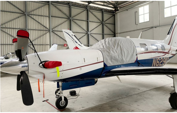
Piper PA-46-500TP Engine Cowling Top Plug