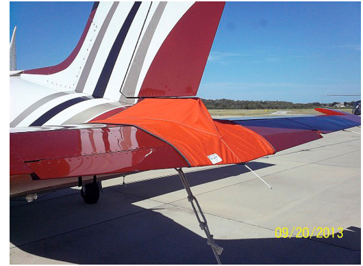
Piper Mirage, Melibu, JetProp, Meridian Tailcone Cover