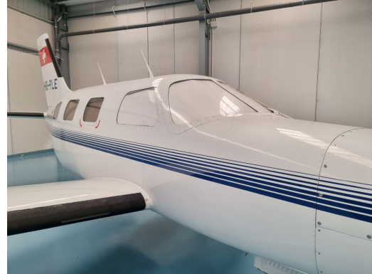
Piper PA-46 Malibu Cockpit Heatshields