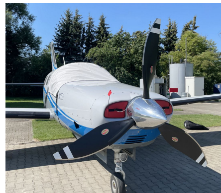
Piper PA-46-350P Cockpit Cover, Engine Plugs