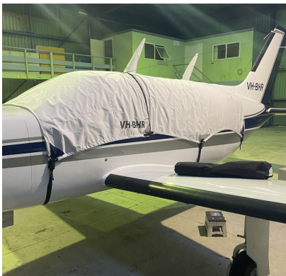
Piper PA-46 Malibu Canopy Cover

This cover type is made from Silver Acrylic Sunbrella canvas and is 100% lined with a soft and smooth microfiber. Bruce's Custom Covers developed this material combination especially for aircraft protection. The outer material is medium weight and treated for water resistance, UV resistance and anti-static buildup. The inner lining is a very soft and smooth microfiber to prevent scratching. The material is very reflective, and tests show that the cabin interior temperature can be reduced to near-ambient temperature on the hottest of days. It is water, ice and snow repellent, yet breathable to allow moisture to escape from between the cover and the aircraft surface.