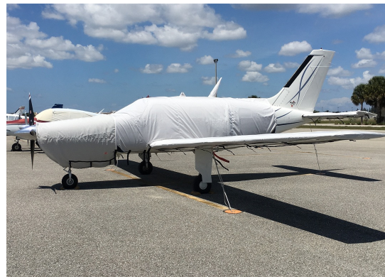
Piper Malibu Extended Canopy Cover, Engine, Wing & Horiz. Stab. Covers