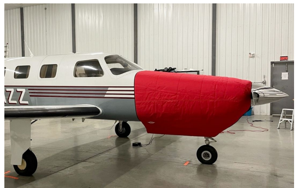
Malibu PA-46-310P Insulated Engine Cover