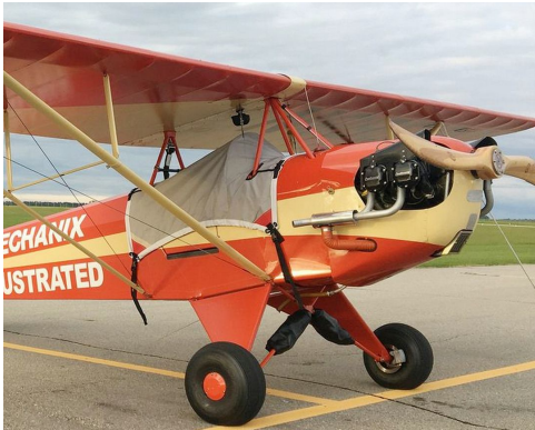
Corben Baby Ace Cockpit Cover

This cover type is made from Silver Acrylic Sunbrella canvas and is 100% lined with a soft and smooth microfiber. Bruce's Custom Covers developed this material combination especially for aircraft protection. The outer material is medium weight and treated for water resistance, UV resistance and anti-static buildup. The inner lining is a very soft and smooth microfiber to prevent scratching. The material is very reflective, and tests show that the cabin interior temperature can be reduced to near-ambient temperature on the hottest of days. It is water, ice and snow repellent, yet breathable to allow moisture to escape from between the cover and the aircraft surface.