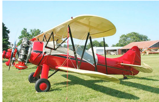
Waco YMF Canopy Cover