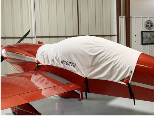
SPA Sport Panther Canopy Cover

This cover type is made from Silver Acrylic Sunbrella canvas and is 100% lined with a soft and smooth microfiber. Bruce's Custom Covers developed this material combination especially for aircraft protection. The outer material is medium weight and treated for water resistance, UV resistance and anti-static buildup. The inner lining is a very soft and smooth microfiber to prevent scratching. The material is very reflective, and tests show that the cabin interior temperature can be reduced to near-ambient temperature on the hottest of days. It is water, ice and snow repellent, yet breathable to allow moisture to escape from between the cover and the aircraft surface.