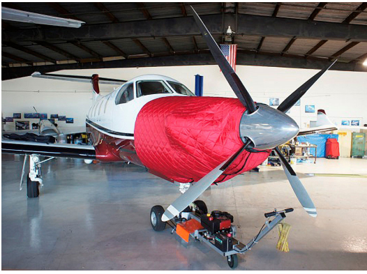
Pilatus PC-12 Insulated Engine Cover