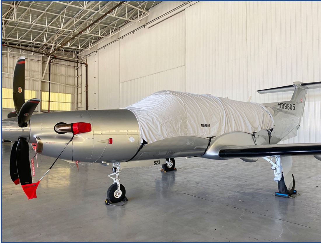
Pilatus PC-12, U-28A, NGX Cockpit Cover, Snap-On Type