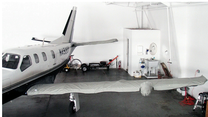
Pilatus PC-12 Wing Covers