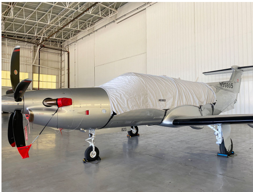
Pilatus PC-12, U-28A, NGX Cockpit Cover, Snap-On Type

This cover type is made from Silver Acrylic Sunbrella canvas and is 100% lined with a soft and smooth microfiber. Bruce's Custom Covers developed this material combination especially for aircraft protection. The outer material is medium weight and treated for water resistance, UV resistance and anti-static buildup. The inner lining is a very soft and smooth microfiber to prevent scratching. The material is very reflective, and tests show that the cabin interior temperature can be reduced to near-ambient temperature on the hottest of days. It is water, ice and snow repellent, yet breathable to allow moisture to escape from between the cover and the aircraft surface.