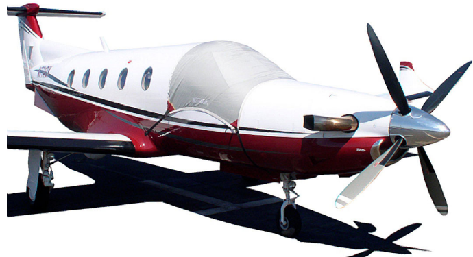
PC-12 Windshield Cover