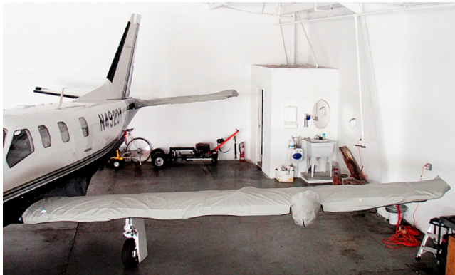
Socata TBM 700, 850 Wing and Horizontal Stabilizer Covers

WINTER USE MATERIAL - Made with Solution-Dyed Polyester fabric, this option is intended for seasonal use to aid in deicing, rain mitigation, or for occasional travel. The material is lighter and more compact, but more susceptible to UV damage and may have a shorter useful life if used continuously outside than the all-year use material.