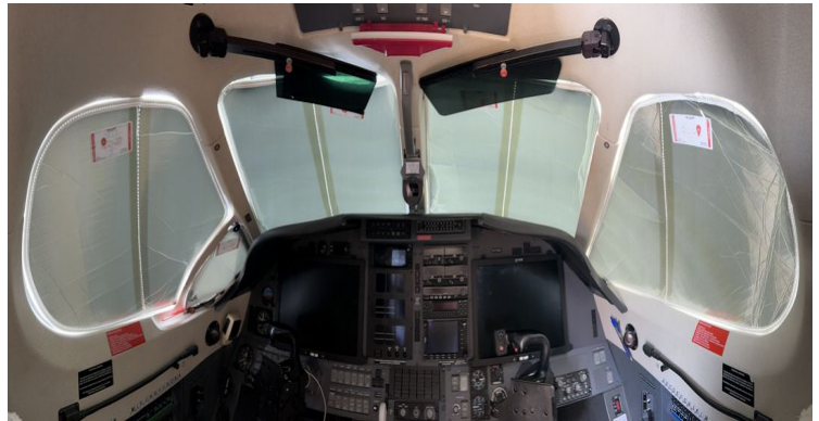
Pilatus PC-12 Cockpit HeatShields