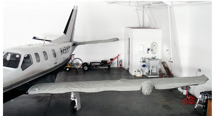
Pilatus PC-12 Wing Covers