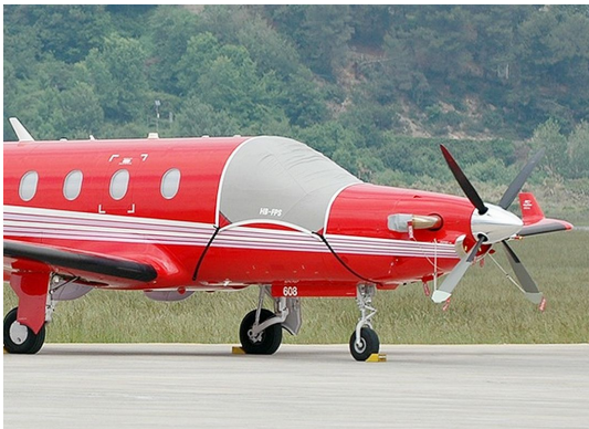
Pilatus PC-12 Windshield Cover

This cover type is made from Silver Acrylic Sunbrella canvas and is 100% lined with a soft and smooth microfiber. Bruce's Custom Covers developed this material combination especially for aircraft protection. The outer material is medium weight and treated for water resistance, UV resistance and anti-static buildup. The inner lining is a very soft and smooth microfiber to prevent scratching. The material is very reflective, and tests show that the cabin interior temperature can be reduced to near-ambient temperature on the hottest of days. It is water, ice and snow repellent, yet breathable to allow moisture to escape from between the cover and the aircraft surface.