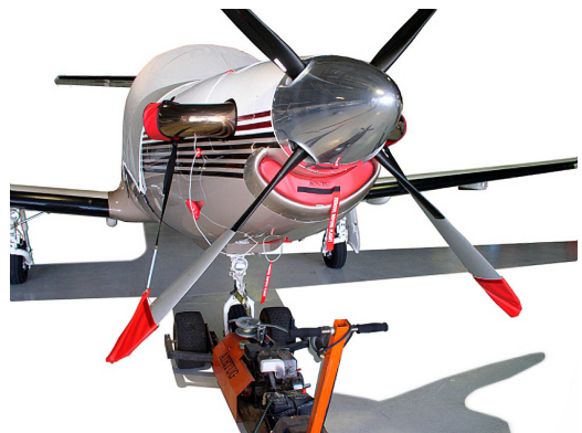
Pilatus PC-12 LARGE ENGINE INLET PLUG, SMALL PLUGS SET, Prop Tie/Exhaust Covers