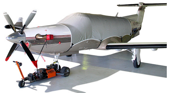
Main Intake Plug and Prop-Tie/Exhaust Covers. (Sold Separately) PC-12 Canopy Cover, Engine Plugs, Prop Tie/Exhaust Covers