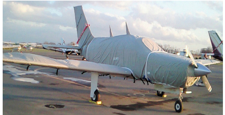
Piper PA-46 Malibu Complete Cover Set