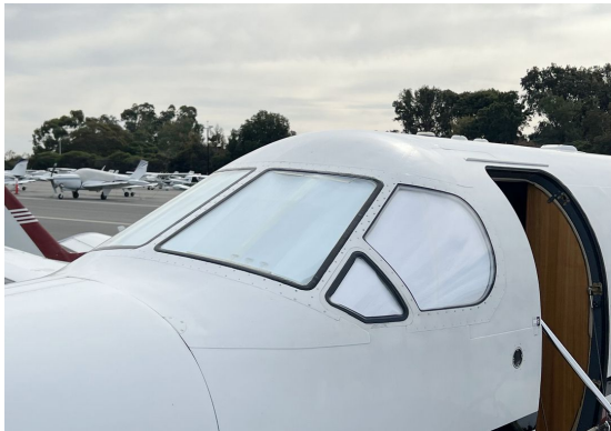
Pilatus PC-12 Cockpit HeatShields

Cockpit Heatshields are interior sunshades for the aircraft's cockpit. The product is a unique composite of closed-cell foam with a silver mylar finish. The semi-rigid design is stiff enough to stand inside the window framing. The set folds up flat and is easily stored in the included storage sleeve. Some designs may require velcro and suction cups. A Heatshield is an excellent short-term remedy for cockpit overheating, but an external fabric cover is more effective for long-term protection.