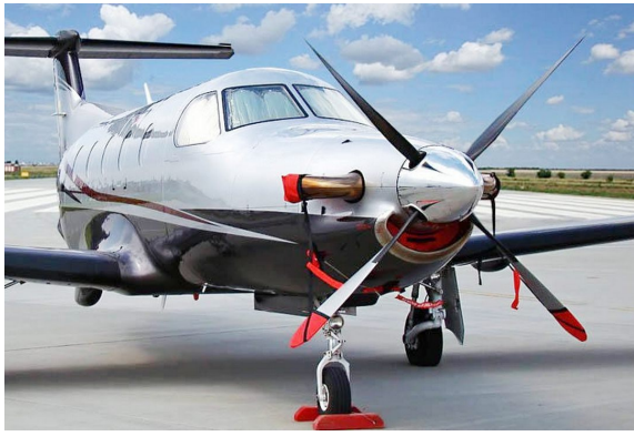
Pilatus PC-12 Engine Plugs, Prop Ties, Cockpit HeatShields