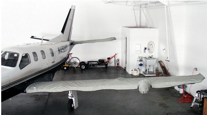
Pilatus PC-12 Wing Covers

WINTER USE MATERIAL - Made with Solution-Dyed Polyester fabric, this option is intended for seasonal use to aid in deicing, rain mitigation, or for occasional travel. The material is lighter and more compact, but more susceptible to UV damage and may have a shorter useful life if used continuously outside than the all-year use material.