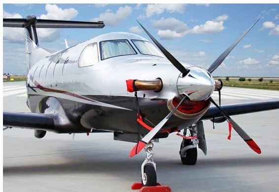
Pilatus PC-12 Engine Plugs, Prop Ties, Cockpit HeatShields