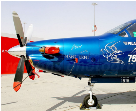
Pilatus PC-12 Prop Tie/Exhaust Covers

This cover type is made from Silver Acrylic Sunbrella canvas and is 100% lined with a soft and smooth microfiber. Bruce's Custom Covers developed this material combination especially for aircraft protection. The outer material is medium weight and treated for water resistance, UV resistance and anti-static buildup. The inner lining is a very soft and smooth microfiber to prevent scratching. The material is very reflective, and tests show that the cabin interior temperature can be reduced to near-ambient temperature on the hottest of days. It is water, ice and snow repellent, yet breathable to allow moisture to escape from between the cover and the aircraft surface.