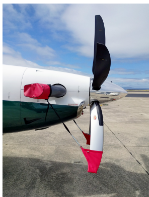
Pilatus PC-12 Prop Tie-Down/Exhaust Cover Set, 5 Blade

This cover type is made from Silver Acrylic Sunbrella canvas and is 100% lined with a soft and smooth microfiber. Bruce's Custom Covers developed this material combination especially for aircraft protection. The outer material is medium weight and treated for water resistance, UV resistance and anti-static buildup. The inner lining is a very soft and smooth microfiber to prevent scratching. The material is very reflective, and tests show that the cabin interior temperature can be reduced to near-ambient temperature on the hottest of days. It is water, ice and snow repellent, yet breathable to allow moisture to escape from between the cover and the aircraft surface.