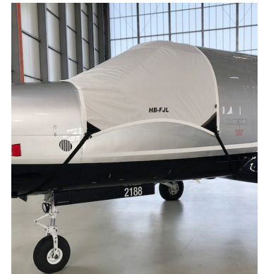
Pilatus PC-12 Cockpit Cover