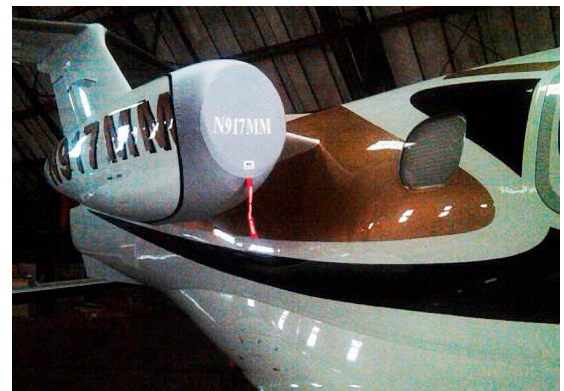
Phenom 100 Intake/Exhaust Cover, "Bikini" Type