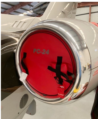
Pilatus PC-24 Engine Intake Plug

The Engine Inlet Plugs are custom fit for your Pilatus PC-24 intakes, made with heavy-duty vinyl material, and stuffed with a single block of sculpted urethane foam. Each plug has a zipper that allows the foam to be removed and dried if necessary. Engine plugs have 'remove before flight' streamers sewn onto the face of the plugs. Most plugs are imprinted with the aircraft registration number in black for an extra charge. Storage bag NOT included. Engine plugs may be inserted after flight when the engine is still warm. Engine Inlet Plugs are commonly referred to as Cowl Plugs, Intake Plugs, Cowl Blocks, Engine Blocks, and Engine Bungs.