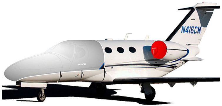
Pilatus PC-24 Cockpit Cover, also cover ice detector (3d model) Citation Mustang Cockpit/Door/Nose Cover, Engine Inlet Cover