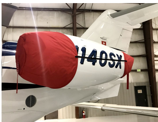
Pilatus PC-24 Engine Cover Set, Tri-Fold Type

The Pilatus PC-24 Intake/Exhaust Plugs are custom fit for the intake and exhaust openings, made with heavy-duty vinyl material, and stuffed with a single block of sculpted urethane foam. Each plug has a zipper that allows the foam to be removed and dried if necessary. Engine plugs have 'remove before flight' streamers sewn onto the face of the plugs. Most plugs are imprinted with the aircraft registration number in black. Engine plugs may be inserted after flight when the engine is still warm. Engine Inlet Plugs are commonly referred to as Cowl Plugs, Intake Plugs, Cowl Blocks, Engine Blocks, and Engine Bungs.