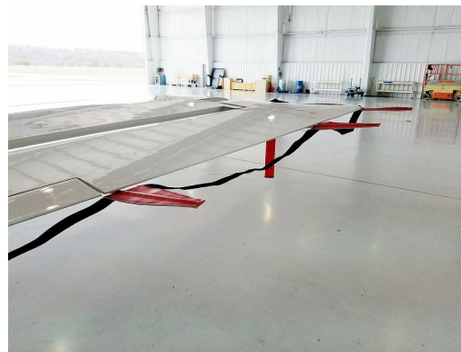
Hawker Beechcraft 800, 800XP, 850XP Static Wick Protectors