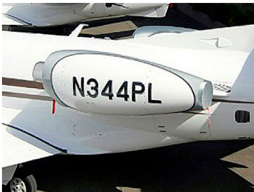
Phenom 300 "Bikini" type Engine Cover

The Pilatus PC-24 Intake/Exhaust Plugs are custom fit for the intake and exhaust openings, made with heavy-duty vinyl material, and stuffed with a single block of sculpted urethane foam. Each plug has a zipper that allows the foam to be removed and dried if necessary. Engine plugs have 'remove before flight' streamers sewn onto the face of the plugs. Most plugs are imprinted with the aircraft registration number in black. Engine plugs may be inserted after flight when the engine is still warm. Engine Inlet Plugs are commonly referred to as Cowl Plugs, Intake Plugs, Cowl Blocks, Engine Blocks, and Engine Bungs.