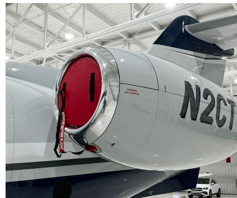
Pilatus PC-24 Engine Inlet Plugs