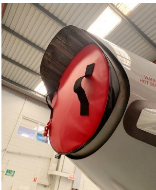
Pilatus PC-24 Engine Exhaust Plug

The Engine Inlet Plugs are custom fit for your Pilatus PC-24 intakes, made with heavy-duty vinyl material, and stuffed with a single block of sculpted urethane foam. Each plug has a zipper that allows the foam to be removed and dried if necessary. Engine plugs have 'remove before flight' streamers sewn onto the face of the plugs. Most plugs are imprinted with the aircraft registration number in black for an extra charge. Storage bag NOT included. Engine plugs may be inserted after flight when the engine is still warm. Engine Inlet Plugs are commonly referred to as Cowl Plugs, Intake Plugs, Cowl Blocks, Engine Blocks, and Engine Bungs.