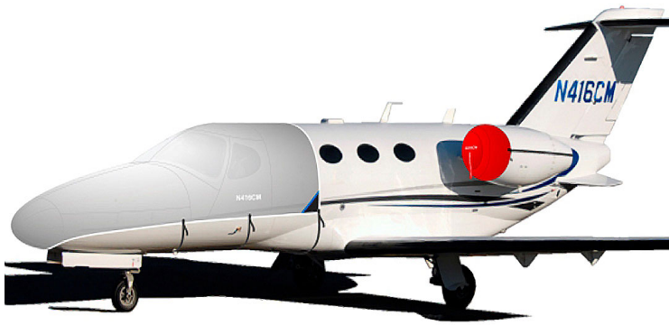
Citation Mustang Cockpit/Door/Nose Cover, Engine Inlet Cover