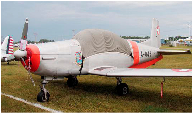
Pilatus P-3 Canopy Cover