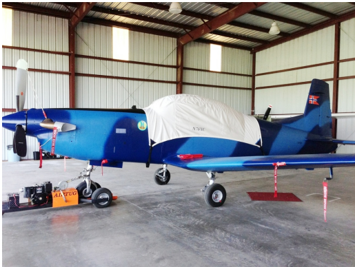
Pilatus PC-7 Canopy Cover

This cover type is made from Silver Acrylic Sunbrella canvas and is 100% lined with a soft and smooth microfiber. Bruce's Custom Covers developed this material combination especially for aircraft protection. The outer material is medium weight and treated for water resistance, UV resistance and anti-static buildup. The inner lining is a very soft and smooth microfiber to prevent scratching. The material is very reflective, and tests show that the cabin interior temperature can be reduced to near-ambient temperature on the hottest of days. It is water, ice and snow repellent, yet breathable to allow moisture to escape from between the cover and the aircraft surface.