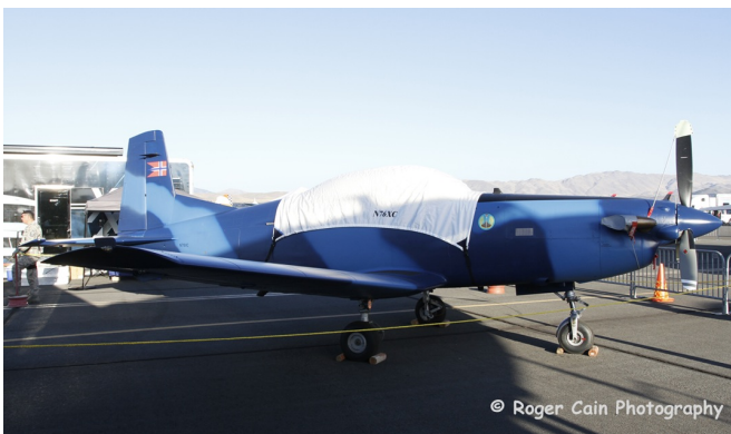
Pilatus PC-7 Canopy Cover

Travel Covers are made with Silver Solution-Dyed Polyester fabric and only lined over the windshield to save weight. The material is lightweight and more compact for easy stowage in the aircraft. The polyester material is water resistant, but only intended for occasional use outside. We also have an ultra lightweight material available for fitted hangar dust covers. For daily outdoor use, the non-travel Sunbrella Cover is the best choice.