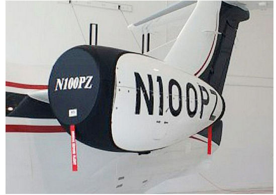
Phenom 100 "Bikini" Engine Covers