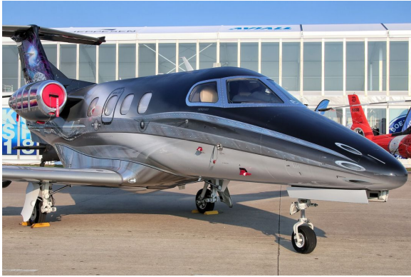
Phenom 100 Engine Inlet Plugs

Engine Inlet Plugs are commonly referred to as Cowl Plugs, Intake Plugs, Cowl Blocks, Engine Blocks, and Engine Bungs.