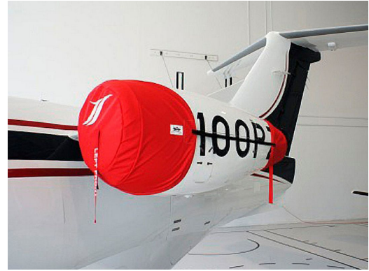
Phenom 100 Tri-fold style Engine Cover Set