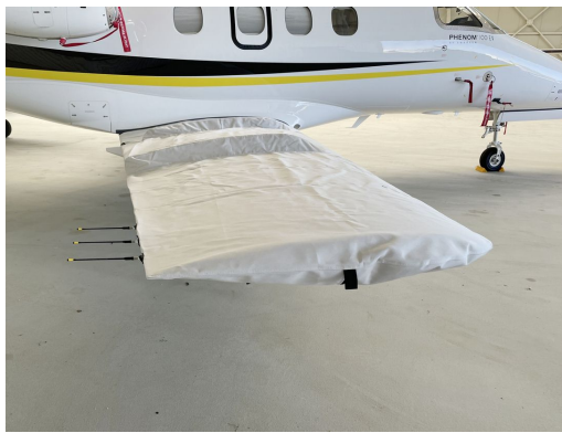
Embraer Phenom 100 Canopy/Nose Cover