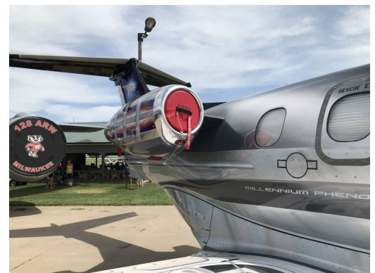
Embraer Phenom I Engine Inlet Plugs