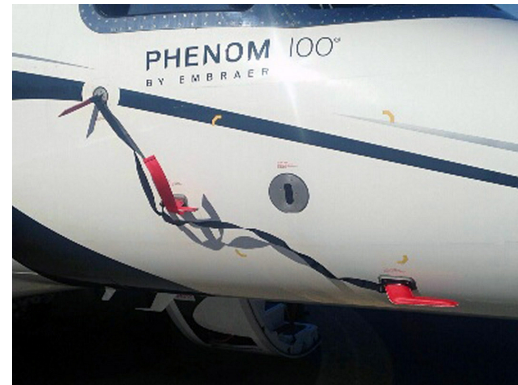
Embraer Phenom Pitot Cover/AOA Set, Heat Resistant Type