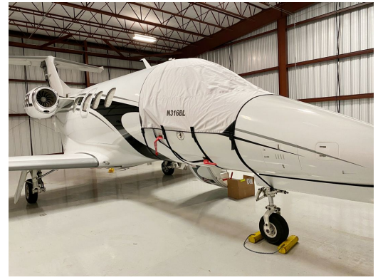
Embraer Phenom 100 Cockpit Cover