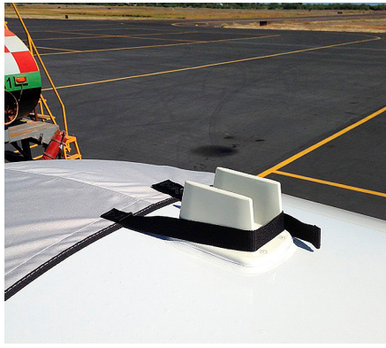
Phenom 100 EMB-500 Cockpit Cover (includes straps to hook around traffic antennae so the cover will not slip forward)