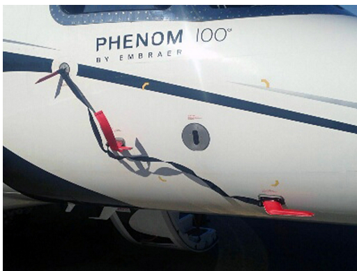
Embraer Phenom Pitot Cover/AOA Set, Heat Resistant Type

The Engine Inlet Plugs are custom fit for your Embraer Phenom 100 (EMB-500) intakes, made with heavy-duty vinyl material, and stuffed with a single block of sculpted urethane foam. Each plug has a zipper that allows the foam to be removed and dried if necessary. Engine plugs have 'remove before flight' streamers sewn onto the face of the plugs. Most plugs are imprinted with the aircraft registration number in black for an extra charge. Storage bag NOT included. Engine plugs may be inserted after flight when the engine is still warm. Engine Inlet Plugs are commonly referred to as Cowl Plugs, Intake Plugs, Cowl Blocks, Engine Blocks, and Engine Bungs.