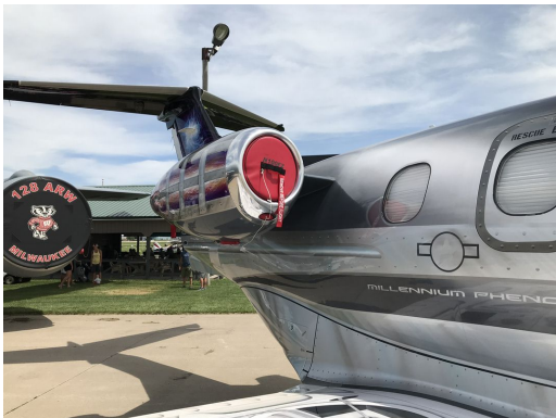
Embraer Phenom I Engine Inlet Plugs

The Engine Inlet Plugs are custom fit for your Embraer Phenom 100 (EMB-500) intakes, made with heavy-duty vinyl material, and stuffed with a single block of sculpted urethane foam. Each plug has a zipper that allows the foam to be removed and dried if necessary. Engine plugs have 'remove before flight' streamers sewn onto the face of the plugs. Most plugs are imprinted with the aircraft registration number in black for an extra charge. Storage bag NOT included. Engine plugs may be inserted after flight when the engine is still warm. Engine Inlet Plugs are commonly referred to as Cowl Plugs, Intake Plugs, Cowl Blocks, Engine Blocks, and Engine Bungs.