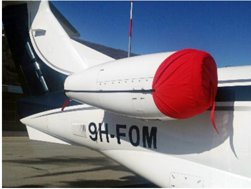
Embraer Phenom Engine Intake Covers & Exhaust Plugs

Engine Inlet Plugs are commonly referred to as Cowl Plugs, Intake Plugs, Cowl Blocks, Engine Blocks, and Engine Bungs.