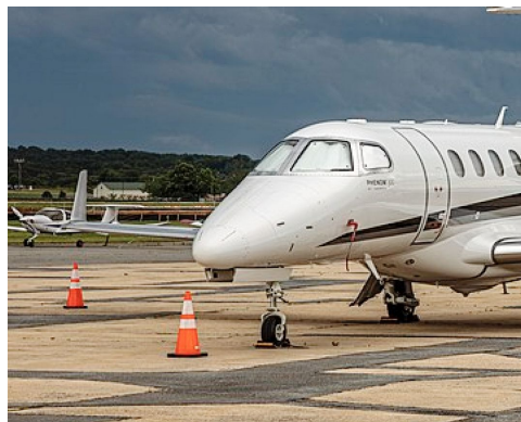
Embraer Phenom 100 Cockpit HeatShields

Cockpit Heatshields are interior sunshades for the aircraft's cockpit. The product is a unique composite of closed-cell foam with a silver mylar finish. The semi-rigid design is stiff enough to stand inside the window framing. The set folds up flat and is easily stored in the included storage sleeve. Some designs may require velcro and suction cups. Our Heatshields for jets are offered white side out because some aircraft manufacturers have issued advisories against reflective window inserts due to potential heat damage. A Heatshield is an excellent short-term remedy for cockpit overheating, but an external fabric cover is more effective for long-term protection.