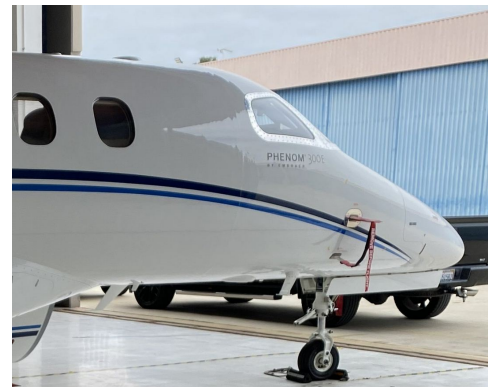
Embraer EMB-505 Pitot Cover Set