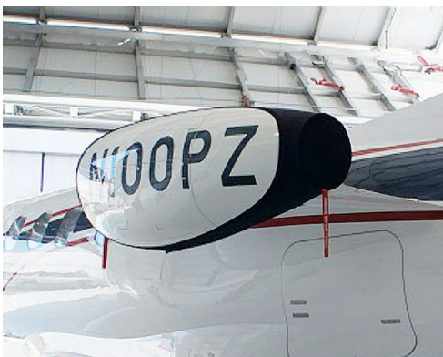
Phenom 100 "Bikini" Engine Covers

The Embraer Phenom 300 (EMB-505) Intake/Exhaust Plugs are custom fit for the intake and exhaust openings, made with heavy-duty vinyl material, and stuffed with a single block of sculpted urethane foam. Each plug has a zipper that allows the foam to be removed and dried if necessary. Engine plugs have 'remove before flight' streamers sewn onto the face of the plugs. Most plugs are imprinted with the aircraft registration number in black. Engine plugs may be inserted after flight when the engine is still warm. Engine Inlet Plugs are commonly referred to as Cowl Plugs, Intake Plugs, Cowl Blocks, Engine Blocks, and Engine Bungs.