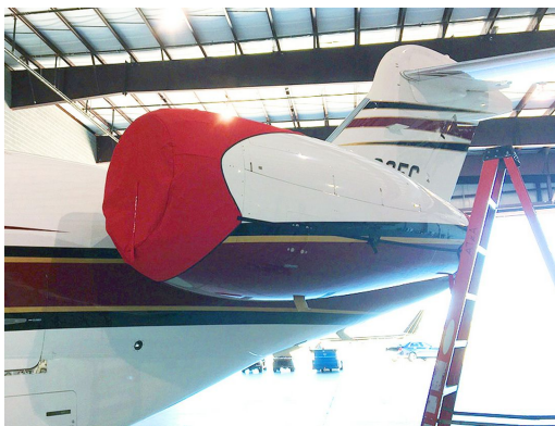
Canadair Challenger 300 Intake/Exhaust Covers, 3-Strap Type

The Embraer Phenom 300 (EMB-505) Intake/Exhaust Plugs are custom fit for the intake and exhaust openings, made with heavy-duty vinyl material, and stuffed with a single block of sculpted urethane foam. Each plug has a zipper that allows the foam to be removed and dried if necessary. Engine plugs have 'remove before flight' streamers sewn onto the face of the plugs. Most plugs are imprinted with the aircraft registration number in black. Engine plugs may be inserted after flight when the engine is still warm. Engine Inlet Plugs are commonly referred to as Cowl Plugs, Intake Plugs, Cowl Blocks, Engine Blocks, and Engine Bungs.