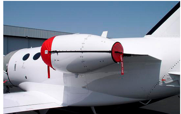
Cessna Mustang Intake/Exhaust Plug Set