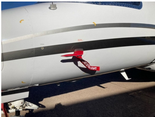
Embraer Phenom 300 (EMB-505) Heat Resistant Pitot Covers

The Engine Inlet Plugs are custom fit for your Embraer Phenom 300 (EMB-505) intakes, made with heavy-duty vinyl material, and stuffed with a single block of sculpted urethane foam. Each plug has a zipper that allows the foam to be removed and dried if necessary. Engine plugs have 'remove before flight' streamers sewn onto the face of the plugs. Most plugs are imprinted with the aircraft registration number in black for an extra charge. Storage bag NOT included. Engine plugs may be inserted after flight when the engine is still warm. Engine Inlet Plugs are commonly referred to as Cowl Plugs, Intake Plugs, Cowl Blocks, Engine Blocks, and Engine Bungs.