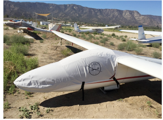
Pilatus B4 Canopy/Nose Cover