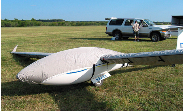
Canopy/Nose Cover, Wings and Horizontal Stab Covers