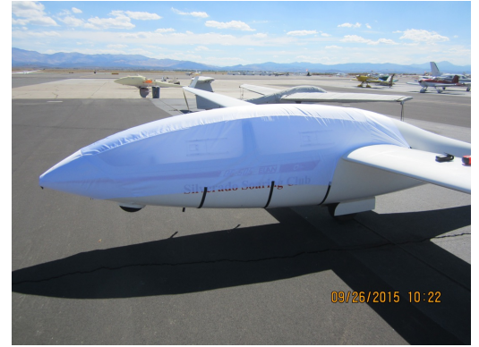
DG-505 Canopy/Nose Cover (test fit cover)