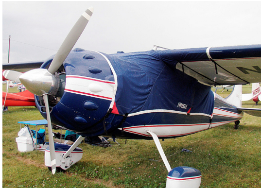
Cessna 195 Canopy Cover, extended forward and over gas caps

water resistance, UV resistance and anti-static buildup. The inner lining is a very soft and smooth microfiber to prevent scratching. The material is very reflective, and tests show that the cabin interior temperature can be reduced to near-ambient temperature on the hottest of days. It is water, ice and snow repellent, yet breathable to allow moisture to escape from between the cover and the aircraft surface.