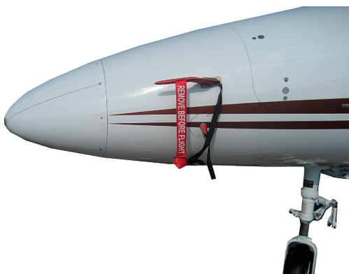
Premier Pitot, AOA, Rosemount Cover Set

The Hawker Beechcraft Premier 390 Intake/Exhaust Plugs are custom fit for the intake and exhaust openings, made with heavy-duty vinyl material, and stuffed with a single block of sculpted urethane foam. Each plug has a zipper that allows the foam to be removed and dried if necessary. Engine plugs have 'remove before flight' streamers sewn onto the face of the plugs. Most plugs are imprinted with the aircraft registration number in black. Engine plugs may be inserted after flight when the engine is still warm. Engine Inlet Plugs are commonly referred to as Cowl Plugs, Intake Plugs, Cowl Blocks, Engine Blocks, and Engine Bungs.