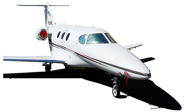
Raytheon Premier Intake Plugs, Pitot Covers & Cockpit HeatShields