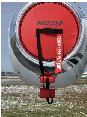
Beech Premier 1A Intake/Exhaust Plug Set

The Hawker Beechcraft Premier 390 Intake/Exhaust Plugs are custom fit for the intake and exhaust openings, made with heavy-duty vinyl material, and stuffed with a single block of sculpted urethane foam. Each plug has a zipper that allows the foam to be removed and dried if necessary. Engine plugs have 'remove before flight' streamers sewn onto the face of the plugs. Most plugs are imprinted with the aircraft registration number in black. Engine plugs may be inserted after flight when the engine is still warm. Engine Inlet Plugs are commonly referred to as Cowl Plugs, Intake Plugs, Cowl Blocks, Engine Blocks, and Engine Bungs.