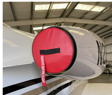
Hawker Beechcraft Premier 390 Intake Plug/Exhaust Plug Set