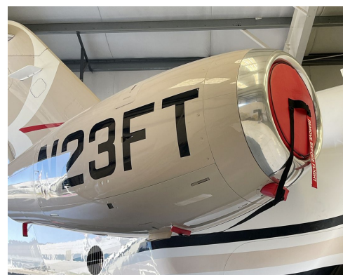
Hawker Beechcraft Premier 390 Intake Plug/Exhaust Plug Set