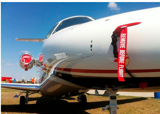
Premier Heat Resistant Pitot Covers set & Engine Intake Plugs

The Hawker Beechcraft Premier 390 Intake/Exhaust Plugs are custom fit for the intake and exhaust openings, made with heavy-duty vinyl material, and stuffed with a single block of sculpted urethane foam. Each plug has a zipper that allows the foam to be removed and dried if necessary. Engine plugs have 'remove before flight' streamers sewn onto the face of the plugs. Most plugs are imprinted with the aircraft registration number in black. Engine plugs may be inserted after flight when the engine is still warm. Engine Inlet Plugs are commonly referred to as Cowl Plugs, Intake Plugs, Cowl Blocks, Engine Blocks, and Engine Bungs.