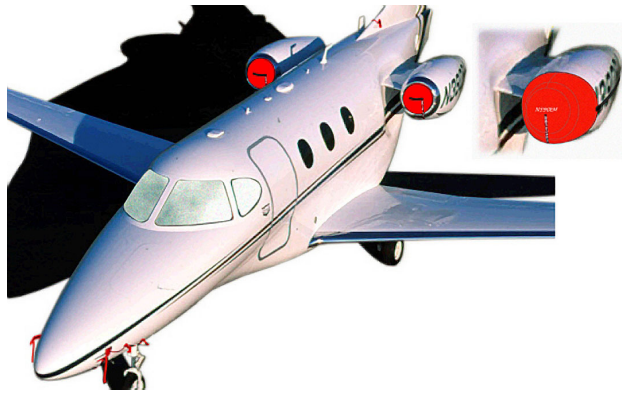
Premier Intake Plugs, Intake Covers, Pitot Covers & Cockpit HeatShields