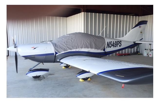
PiperSport Light Weight Travel Cover