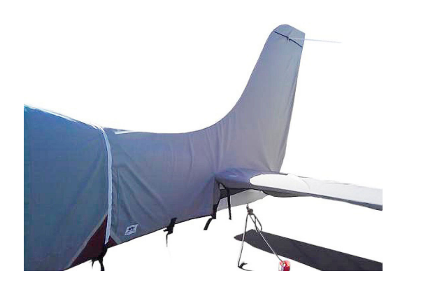
Cirrus SR20 Empennage Cover (covers tail boom, vertical and horizontal stabilizers)

WINTER USE MATERIAL - Made with Solution-Dyed Polyester fabric, this option is intended for seasonal use to aid in deicing, rain mitigation, or for occasional travel. The material is lighter and more compact, but more susceptible to UV damage and may have a shorter useful life if used continuously outside than the all-year use material.