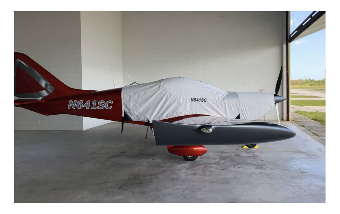
Czech Aircraft Sport Cruiser Extended Canopy/Engine Cover

This cover type is made from Silver Acrylic Sunbrella canvas and is 100% lined with a soft and smooth microfiber. Bruce's Custom Covers developed this material combination especially for aircraft protection. The outer material is medium weight and treated for water resistance, UV resistance and anti-static buildup. The inner lining is a very soft and smooth microfiber to prevent scratching. The material is very reflective, and tests show that the cabin interior temperature can be reduced to near-ambient temperature on the hottest of days. It is water, ice and snow repellent, yet breathable to allow moisture to escape from between the cover and the aircraft surface.