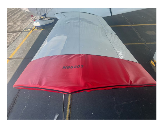
Piper PA-28-140 Wingtip Pads

Designed to prevent damage to the aircraft extremities in crowded hangars, these products are made of bright red Naugahyde and thickly padded with a sandwich of closed cell foam.