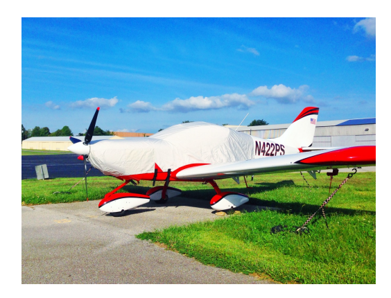
SportCruiser Canopy/Engine Cover

Travel Covers are made with Silver Solution-Dyed Polyester fabric and only lined over the windshield to save weight. The material is lightweight and more compact for easy stowage in the aircraft. The polyester material is water resistant, but only intended for occasional use outside. We also have an ultra lightweight material available for fitted hangar dust covers. For daily outdoor use, the non-travel Sunbrella Cover is the best choice.