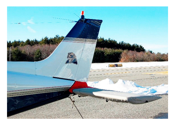
Tailcone & Horizontal Stabilizer Covers