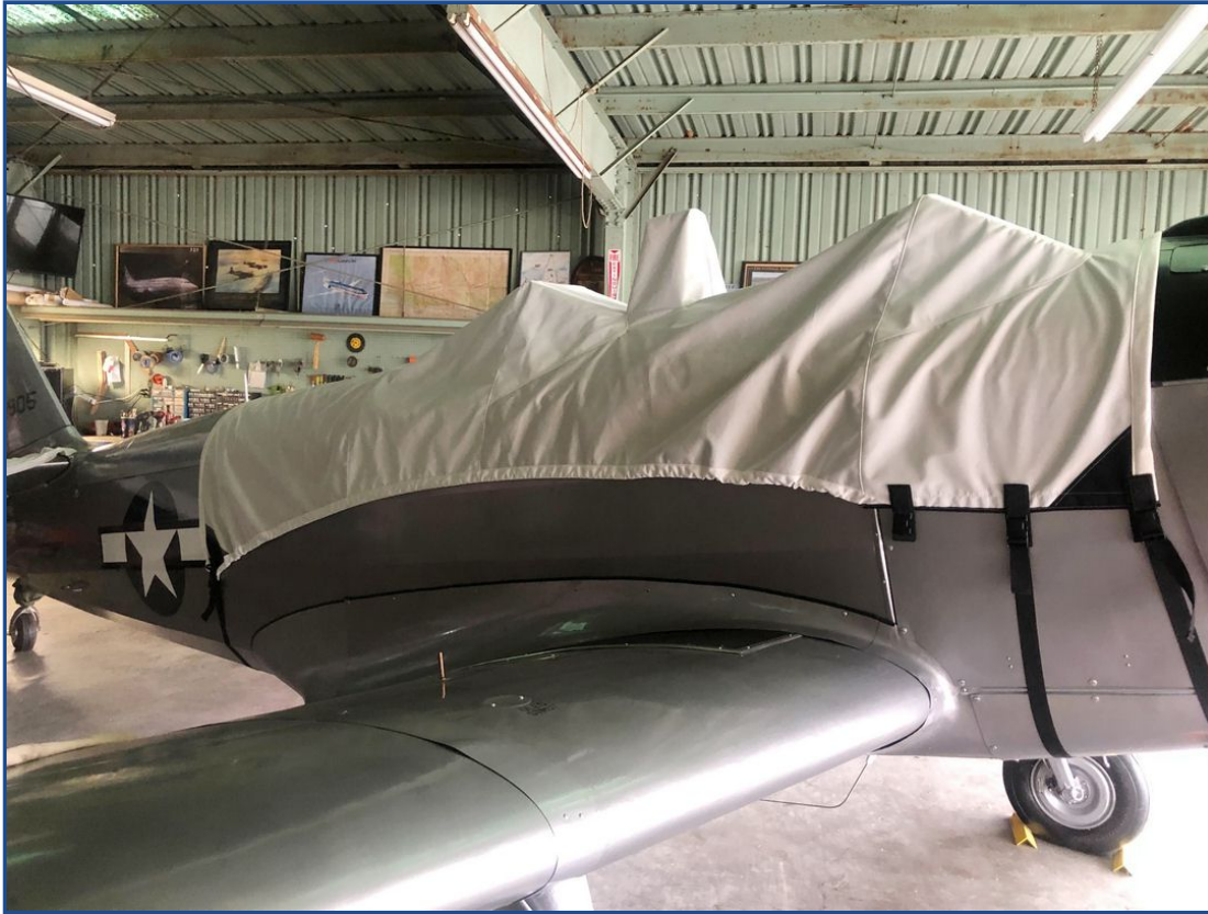
Fairchild PT-23 Canopy Cover