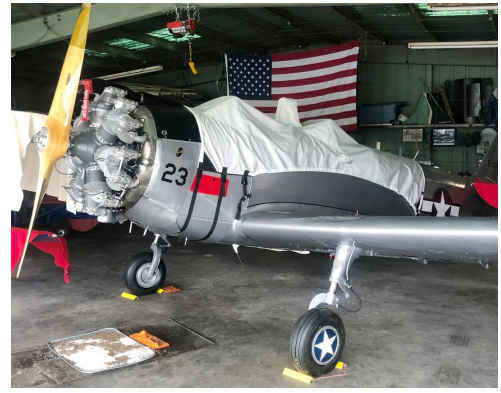
Fairchild PT-23 Canopy Cover