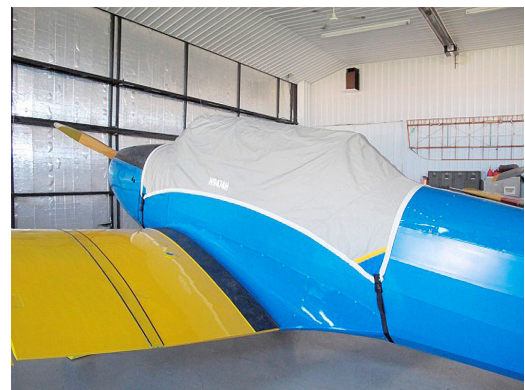
Fairchild PT-26 Canopy Cover