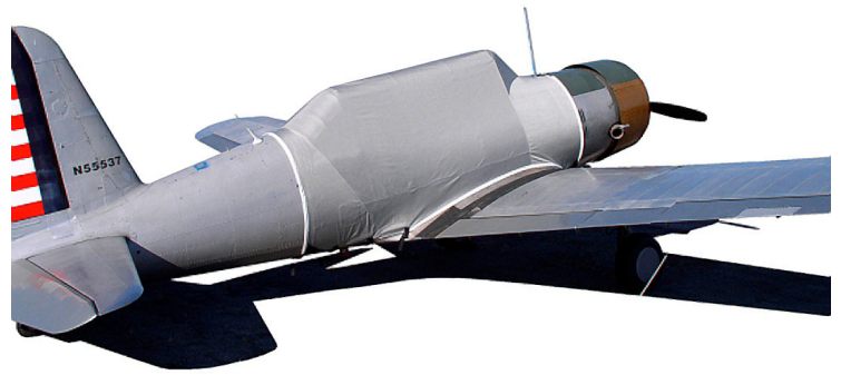
BT-13 Extended Canopy Cover