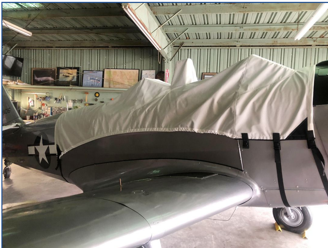
Fairchild PT-23 Canopy Cover