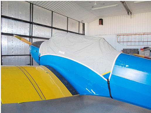
Fairchild PT-26 Canopy Cover

Travel Covers are made with Silver Solution-Dyed Polyester fabric and only lined over the windshield to save weight. The material is lightweight and more compact for easy stowage in the aircraft. The polyester material is water resistant, but only intended for occasional use outside. We also have an ultra lightweight material available for fitted hangar dust covers. For daily outdoor use, the non-travel Sunbrella Cover is the best choice.