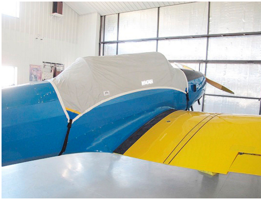
Fairchild PT-26 Canopy Cover