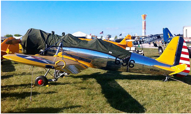
Ryan PT-22 ST3KR Canopy Cover and Engine Cover

water resistance, UV resistance and anti-static buildup. The inner lining is a very soft and smooth microfiber to prevent scratching. The material is very reflective, and tests show that the cabin interior temperature can be reduced to near-ambient temperature on the hottest of days. It is water, ice and snow repellent, yet breathable to allow moisture to escape from between the cover and the aircraft surface.