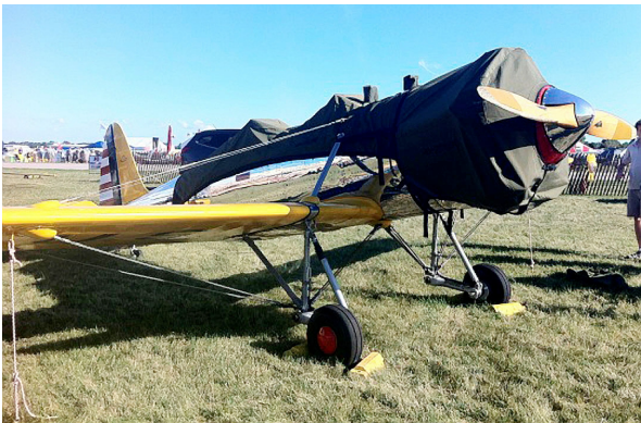
Ryan PT-22 Canopy Cover and Engine Cover