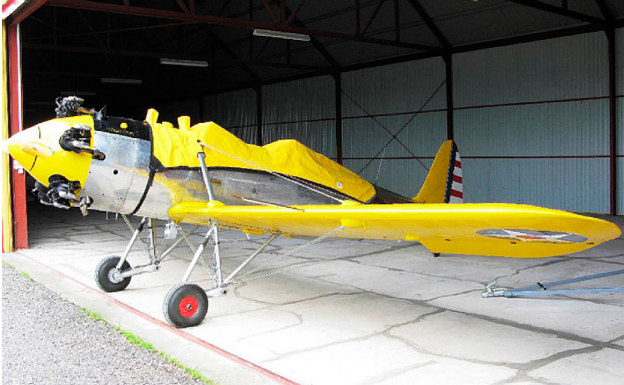
Ryan PT22 Canopy Cover

This cover type is made from Silver Acrylic Sunbrella canvas and is 100% lined with a soft and smooth microfiber. Bruce's Custom Covers developed this material combination especially for aircraft protection. The outer material is medium weight and treated for water resistance, UV resistance and anti-static buildup. The inner lining is a very soft and smooth microfiber to prevent scratching. The material is very reflective, and tests show that the cabin interior temperature can be reduced to near-ambient temperature on the hottest of days. It is water, ice and snow repellent, yet breathable to allow moisture to escape from between the cover and the aircraft surface.