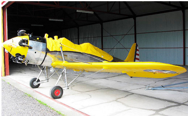
Ryan PT22 Canopy Cover

This cover type is made from Silver Acrylic Sunbrella canvas and is 100% lined with a soft and smooth microfiber. Bruce's Custom Covers developed this material combination especially for aircraft protection. The outer material is medium weight and treated for water resistance, UV resistance and anti-static buildup. The inner lining is a very soft and smooth microfiber to prevent scratching. The material is very reflective, and tests show that the cabin interior temperature can be reduced to near-ambient temperature on the hottest of days. It is water, ice and snow repellent, yet breathable to allow moisture to escape from between the cover and the aircraft surface.