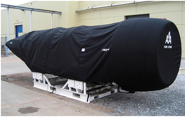
PW JT8D Off-Link Protective Long-term Storage "Rain Cap" Style Engine Cover