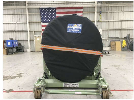
CFM56-5B Off Link Cover, fully enclosed