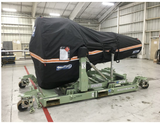
CFM56-5B Off Link Cover, fully enclosed