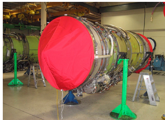
PW JT9D Series Off-Link Engine Transport Cover, Fully Enclosed, P/N: PW-120 PW JT8D Off-Link Engine Shower Cap Cover Set