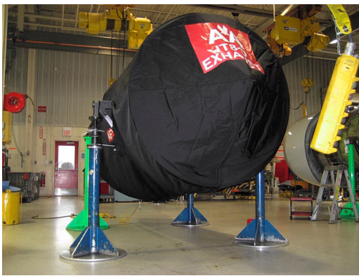
PW JT8D Off-Link Engine Transport Cover (no nose cone, no TR's), fully enclosed