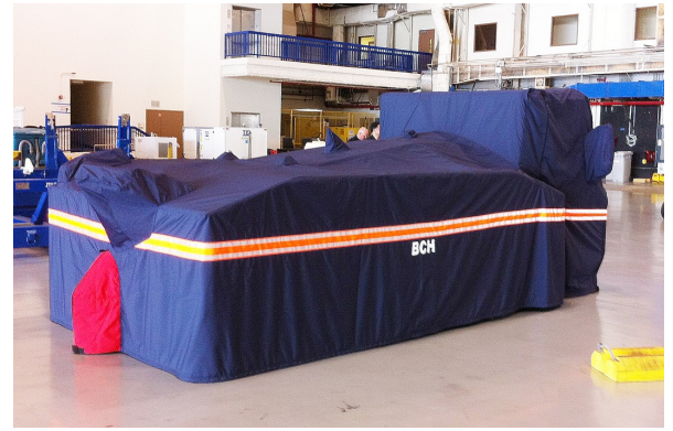
Complete Cover for Eagle Tug