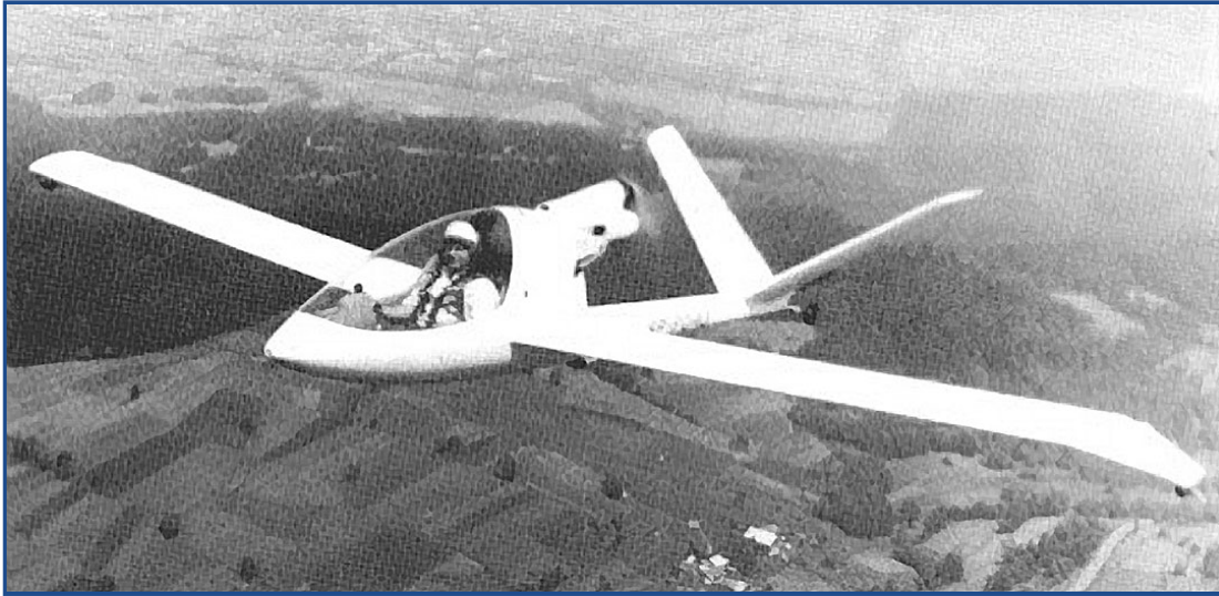
Canopy/Engine Cover for the J-5 Marco