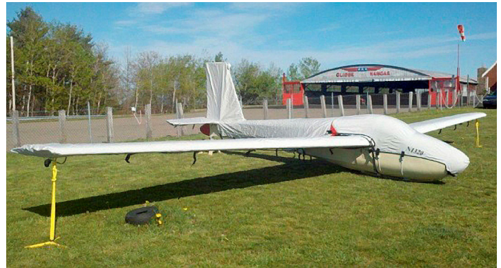
Schweizer 1-26B Canopy/Nose, Empennage & Wing Covers