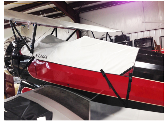
Waco QCF/UBF Canopy Cover