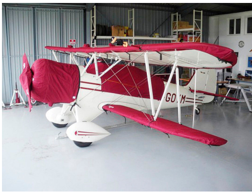
Waco UPF-7 Canopy, Wings, Stab's, Engine, Prop Covers