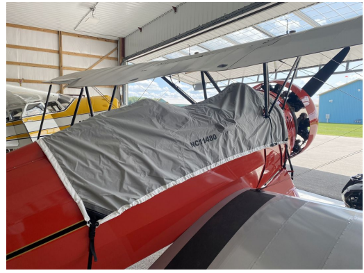
Waco QCF-2 Travel Weight Canopy Cover