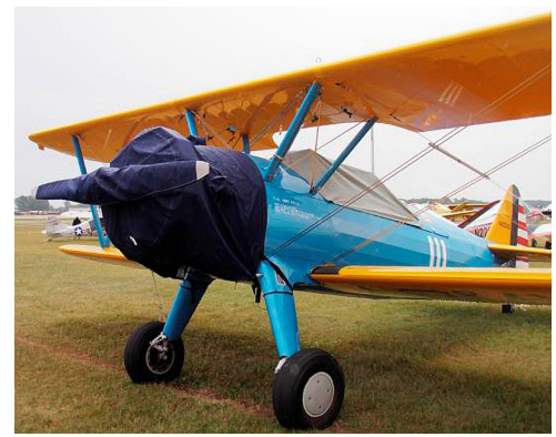
Stearman PT-13 Engine Cover