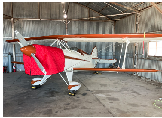
SKYBOLT, Insulated Hangar Blanket, Custom Fit Interior Use)