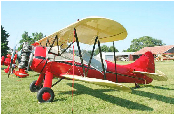
Waco YMF Canopy Cover