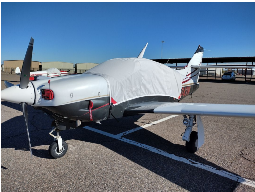
Rockwell Aero Commander 112, 114 Engine Inlet Plugs (112 Model) Rockwell Aero Commander 114 Canopy Cover, Engine Plugs