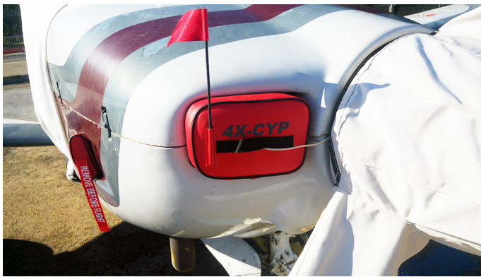
Rockwell Aero Commander 112, 114 Engine Inlet Plugs (114 Model)

Engine Inlet Plugs are custom fit for your Rockwell Aero Commander 112, 114 intakes, made with heavy-duty vinyl material, and stuffed with a single block of sculpted urethane foam. Each plug has a zipper that allows the foam to be removed and dried if necessary. Engine plugs have warning flags that are visible from the cockpit or 'remove before flight' streamers sewn onto the face of the plugs. Most plugs are imprinted with the aircraft registration number in black for an extra charge. Storage bag NOT included. Engine plugs may be inserted after flight when the engine is still warm. Engine Inlet Plugs are commonly referred to as Cowl Plugs, Intake Plugs, Cowl Blocks, Engine Blocks, and Engine Bungs.