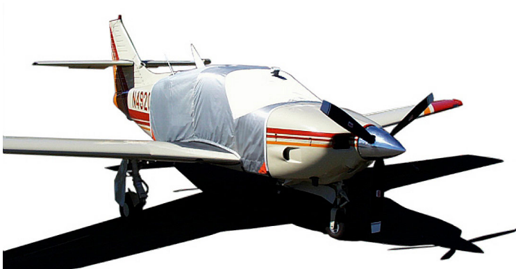
Extended Canopy Cover

This cover type is made from Silver Acrylic Sunbrella canvas and is 100% lined with a soft and smooth microfiber. Bruce's Custom Covers developed this material combination especially for aircraft protection. The outer material is medium weight and treated for water resistance, UV resistance and anti-static buildup. The inner lining is a very soft and smooth microfiber to prevent scratching. The material is very reflective, and tests show that the cabin interior temperature can be reduced to near-ambient temperature on the hottest of days. It is water, ice and snow repellent, yet breathable to allow moisture to escape from between the cover and the aircraft surface.