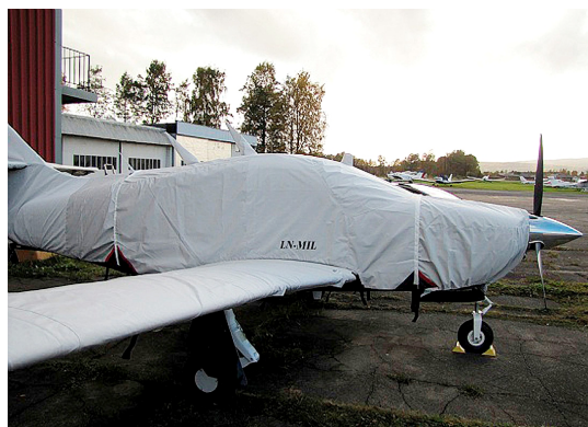
Rockwell Commander Engine, Extended Canopy, Wings, & Empennage Covers