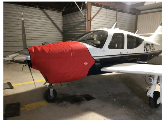
Aero Commander 112 Insulated engine cover