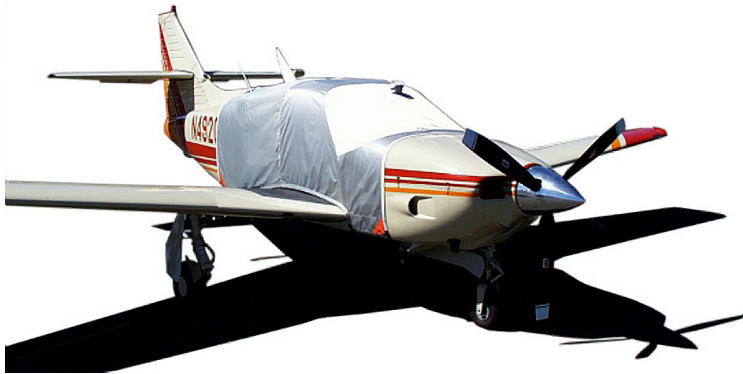
Extended Canopy Cover

This cover type is made from Silver Acrylic Sunbrella canvas and is 100% lined with a soft and smooth microfiber. Bruce's Custom Covers developed this material combination especially for aircraft protection. The outer material is medium weight and treated for water resistance, UV resistance and anti-static buildup. The inner lining is a very soft and smooth microfiber to prevent scratching. The material is very reflective, and tests show that the cabin interior temperature can be reduced to near-ambient temperature on the hottest of days. It is water, ice and snow repellent, yet breathable to allow moisture to escape from between the cover and the aircraft surface.