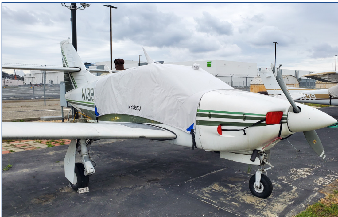
Rockwell International 112A Canopy Cover