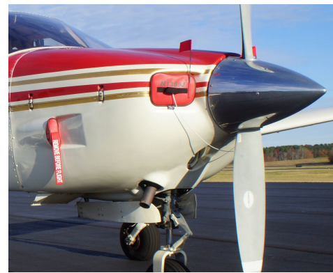
Rockwell Aero Commander 112, 114 Engine Inlet Plugs (112 Model)