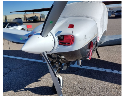
Rockwell Aero Commander 112, 114 Engine Inlet Plugs (112 Model) Rockwell Aero Commander 114 Canopy Cover, Engine Plugs