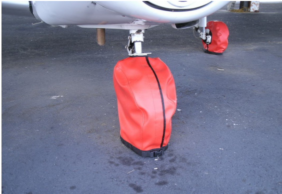
Piper PA28-140 Tire Covers

ALL-YEAR USE MATERIAL - Made with Silver Acrylic Sunbrella canvas, the all-year use material is the best option for sun protection and cover longevity. This heavier more durable material is intended for all weather conditions, such as rain and snow or lots of sun.