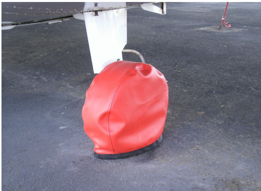
Piper PA28-140 Tire Covers