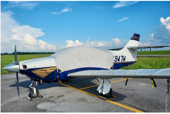
Rockwell 114 Canopy Cover & Wing Covers