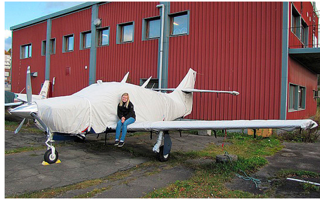
Rockwell Commander Engine, Extended Canopy, Wings, & Empennage Covers