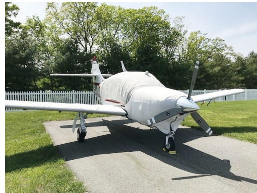
Rockwell Commander 114A Canopy, Engine, Wings & Horizontal Stab. Covers