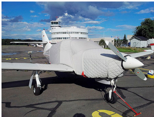
Rockwell Commander 114 Extended Canopy, Insulated Engine, Wing Covers

This cover type is made from Silver Acrylic Sunbrella canvas and is 100% lined with a soft and smooth microfiber. Bruce's Custom Covers developed this material combination especially for aircraft protection. The outer material is medium weight and treated for water resistance, UV resistance and anti-static buildup. The inner lining is a very soft and smooth microfiber to prevent scratching. The material is very reflective, and tests show that the cabin interior temperature can be reduced to near-ambient temperature on the hottest of days. It is water, ice and snow repellent, yet breathable to allow moisture to escape from between the cover and the aircraft surface.