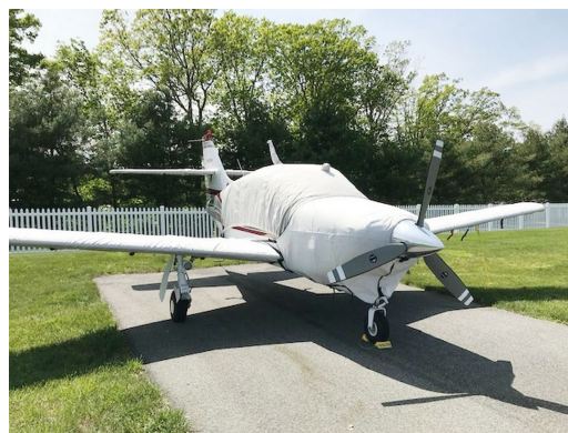
Rockwell Commander 114A Canopy, Engine, Wings & Horizontal Stab. Covers