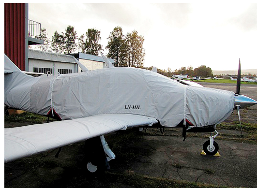
Rockwell Commander Engine, Extended Canopy, Wings, & Empennage Covers