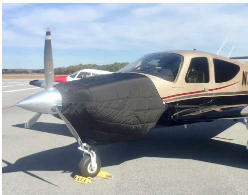
Rockwell Aero Commander Insulated Engine Cover

This cover type is made from Silver Acrylic Sunbrella canvas and is 100% lined with a soft and smooth microfiber. Bruce's Custom Covers developed this material combination especially for aircraft protection. The outer material is medium weight and treated for water resistance, UV resistance and anti-static buildup. The inner lining is a very soft and smooth microfiber to prevent scratching. The material is very reflective, and tests show that the cabin interior temperature can be reduced to near-ambient temperature on the hottest of days. It is water, ice and snow repellent, yet breathable to allow moisture to escape from between the cover and the aircraft surface.