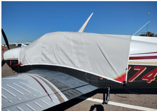
Rockwell Aero Commander 114 Canopy Cover