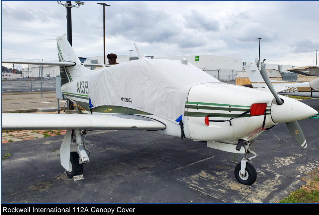
Rockwell International 112A Canopy Cover