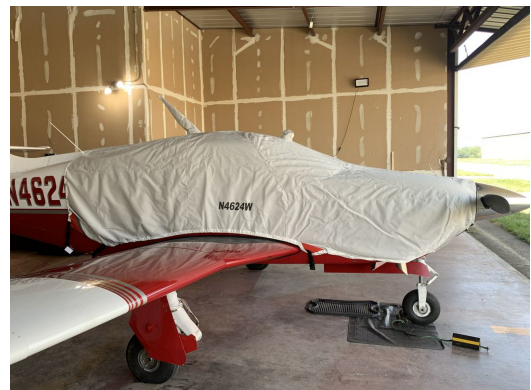
Rockwell Aero Commander Extended Canopy/Engine Cover