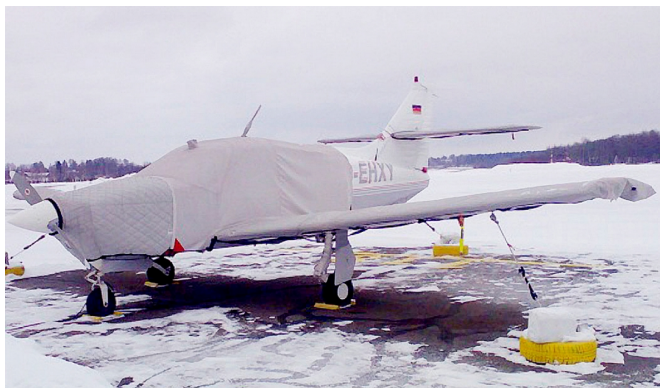
Rockwell Commander Extended Canopy Cover, Insulated Engine Cover, Wing & Tail Covers