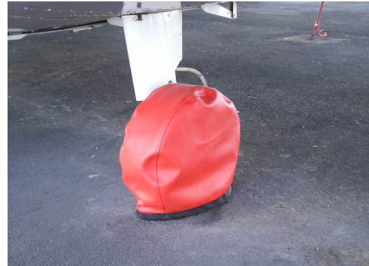
Piper PA28-140 Tire Covers