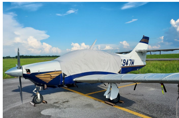
Rockwell 114 Canopy Cover & Wing Covers