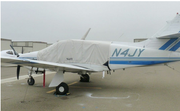
Rockwell 112TC Canopy Cover

This cover type is made from Silver Acrylic Sunbrella canvas and is 100% lined with a soft and smooth microfiber. Bruce's Custom Covers developed this material combination especially for aircraft protection. The outer material is medium weight and treated for water resistance, UV resistance and anti-static buildup. The inner lining is a very soft and smooth microfiber to prevent scratching. The material is very reflective, and tests show that the cabin interior temperature can be reduced to near-ambient temperature on the hottest of days. It is water, ice and snow repellent, yet breathable to allow moisture to escape from between the cover and the aircraft surface.