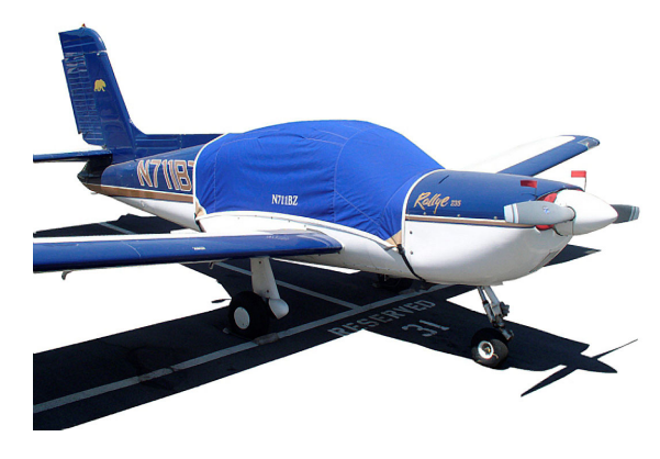
SOCATA Rallye 150 Canopy Cover, Prop Cover