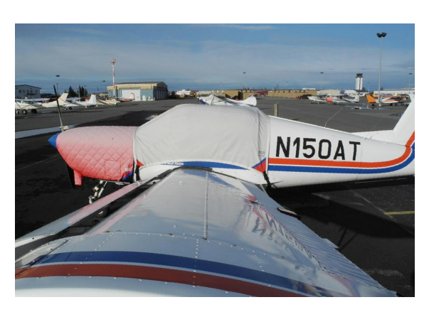
Koliber 150A Canopy Cover, Insulated Engine Cover