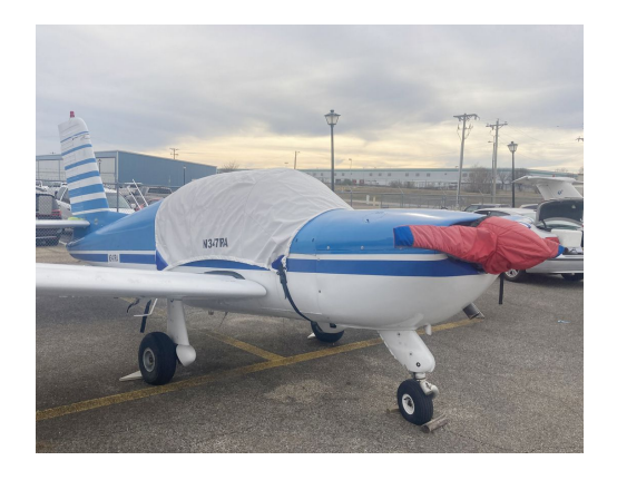
SOCATA Rallye 150 Canopy Cover, Prop Cover

This cover type is made from Silver Acrylic Sunbrella canvas and is 100% lined with a soft and smooth microfiber. Bruce's Custom Covers developed this material combination especially for aircraft protection. The outer material is medium weight and treated for water resistance, UV resistance and anti-static buildup. The inner lining is a very soft and smooth microfiber to prevent scratching. The material is very reflective, and tests show that the cabin interior temperature can be reduced to near-ambient temperature on the hottest of days. It is water, ice and snow repellent, yet breathable to allow moisture to escape from between the cover and the aircraft surface.