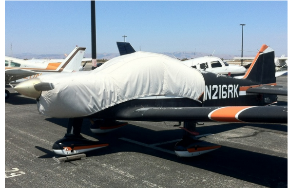
Robin Canopy/Engine Cover