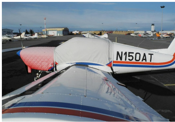
Koliber 150A Canopy Cover, Insulated Engine Cover