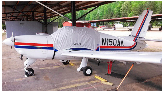
Rallye Canopy Cover