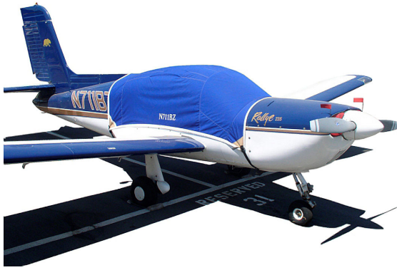
Rallye Canopy Cover