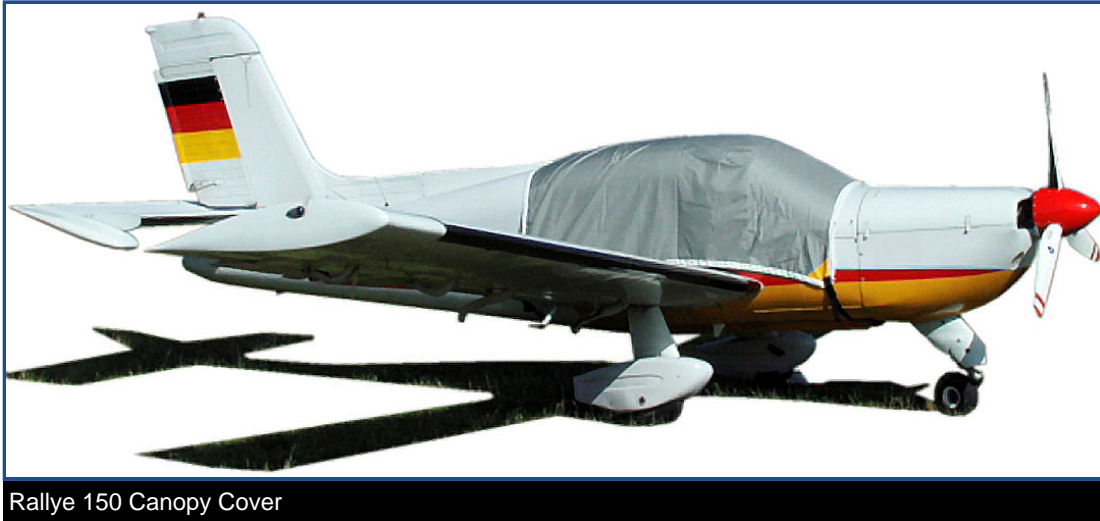
Rallye 150 Canopy Cover