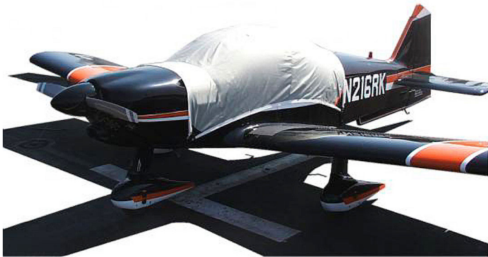
Robin R.2160 Canopy Cover

Travel Covers are made with Silver Solution-Dyed Polyester fabric and only lined over the windshield to save weight. The material is lightweight and more compact for easy stowage in the aircraft. The polyester material is water resistant, but only intended for occasional use outside. We also have an ultra lightweight material available for fitted hangar dust covers. For daily outdoor use, the non-travel Sunbrella Cover is the best choice.