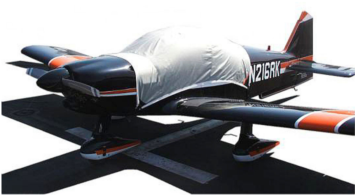
Robin R.2160 Canopy Cover