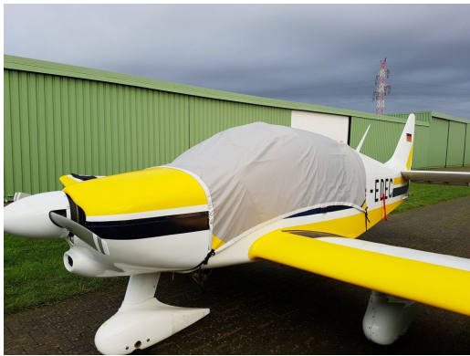
Robin DR400/R Travel Cover, Light Weight Travel Canopy Cover

the hottest of days. It is water, ice and snow repellent, yet breathable to allow moisture to escape from between the cover and the aircraft surface.