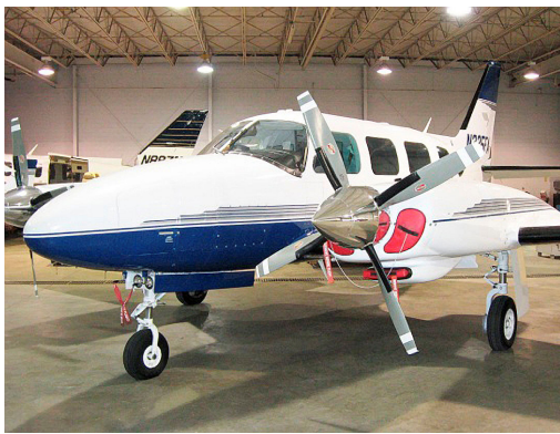
Piper Navajo PA31 Engine Inlet Plugs (Panther Conversion)