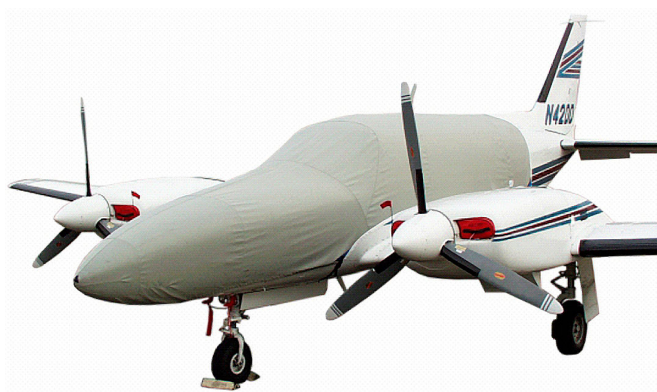
Piper Navajo CR Canopy/Nose Cover