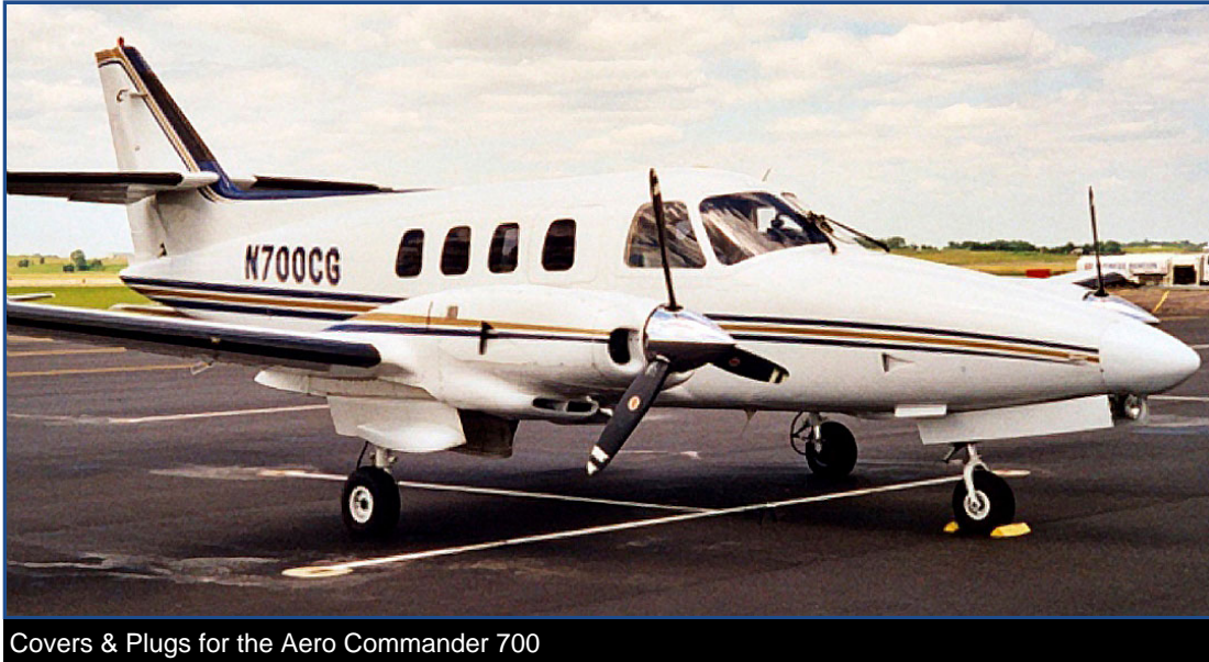
Covers &amp; Plugs for the Aero Commander 700