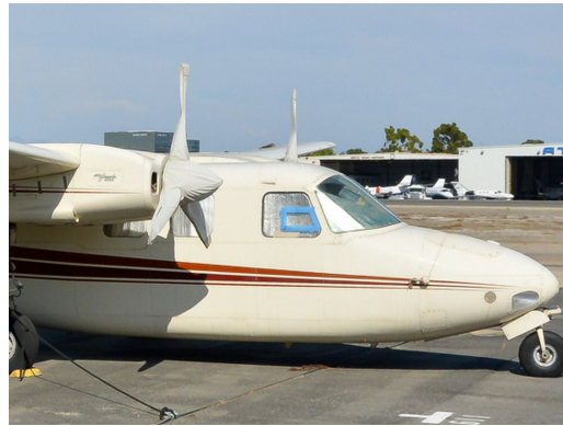
Aero Commander AC500 Ptopellor/Spinner Covers

This cover type is made from Silver Acrylic Sunbrella canvas and is 100% lined with a soft and smooth microfiber. Bruce's Custom Covers developed this material combination especially for aircraft protection. The outer material is medium weight and treated for water resistance, UV resistance and anti-static buildup. The inner lining is a very soft and smooth microfiber to prevent scratching. The material is very reflective, and tests show that the cabin interior temperature can be reduced to near-ambient temperature on the hottest of days. It is water, ice and snow repellent, yet breathable to allow moisture to escape from between the cover and the aircraft surface.