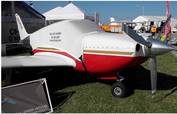
Ravin 500 Canopy Cover

This cover type is made from Silver Acrylic Sunbrella canvas and is 100% lined with a soft and smooth microfiber. Bruce's Custom Covers developed this material combination especially for aircraft protection. The outer material is medium weight and treated for water resistance, UV resistance and anti-static buildup. The inner lining is a very soft and smooth microfiber to prevent scratching. The material is very reflective, and tests show that the cabin interior temperature can be reduced to near-ambient temperature on the hottest of days. It is water, ice and snow repellent, yet breathable to allow moisture to escape from between the cover and the aircraft surface.