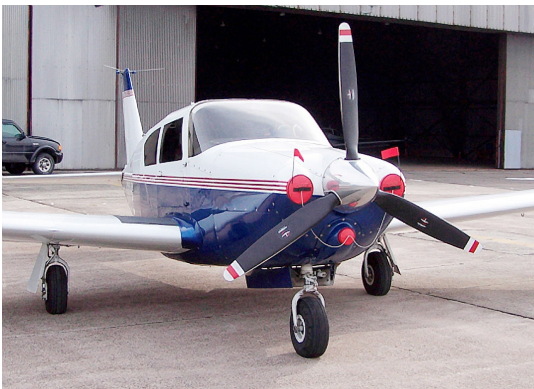
Piper Comanche Engine Plugs

Engine Inlet Plugs are custom fit for your Ravin 300 & 500 Models intakes, made with heavy-duty vinyl material, and stuffed with a single block of sculpted urethane foam. Each plug has a zipper that allows the foam to be removed and dried if necessary. Engine plugs have warning flags that are visible from the cockpit or 'remove before flight' streamers sewn onto the face of the plugs. Most plugs are imprinted with the aircraft registration number in black for an extra charge. Storage bag NOT included. Engine plugs may be inserted after flight when the engine is still warm. Engine Inlet Plugs are commonly referred to as Cowl Plugs, Intake Plugs, Cowl Blocks, Engine Blocks, and Engine Bungs.