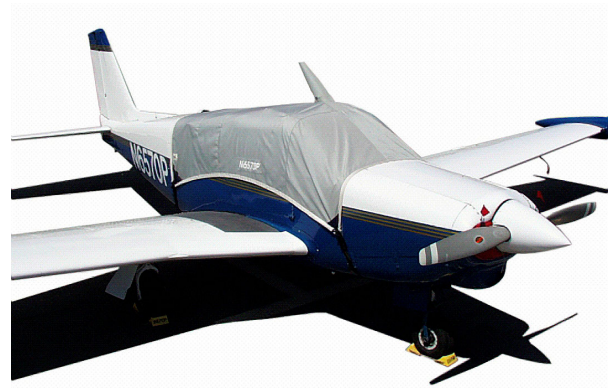
Piper Comanche Standard Canopy Cover & Engine Plugs