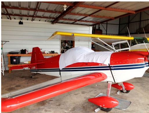
IAC One Design Canopy Cover, test fit cover

This cover type is made from Silver Acrylic Sunbrella canvas and is 100% lined with a soft and smooth microfiber. Bruce's Custom Covers developed this material combination especially for aircraft protection. The outer material is medium weight and treated for water resistance, UV resistance and anti-static buildup. The inner lining is a very soft and smooth microfiber to prevent scratching. The material is very reflective, and tests show that the cabin interior temperature can be reduced to near-ambient temperature on the hottest of days. It is water, ice and snow repellent, yet breathable to allow moisture to escape from between the cover and the aircraft surface.