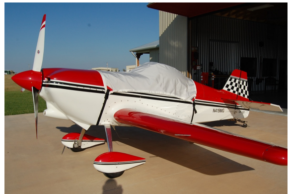
IAC One Design Canopy Cover