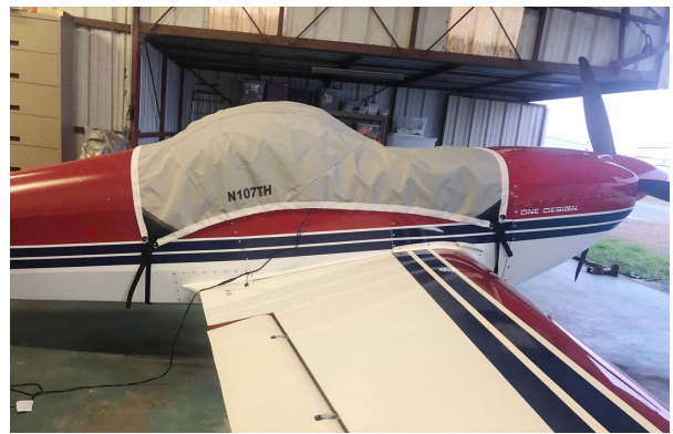
IAC One Design Travel Weight Canopy Cover