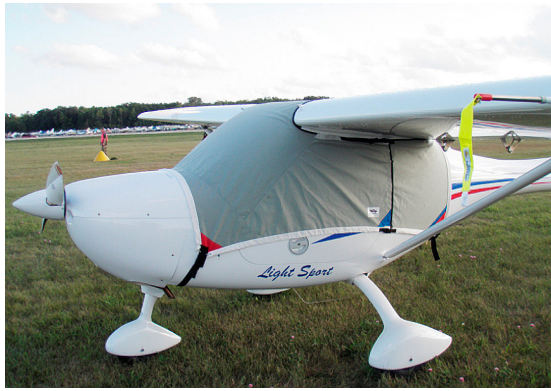
Remos G3 Travel Weight Canopy Cover