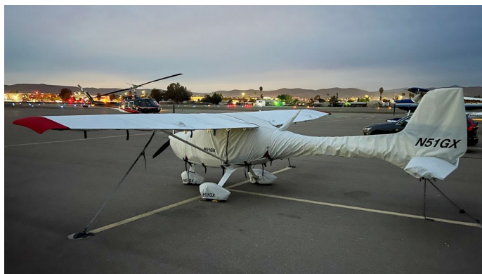
Remos RG-3 Complete Cover Set

WINTER USE MATERIAL - Made with Solution-Dyed Polyester fabric, this option is intended for seasonal use to aid in deicing, rain mitigation, or for occasional travel. The material is lighter and more compact, but more susceptible to UV damage and may have a shorter useful life if used continuously outside than the all-year use material.