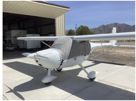
Remos G-3/600 Travel Cover