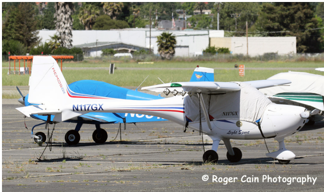
Remos GX Canopy Cover

This cover type is made from Silver Acrylic Sunbrella canvas and is 100% lined with a soft and smooth microfiber. Bruce's Custom Covers developed this material combination especially for aircraft protection. The outer material is medium weight and treated for water resistance, UV resistance and anti-static buildup. The inner lining is a very soft and smooth microfiber to prevent scratching. The material is very reflective, and tests show that the cabin interior temperature can be reduced to near-ambient temperature on the hottest of days. It is water, ice and snow repellent, yet breathable to allow moisture to escape from between the cover and the aircraft surface.