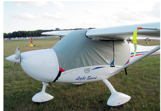
Remos G3 Travel Weight Canopy Cover