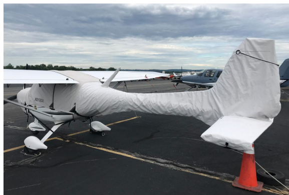
Remos G3 & GX MODELS Empennage Cover