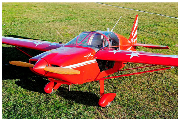
Covers, plugs & related items for the Rans S-10 Sakota