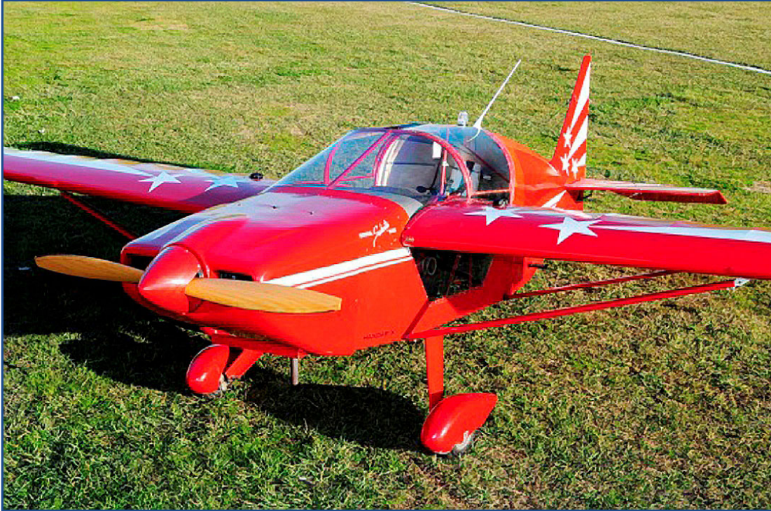
Covers, plugs &amp; related items for the Rans S-10 Sakota