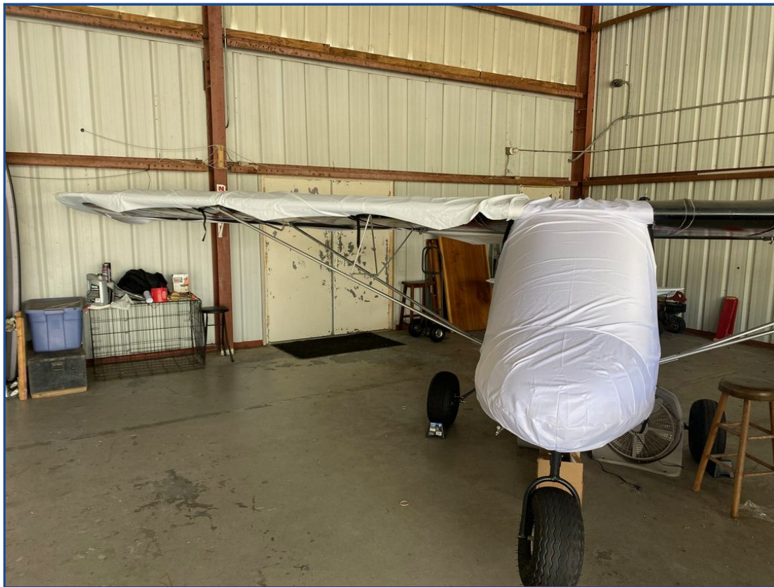
Rans S-12 Canopy/Nose &amp; Wing Covers, test fit