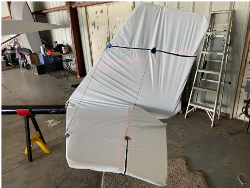
Rans S-12 Empennage Cover, test fit