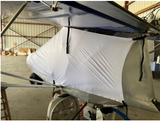
Rans S-12 Canopy/Nose Cover, test fit