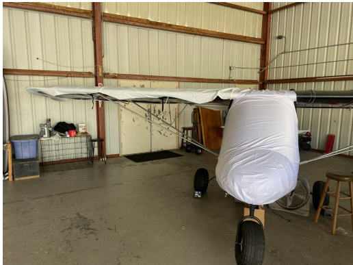
Rans S-12 Canopy/Nose & Wing Covers, test fit

WINTER USE MATERIAL - Made with Solution-Dyed Polyester fabric, this option is intended for seasonal use to aid in deicing, rain mitigation, or for occasional travel. The material is lighter and more compact, but more susceptible to UV damage and may have a shorter useful life if used continuously outside than the all-year use material.