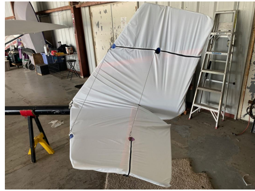
Rans S-12 Empennage Cover, test fit