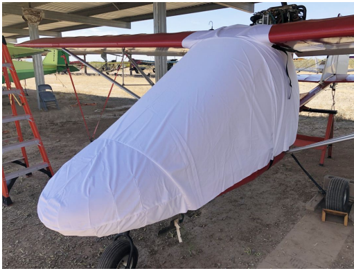
Rans S-12 Airaile Canopy/Nose Cover (test fit cover)