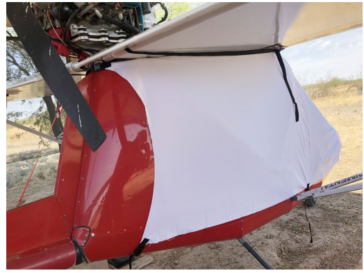
Rans S-12 Airaille Canopy/Nose Cover (test fit cover)