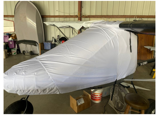
Rans S-12 Canopy/Nose Cover, test fit