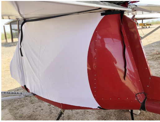
Rans S-12 Airaille Canopy/Nose Cover (test fit cover)