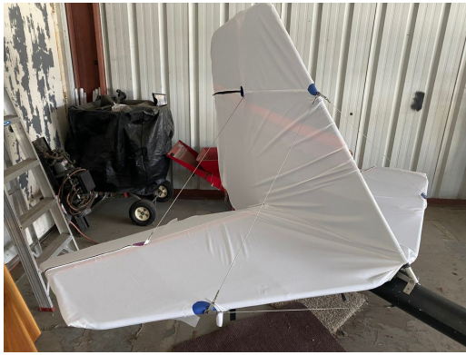
Rans S-12 Empennage Cover, test fit