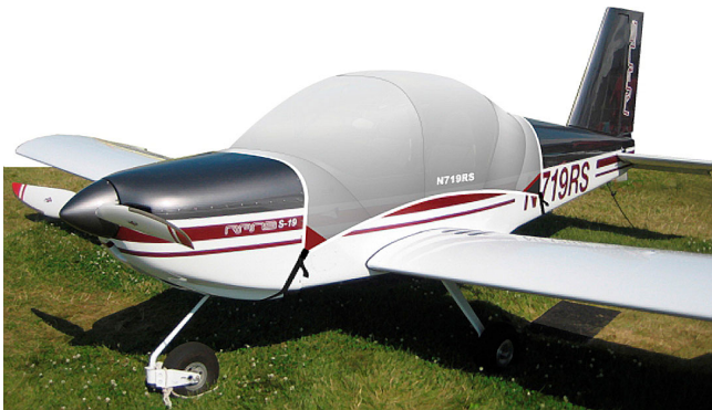
Rans S-19 Canopy Cover (illustration)