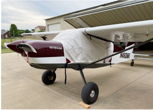
Rans S-21 Outbound Canopy Cover