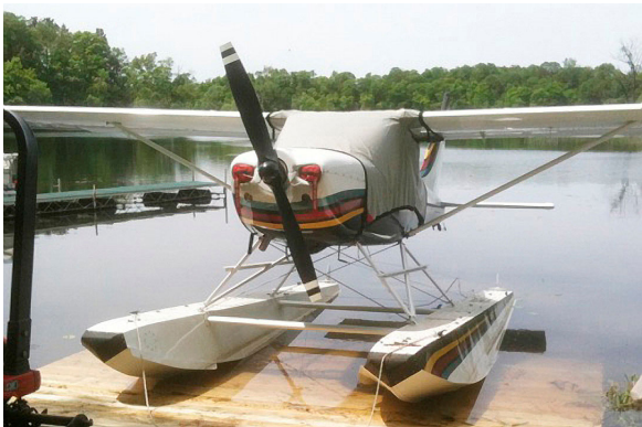
Glastar Sportsman Canopy Cover and Engine Plugs