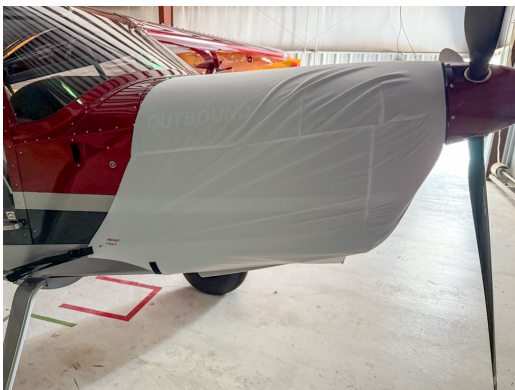
Rans S-21 Engine Cover, test fit cover