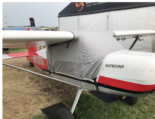
Rans S-21 Travel Canopy Cover