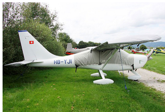
Glastar Canopy, Wings, Horizontal Stab. & Prop Covers