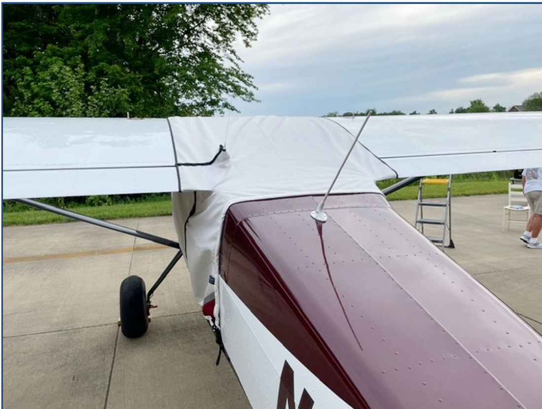
Rans S-21 Outbound Canopy Cover