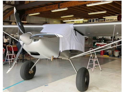
Rans S-20 Canopy Cover, test fit cover