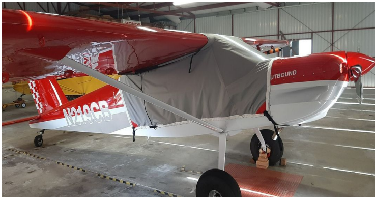
RANS S-21 Travel Weight Canopy Cover

Travel Covers are made with Silver Solution-Dyed Polyester fabric and only lined over the windshield to save weight. The material is lightweight and more compact for easy stowage in the aircraft. The polyester material is water resistant, but only intended for occasional use outside. We also have an ultra lightweight material available for fitted hangar dust covers. For daily outdoor use, the non-travel Sunbrella Cover is the best choice.