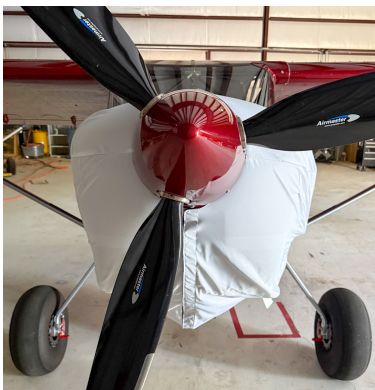
Rans S-21 Engine Cover, test fit cover

the hottest of days. It is water, ice and snow repellent, yet breathable to allow moisture to escape from between the cover and the aircraft surface.