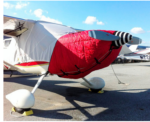
Glstar Insulated Engine Cover