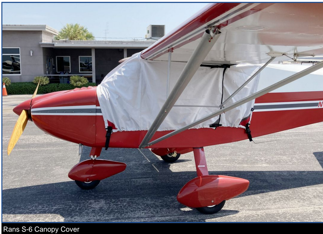
Rans S-6 Canopy Cover