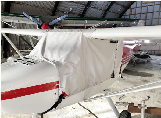
Rans S6S Coyote II Over The Top Style Canopy Cover