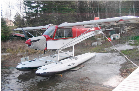
Rans S-7 Insulated Engine, Wing and Horizontal Stabilizer Covers