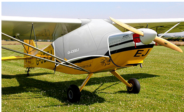
Rans Canopy Cover & Engine Plugs (illustration on a Rans S-7)