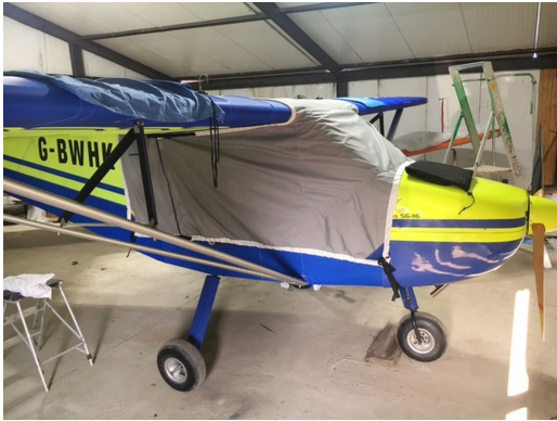
Rans S-6 Coyote Light Weight Travel Canopy Cover

lightweight and more compact for easy stowage in the aircraft. The polyester material is water resistant, but only intended for occasional use outside. We also have an ultra lightweight material available for fitted hangar dust covers. For daily outdoor use, the non-travel Sunbrella Cover is the best choice.