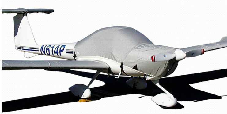
Diamond DA-20 Canopy/Engine, Wing & Horiz. Stab. Covers

This cover type is made from Silver Acrylic Sunbrella canvas and is 100% lined with a soft and smooth microfiber. Bruce's Custom Covers developed this material combination especially for aircraft protection. The outer material is medium weight and treated for water resistance, UV resistance and anti-static buildup. The inner lining is a very soft and smooth microfiber to prevent scratching. The material is very reflective, and tests show that the cabin interior temperature can be reduced to near-ambient temperature on the hottest of days. It is water, ice and snow repellent, yet breathable to allow moisture to escape from between the cover and the aircraft surface.