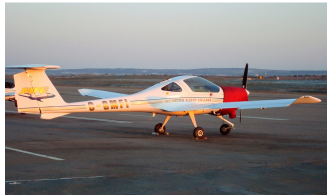
Diamond DA-20 Insulated Engine Cover