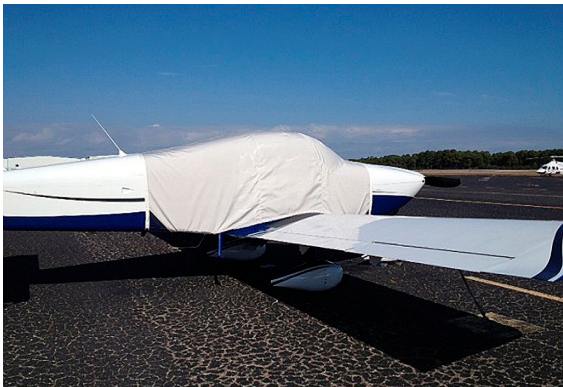
Van's RV-10 Extended Canopy Cover

This cover type is made from Silver Acrylic Sunbrella canvas and is 100% lined with a soft and smooth microfiber. Bruce's Custom Covers developed this material combination especially for aircraft protection. The outer material is medium weight and treated for water resistance, UV resistance and anti-static buildup. The inner lining is a very soft and smooth microfiber to prevent scratching. The material is very reflective, and tests show that the cabin interior temperature can be reduced to near-ambient temperature on the hottest of days. It is water, ice and snow repellent, yet breathable to allow moisture to escape from between the cover and the aircraft surface.