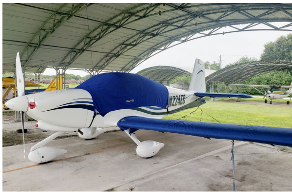
Vans's RV-10 Wing Covers