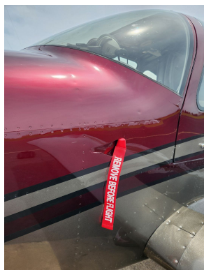
RV-10 Air Vent Wedge Plugs

Engine Inlet Plugs are custom fit for your Van's Aircraft RV-10 intakes, made with heavy-duty vinyl material, and stuffed with a single block of sculpted urethane foam. Each plug has a zipper that allows the foam to be removed and dried if necessary. Engine plugs have warning flags that are visible from the cockpit or 'remove before flight' streamers sewn onto the face of the plugs. Most plugs are imprinted with the aircraft registration number in black for an extra charge. Storage bag NOT included. Engine plugs may be inserted after flight when the engine is still warm. Engine Inlet Plugs are commonly referred to as Cowl Plugs, Intake Plugs, Cowl Blocks, Engine Blocks, and Engine Bungs.