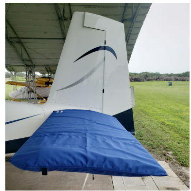
Van's RV-10 Horizontal Stabilizer Covers