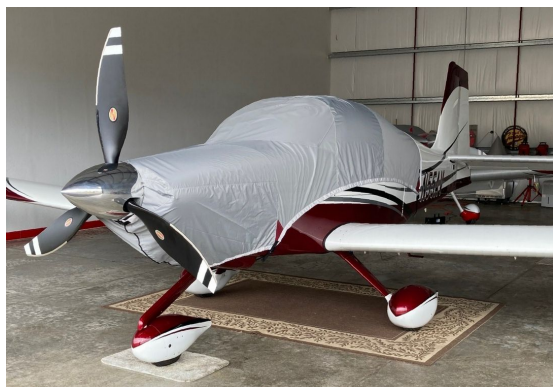
Van's RV-10 Travel Cover

Travel Covers are made with Silver Solution-Dyed Polyester fabric and only lined over the windshield to save weight. The material is lightweight and more compact for easy stowage in the aircraft. The polyester material is water resistant, but only intended for occasional use outside. We also have an ultra lightweight material available for fitted hangar dust covers. For daily outdoor use, the non-travel Sunbrella Cover is the best choice.