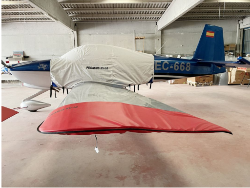
Van's RV-10 Extended Canopy Cover, Wingtip Pads

Designed to prevent damage to the aircraft extremities in crowded hangars, these products are made of bright red Naugahyde and thickly padded with a sandwich of closed cell foam.