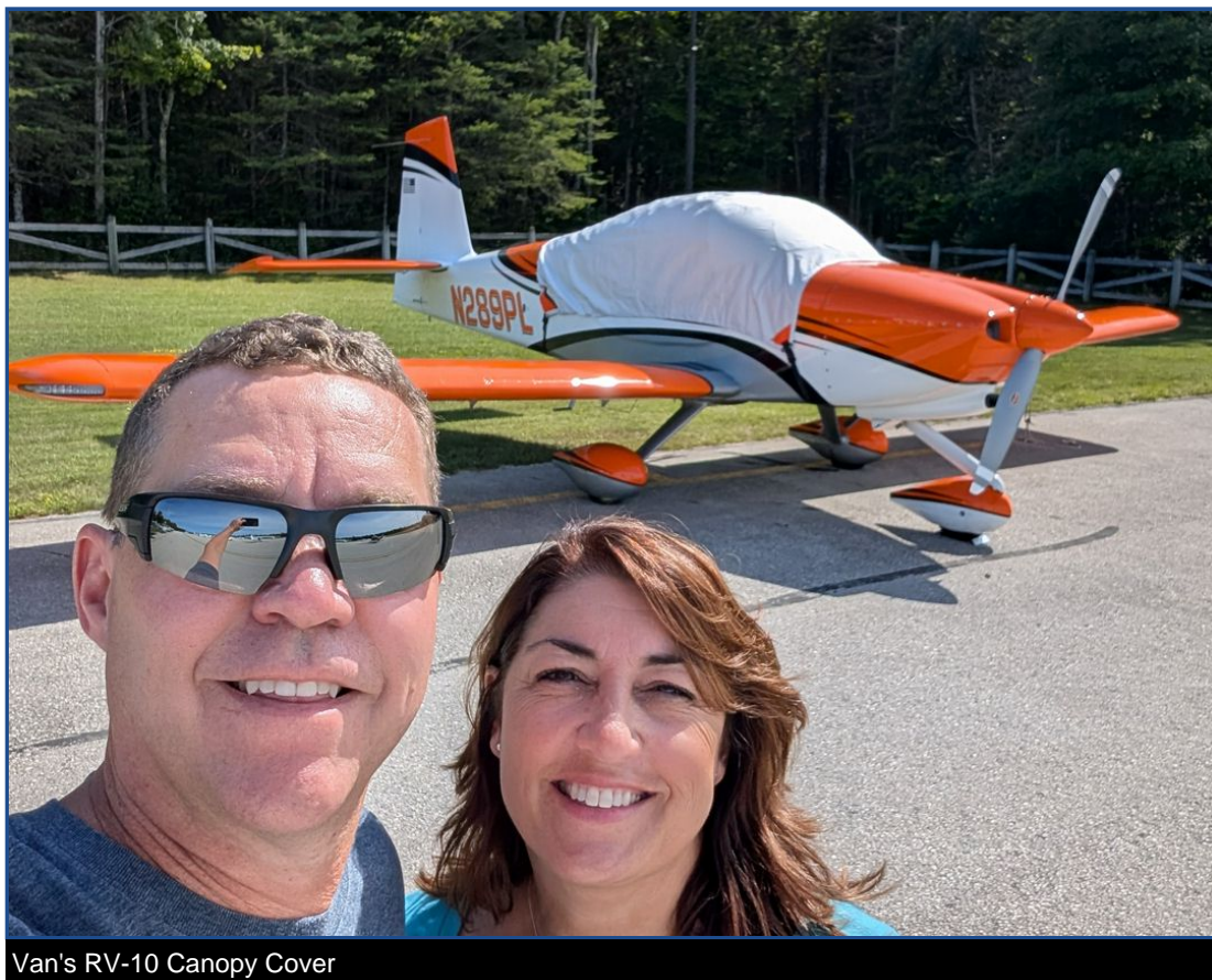
Van's RV-10 Canopy Cover