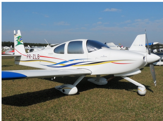
Van's RV-10 HeatShield Set