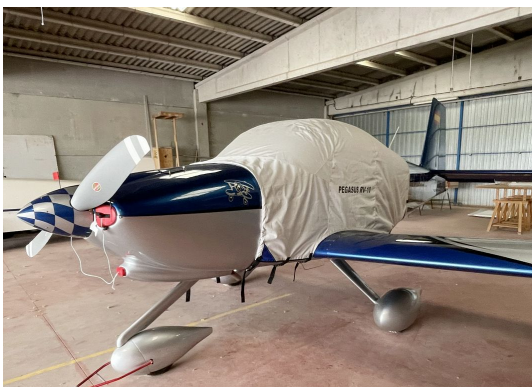
Van's RV-10 Extended Canopy Cover, Engine Plugs