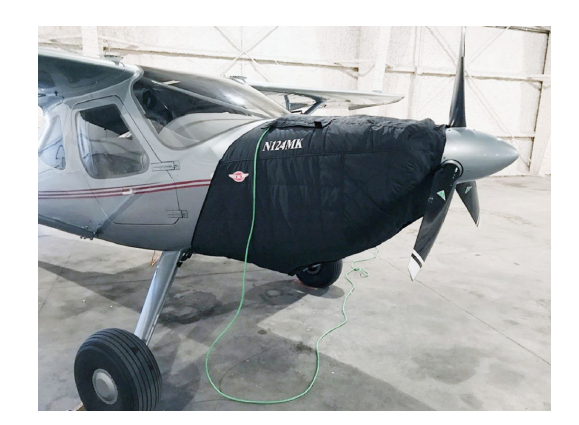
Glasair Aviation Glastar, Sportsman 2+2 Insulated Engine Cover

This cover type is made from Silver Acrylic Sunbrella canvas and is 100% lined with a soft and smooth microfiber. Bruce's Custom Covers developed this material combination especially for aircraft protection. The outer material is medium weight and treated for water resistance, UV resistance and anti-static buildup. The inner lining is a very soft and smooth microfiber to prevent scratching. The material is very reflective, and tests show that the cabin interior temperature can be reduced to near-ambient temperature on the hottest of days. It is water, ice and snow repellent, yet breathable to allow moisture to escape from between the cover and the aircraft surface.