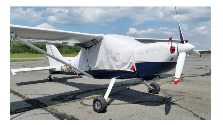
Glastar Over-Top Canopy Cover, Engine Plugs