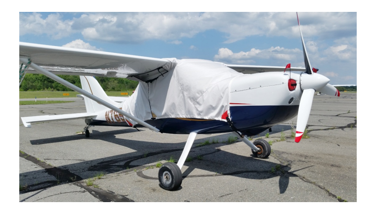
Glastar Over-Top Canopy Cover, Engine Plugs

Travel Covers are made with Silver Solution-Dyed Polyester fabric and only lined over the windshield to save weight. The material is lightweight and more compact for easy stowage in the aircraft. The polyester material is water resistant, but only intended for occasional use outside. We also have an ultra lightweight material available for fitted hangar dust covers. For daily outdoor use, the non-travel Sunbrella Cover is the best choice.