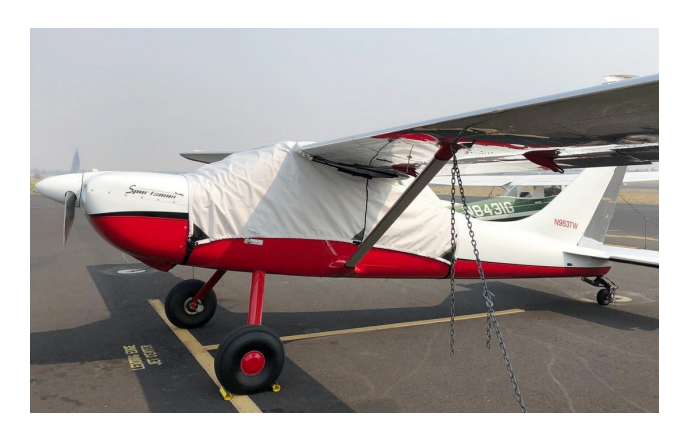
Glasair Sportsman 2+2 Over-Top Canopy Cover