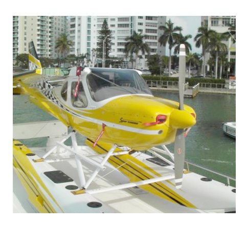
Glastar Engine Plugs

Engine Inlet Plugs are custom fit for your Van's Aircraft RV-15 intakes, made with heavy-duty vinyl material, and stuffed with a single block of sculpted urethane foam. Each plug has a zipper that allows the foam to be removed and dried if necessary. Engine plugs have warning flags that are visible from the cockpit or 'remove before flight' streamers sewn onto the face of the plugs. Most plugs are imprinted with the aircraft registration number in black for an extra charge. Storage bag NOT included. Engine plugs may be inserted after flight when the engine is still warm. Engine Inlet Plugs are commonly referred to as Cowl Plugs, Intake Plugs, Cowl Blocks, Engine Blocks, and Engine Bungs.