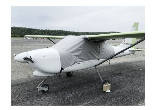
Glasair Aviation Glastar, Sportsman 2+2 Travel Cover, Light Weight Travel Canopy Cover