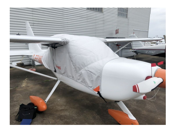
Glastar Canopy Cover, Engine Plugs

This cover type is made from Silver Acrylic Sunbrella canvas and is 100% lined with a soft and smooth microfiber. Bruce's Custom Covers developed this material combination especially for aircraft protection. The outer material is medium weight and treated for water resistance, UV resistance and anti-static buildup. The inner lining is a very soft and smooth microfiber to prevent scratching. The material is very reflective, and tests show that the cabin interior temperature can be reduced to near-ambient temperature on the hottest of days. It is water, ice and snow repellent, yet breathable to allow moisture to escape from between the cover and the aircraft surface.