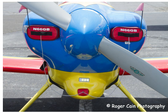
Van's RV-3 Engine Plugs