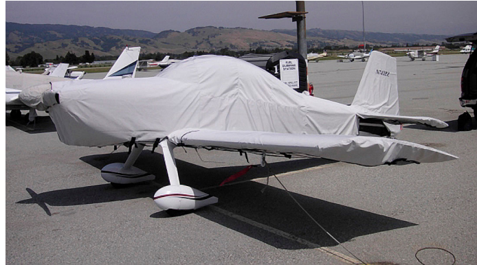
Van's RV-8 Complete Fuselage Cover w/ Detachable Wing Covers & Prop Cover