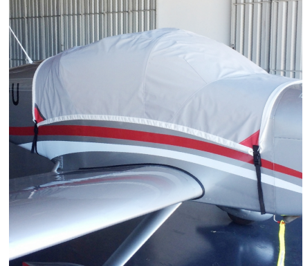
Vans's RV-9 Light Weight Travel Canopy Cover