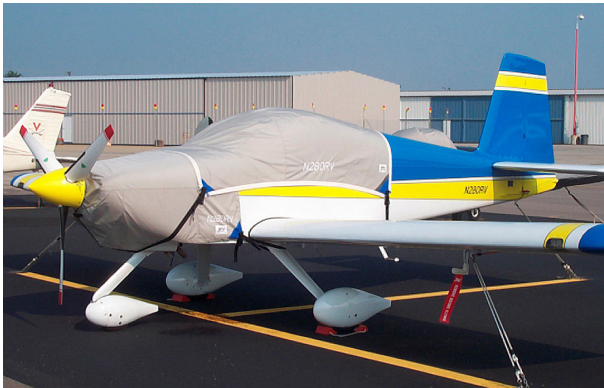
Van's RV-9 Canopy & Engine Covers