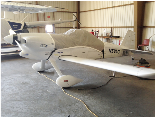
Van's RV-3 Light Weight Travel Cover

Travel Covers are made with Silver Solution-Dyed Polyester fabric and only lined over the windshield to save weight. The material is lightweight and more compact for easy stowage in the aircraft. The polyester material is water resistant, but only intended for occasional use outside. We also have an ultra lightweight material available for fitted hangar dust covers. For daily outdoor use, the non-travel Sunbrella Cover is the best choice.