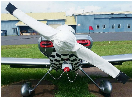
Van's RV-3 Engine Plugs, Prop/Spinner Cover