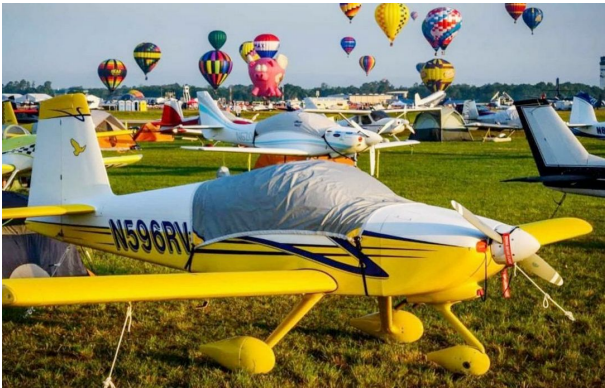
Vans's RV-9 Travel Weight Canopy Cover at Sun 'n Fun