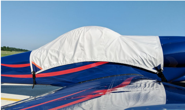
Van's RV-3 Canopy Cover