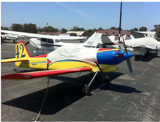
Vans's RV-3 Canopy Cover, Engine Plugs