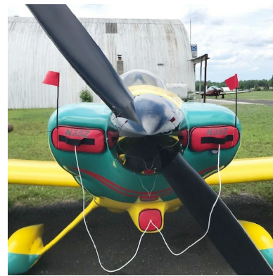
Van's Aircraft RV-4 Engine Inlet Plugs