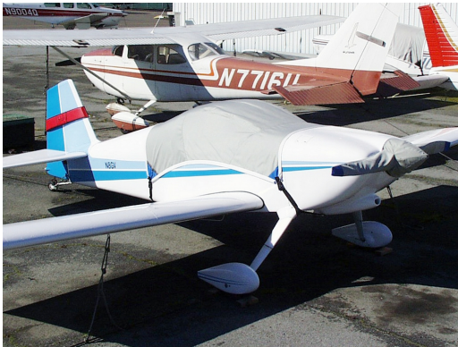
Vans's RV-6 Canopy Cover, Prop Cover

This cover type is made from Silver Acrylic Sunbrella canvas and is 100% lined with a soft and smooth microfiber. Bruce's Custom Covers developed this material combination especially for aircraft protection. The outer material is medium weight and treated for water resistance, UV resistance and anti-static buildup. The inner lining is a very soft and smooth microfiber to prevent scratching. The material is very reflective, and tests show that the cabin interior temperature can be reduced to near-ambient temperature on the hottest of days. It is water, ice and snow repellent, yet breathable to allow moisture to escape from between the cover and the aircraft surface.