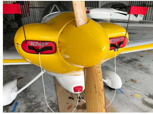
Van's RV-4 Engine Inlet Plugs