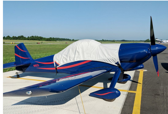
Van's RV-3 Canopy Cover