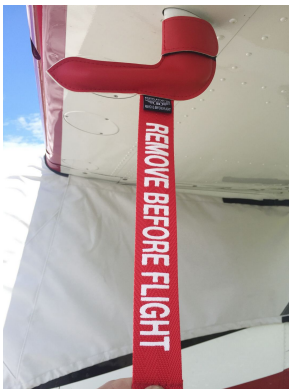
Cessna A185F Pitot Cover

Engine Inlet Plugs are custom fit for your Van's Aircraft RV-4 intakes, made with heavy-duty vinyl material, and stuffed with a single block of sculpted urethane foam. Each plug has a zipper that allows the foam to be removed and dried if necessary. Engine plugs have warning flags that are visible from the cockpit or 'remove before flight' streamers sewn onto the face of the plugs. Most plugs are imprinted with the aircraft registration number in black for an extra charge. Storage bag NOT included. Engine plugs may be inserted after flight when the engine is still warm. Engine Inlet Plugs are commonly referred to as Cowl Plugs, Intake Plugs, Cowl Blocks, Engine Blocks, and Engine Bungs.