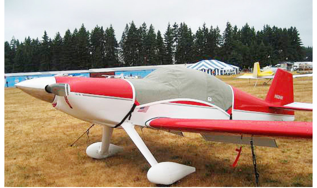
Harmon Rocket Canopy Cover & Engine Inlet Plugs