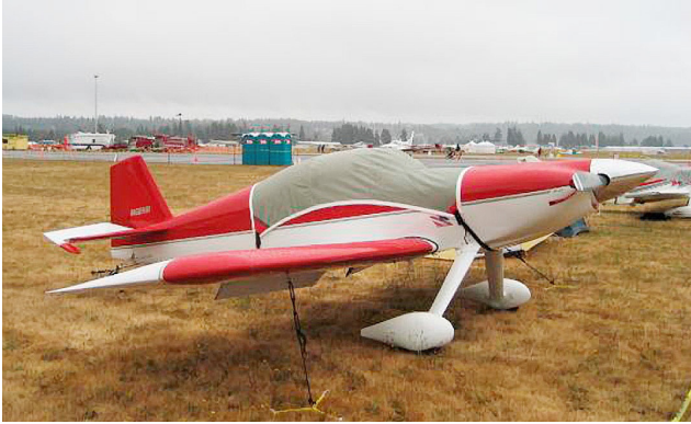
Harmon Rocket Canopy Cover & Engine Inlet Plugs

Travel Covers are made with Silver Solution-Dyed Polyester fabric and only lined over the windshield to save weight. The material is lightweight and more compact for easy stowage in the aircraft. The polyester material is water resistant, but only intended for occasional use outside. We also have an ultra lightweight material available for fitted hangar dust covers. For daily outdoor use, the non-travel Sunbrella Cover is the best choice.