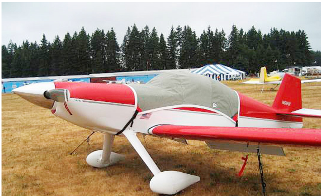
Harmon Rocket Canopy Cover & Engine Inlet Plugs

This cover type is made from Silver Acrylic Sunbrella canvas and is 100% lined with a soft and smooth microfiber. Bruce's Custom Covers developed this material combination especially for aircraft protection. The outer material is medium weight and treated for water resistance, UV resistance and anti-static buildup. The inner lining is a very soft and smooth microfiber to prevent scratching. The material is very reflective, and tests show that the cabin interior temperature can be reduced to near-ambient temperature on the hottest of days. It is water, ice and snow repellent, yet breathable to allow moisture to escape from between the cover and the aircraft surface.