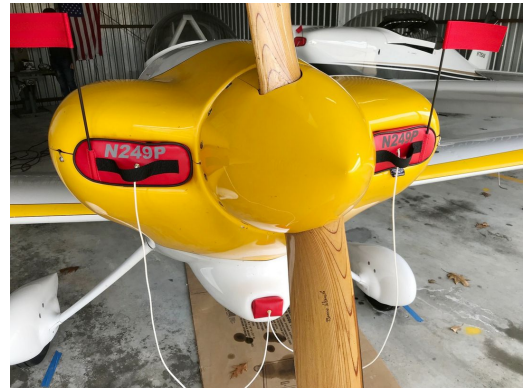
Van's RV-4 Engine Inlet Plugs