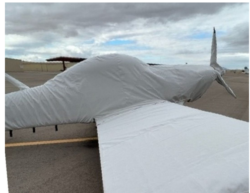
Vans RV-8 Complete Cover Set