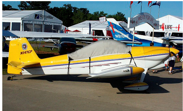
Van's RV-4 Canopy Cover