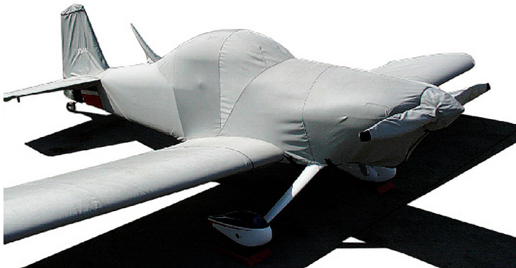
Van's RV-4 Complete Cover

This cover type is made from Silver Acrylic Sunbrella canvas and is 100% lined with a soft and smooth microfiber. Bruce's Custom Covers developed this material combination especially for aircraft protection. The outer material is medium weight and treated for water resistance, UV resistance and anti-static buildup. The inner lining is a very soft and smooth microfiber to prevent scratching. The material is very reflective, and tests show that the cabin interior temperature can be reduced to near-ambient temperature on the hottest of days. It is water, ice and snow repellent, yet breathable to allow moisture to escape from between the cover and the aircraft surface.