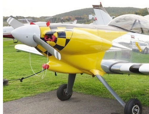
Vans RV-4 Engine Plugs