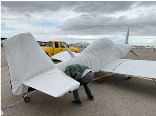
Vans RV-8 Complete Cover Set