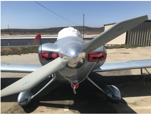
Van's RV-4 Engine Inlet Plugs

Engine Inlet Plugs are custom fit for your Van's Aircraft RV-4 intakes, made with heavy-duty vinyl material, and stuffed with a single block of sculpted urethane foam. Each plug has a zipper that allows the foam to be removed and dried if necessary. Engine plugs have warning flags that are visible from the cockpit or 'remove before flight' streamers sewn onto the face of the plugs. Most plugs are imprinted with the aircraft registration number in black for an extra charge. Storage bag NOT included. Engine plugs may be inserted after flight when the engine is still warm. Engine Inlet Plugs are commonly referred to as Cowl Plugs, Intake Plugs, Cowl Blocks, Engine Blocks, and Engine Bungs.