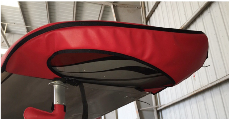
Cirrus SR-20/22 Wingtip Pads

Designed to prevent damage to the aircraft extremities in crowded hangars, these products are made of bright red Naugahyde and thickly padded with a sandwich of closed cell foam.