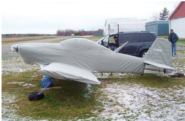
Van's RV-4 Complete Fuselage/Wing/Tail Surfaces cover

This cover type is made from Silver Acrylic Sunbrella canvas and is 100% lined with a soft and smooth microfiber. Bruce's Custom Covers developed this material combination especially for aircraft protection. The outer material is medium weight and treated for water resistance, UV resistance and anti-static buildup. The inner lining is a very soft and smooth microfiber to prevent scratching. The material is very reflective, and tests show that the cabin interior temperature can be reduced to near-ambient temperature on the hottest of days. It is water, ice and snow repellent, yet breathable to allow moisture to escape from between the cover and the aircraft surface.