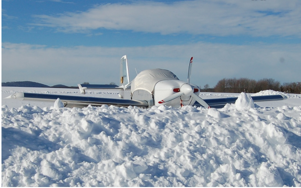
Van's RV-6 Canopy Cover

Travel Covers are made with Silver Solution-Dyed Polyester fabric and only lined over the windshield to save weight. The material is lightweight and more compact for easy stowage in the aircraft. The polyester material is water resistant, but only intended for occasional use outside. We also have an ultra lightweight material available for fitted hangar dust covers. For daily outdoor use, the non-travel Sunbrella Cover is the best choice.