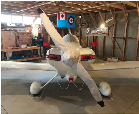
Van's RV-4 Prop Cover, Engine Inlet Plugs

Engine Inlet Plugs are custom fit for your Van's Aircraft RV-4 intakes, made with heavy-duty vinyl material, and stuffed with a single block of sculpted urethane foam. Each plug has a zipper that allows the foam to be removed and dried if necessary. Engine plugs have warning flags that are visible from the cockpit or 'remove before flight' streamers sewn onto the face of the plugs. Most plugs are imprinted with the aircraft registration number in black for an extra charge. Storage bag NOT included. Engine plugs may be inserted after flight when the engine is still warm. Engine Inlet Plugs are commonly referred to as Cowl Plugs, Intake Plugs, Cowl Blocks, Engine Blocks, and Engine Bungs.