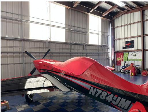
Gamebird GB-1 Solar Cap (single place), CUSTOM COVERS & IMPRINTING AVAILABLE!

Travel Covers are made with Silver Solution-Dyed Polyester fabric and only lined over the windshield to save weight. The material is lightweight and more compact for easy stowage in the aircraft. The polyester material is water resistant, but only intended for occasional use outside. We also have an ultra lightweight material available for fitted hangar dust covers. For daily outdoor use, the non-travel Sunbrella Cover is the best choice.