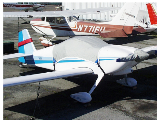
Vans's RV-6 Canopy Cover, Prop Cover