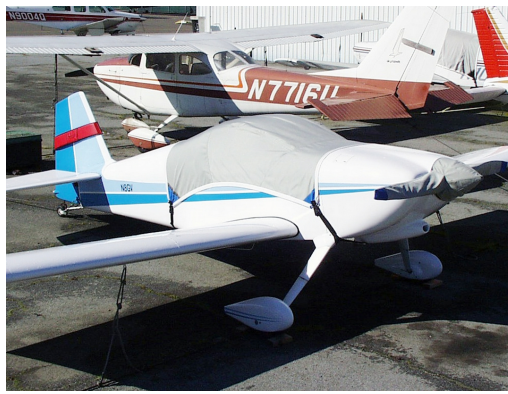
Vans's RV-6 Canopy Cover, Prop Cover