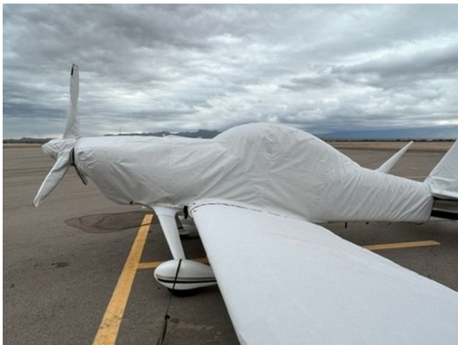
Vans RV-8 Complete Cover Set

This cover type is made from Silver Acrylic Sunbrella canvas and is 100% lined with a soft and smooth microfiber. Bruce's Custom Covers developed this material combination especially for aircraft protection. The outer material is medium weight and treated for water resistance, UV resistance and anti-static buildup. The inner lining is a very soft and smooth microfiber to prevent scratching. The material is very reflective, and tests show that the cabin interior temperature can be reduced to near-ambient temperature on the hottest of days. It is water, ice and snow repellent, yet breathable to allow moisture to escape from between the cover and the aircraft surface.