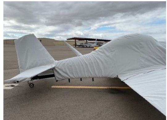
Vans RV-8 Complete Cover Set