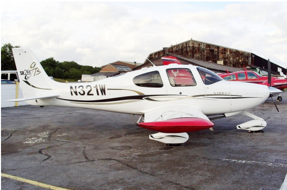
Cirrus SR-20/22 Wingtip Pads