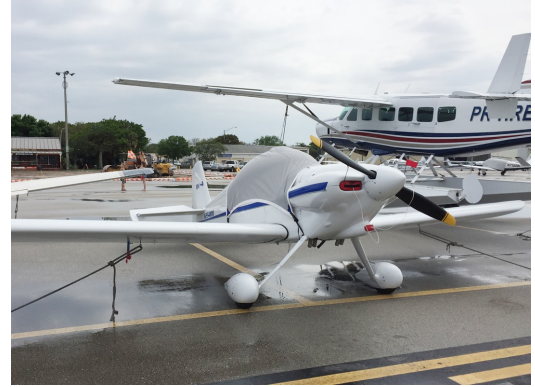
Van's RV-4/Harmon Rocket Travel Cover