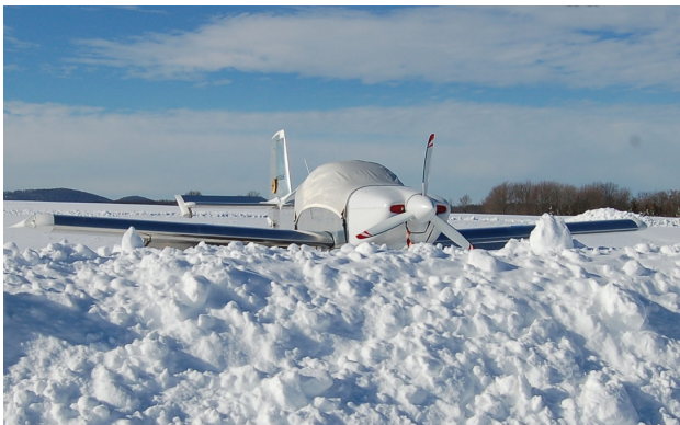
Van's RV-6 Canopy Cover