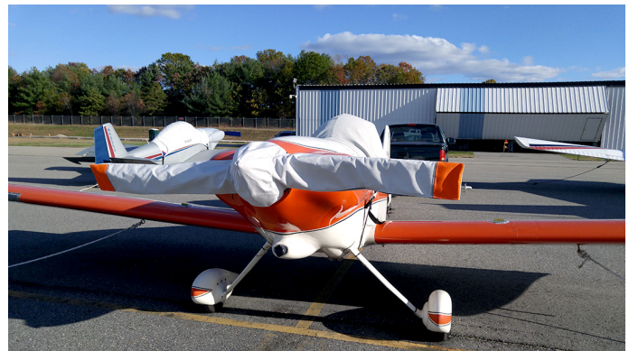
Van's Aircraft RV-4 Propeller/Spinner Cover, 2 Blade