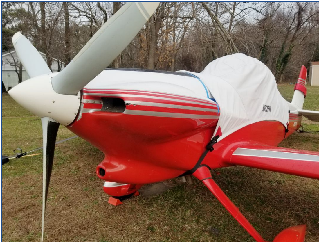
Vans RV-4 Canopy Cover