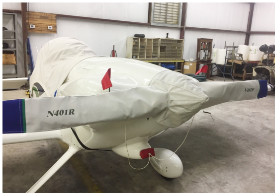
Van's Aircraft RV-4 Propellor/Spinner Cover, 2 Blade

This cover type is made from Silver Acrylic Sunbrella canvas and is 100% lined with a soft and smooth microfiber. Bruce's Custom Covers developed this material combination especially for aircraft protection. The outer material is medium weight and treated for water resistance, UV resistance and anti-static buildup. The inner lining is a very soft and smooth microfiber to prevent scratching. The material is very reflective, and tests show that the cabin interior temperature can be reduced to near-ambient temperature on the hottest of days. It is water, ice and snow repellent, yet breathable to allow moisture to escape from between the cover and the aircraft surface.