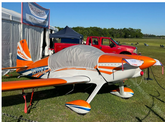
Van's RV-7 Travel Weight Canopy Cover

Travel Covers are made with Silver Solution-Dyed Polyester fabric and only lined over the windshield to save weight. The material is lightweight and more compact for easy stowage in the aircraft. The polyester material is water resistant, but only intended for occasional use outside. We also have an ultra lightweight material available for fitted hangar dust covers. For daily outdoor use, the non-travel Sunbrella Cover is the best choice.