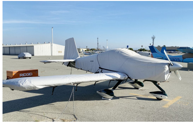
Van's RV-9A Extended Canopy/Engine, Wing & Empennage Covers