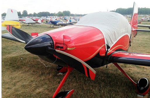
Van's RV-7 Canopy Cover & Engine Inlet Plugs

This cover type is made from Silver Acrylic Sunbrella canvas and is 100% lined with a soft and smooth microfiber. Bruce's Custom Covers developed this material combination especially for aircraft protection. The outer material is medium weight and treated for water resistance, UV resistance and anti-static buildup. The inner lining is a very soft and smooth microfiber to prevent scratching. The material is very reflective, and tests show that the cabin interior temperature can be reduced to near-ambient temperature on the hottest of days. It is water, ice and snow repellent, yet breathable to allow moisture to escape from between the cover and the aircraft surface.