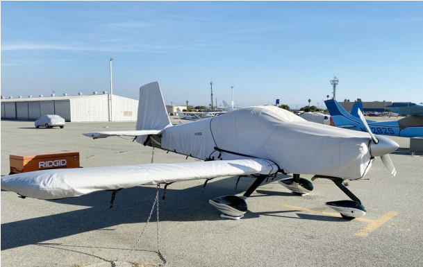
Van's RV-9A Extended Canopy/Engine, Wing & Empennage Covers