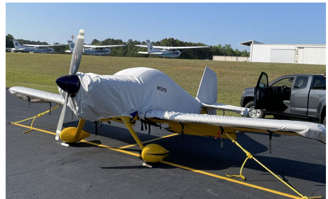
RV7 Complete fuselage cover w/detachable wing covers