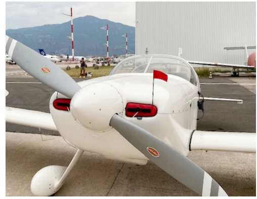
Van's RV7/7A Engine Inlet Plugs