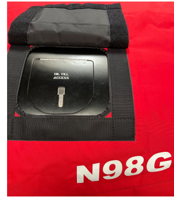
Van's Aircraft RV-7/7A Insulated Engine Cover