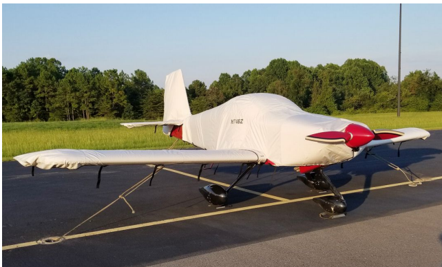
Van's RV-7A Complete Cover Set

This cover type is made from Silver Acrylic Sunbrella canvas and is 100% lined with a soft and smooth microfiber. Bruce's Custom Covers developed this material combination especially for aircraft protection. The outer material is medium weight and treated for water resistance, UV resistance and anti-static buildup. The inner lining is a very soft and smooth microfiber to prevent scratching. The material is very reflective, and tests show that the cabin interior temperature can be reduced to near-ambient temperature on the hottest of days. It is water, ice and snow repellent, yet breathable to allow moisture to escape from between the cover and the aircraft surface.