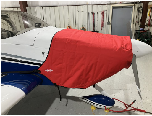
Van's Aircraft RV-7A Insulated Engine Cover