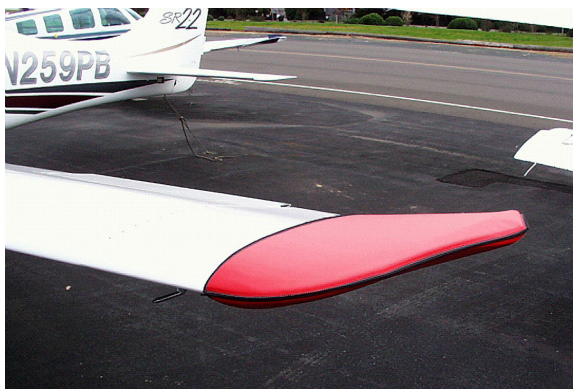
Cirrus SR-22 Wingtip Pad (also available for the Horiz. Stab.)

Designed to prevent damage to the aircraft extremities in crowded hangars, these products are made of bright red Naugahyde and thickly padded with a sandwich of closed cell foam.