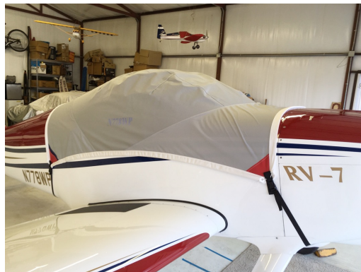
Van's RV-7 Travel Canopy Cover