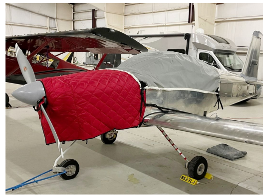
Vans RV-7 Travel Canopy Cover, Hangar Blanket