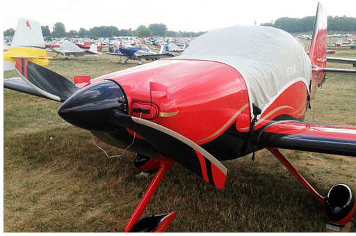
Van's RV-7 Canopy Cover & Engine Inlet Plugs