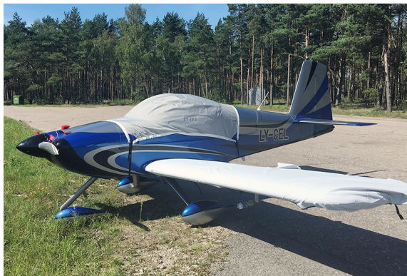
Van's RV-7/7A Travel and Wing Covers

Travel Covers are made with Silver Solution-Dyed Polyester fabric and only lined over the windshield to save weight. The material is lightweight and more compact for easy stowage in the aircraft. The polyester material is water resistant, but only intended for occasional use outside. We also have an ultra lightweight material available for fitted hangar dust covers. For daily outdoor use, the non-travel Sunbrella Cover is the best choice.