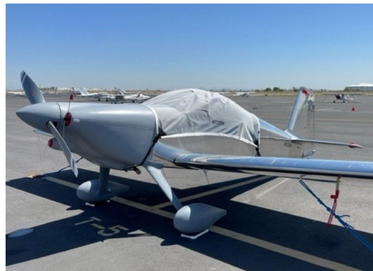
RV-7 Travel Cover, Travel Weight Canopy Cover