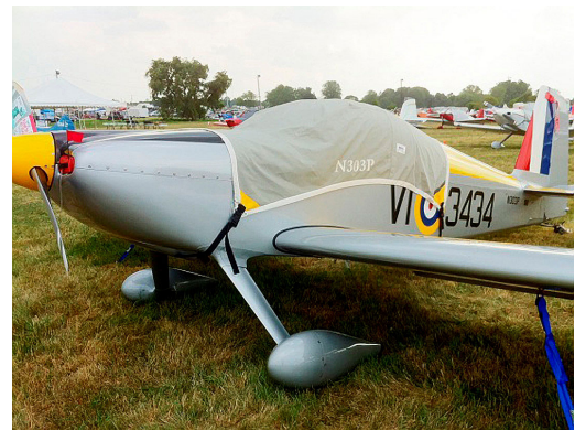
Van's RV-7 Canopy Cover & Engine Inlet Plugs