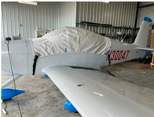
Van's RV-7 Canopy Cover

This cover type is made from Silver Acrylic Sunbrella canvas and is 100% lined with a soft and smooth microfiber. Bruce's Custom Covers developed this material combination especially for aircraft protection. The outer material is medium weight and treated for water resistance, UV resistance and anti-static buildup. The inner lining is a very soft and smooth microfiber to prevent scratching. The material is very reflective, and tests show that the cabin interior temperature can be reduced to near-ambient temperature on the hottest of days. It is water, ice and snow repellent, yet breathable to allow moisture to escape from between the cover and the aircraft surface.