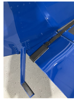
Van's Aircraft RV-7A Insulated Engine Cover