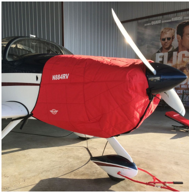
Van's RV-9A Insulated Engine Cover