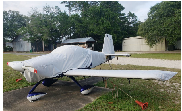
Van's RV-7A Cover Set