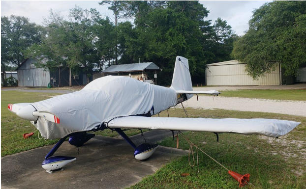
Van's RV-7A Cover Set

WINTER USE MATERIAL - Made with Solution-Dyed Polyester fabric, this option is intended for seasonal use to aid in deicing, rain mitigation, or for occasional travel. The material is lighter and more compact, but more susceptible to UV damage and may have a shorter useful life if used continuously outside than the all-year use material.