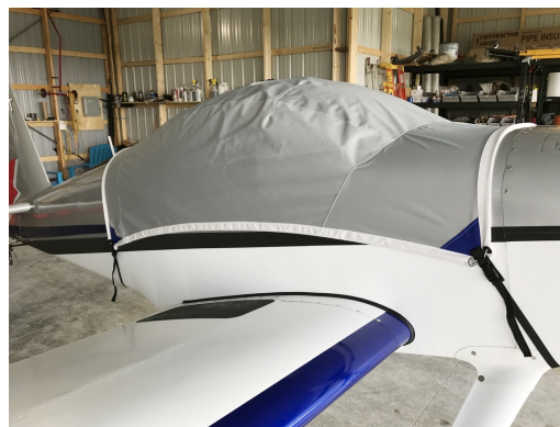
Van's Aircraft RV-9 Travel Cover, Light Weight Travel Canopy Cover