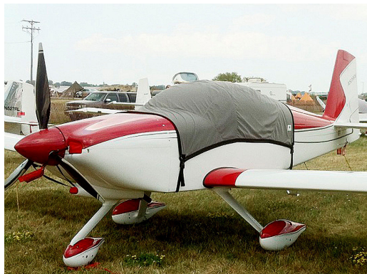
Van's RV-9 Travel Canopy Cover

Travel Covers are made with Silver Solution-Dyed Polyester fabric and only lined over the windshield to save weight. The material is lightweight and more compact for easy stowage in the aircraft. The polyester material is water resistant, but only intended for occasional use outside. We also have an ultra lightweight material available for fitted hangar dust covers. For daily outdoor use, the non-travel Sunbrella Cover is the best choice.