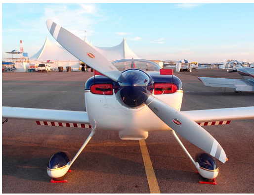
Van's RV-7 Engine Inlet Plugs