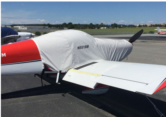
Van's RV-6A Extended Canopy/Engine Cover

This cover type is made from Silver Acrylic Sunbrella canvas and is 100% lined with a soft and smooth microfiber. Bruce's Custom Covers developed this material combination especially for aircraft protection. The outer material is medium weight and treated for water resistance, UV resistance and anti-static buildup. The inner lining is a very soft and smooth microfiber to prevent scratching. The material is very reflective, and tests show that the cabin interior temperature can be reduced to near-ambient temperature on the hottest of days. It is water, ice and snow repellent, yet breathable to allow moisture to escape from between the cover and the aircraft surface.